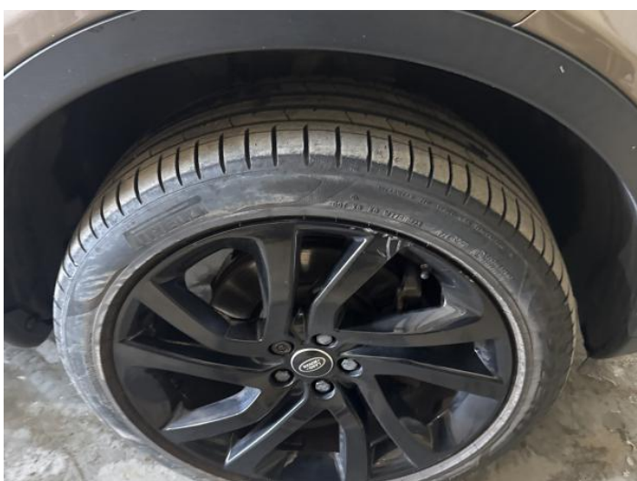
13: Wheel osf Scratched Over 50mm