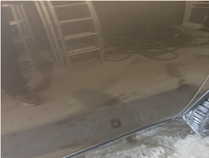
15: Door osf Chipped 1 To 5