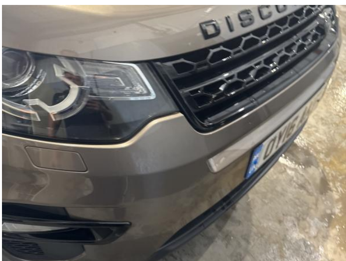
11: Bumper Front Chipped Multiple Chips