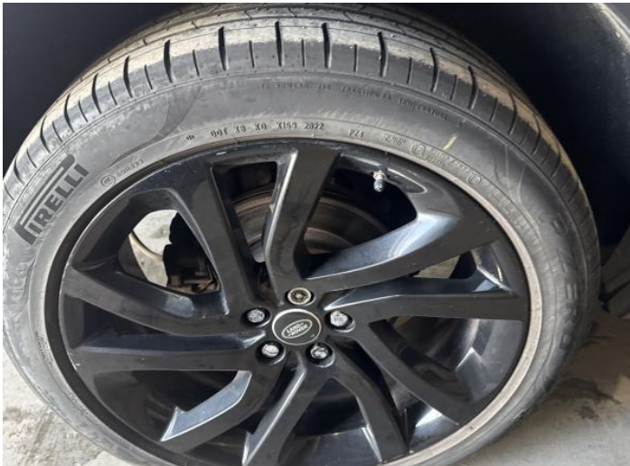
18: Wheel osr Scratched Up To 50mm

Carpet Condition Average Seat Condition Average