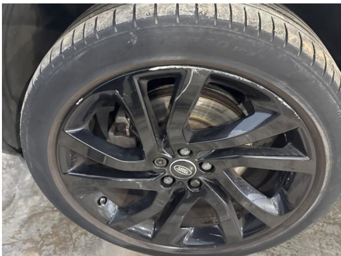
9: Wheel nsf Scratched Over 50mm