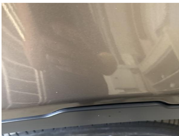
14: Wing osf Chipped 1 To 5