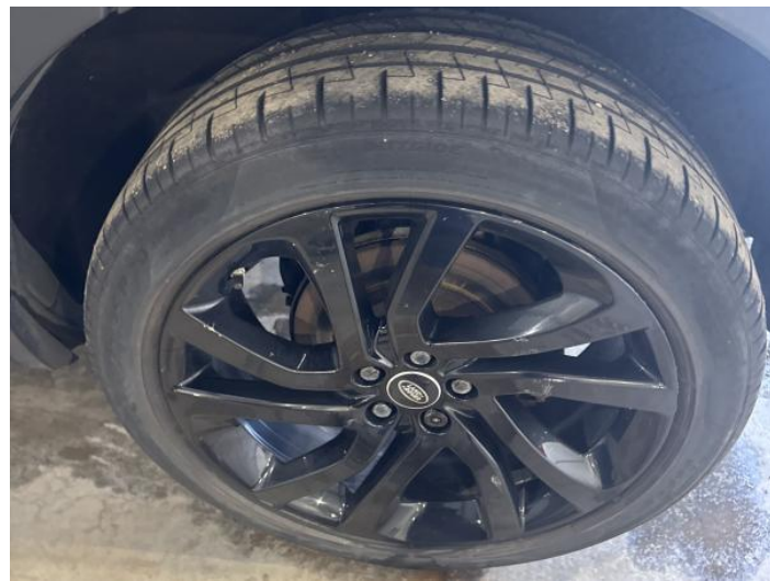
5: Wheel nsr Scratched Over 50mm