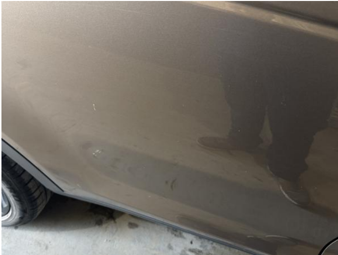
16: Door osr Chipped 1 To 5