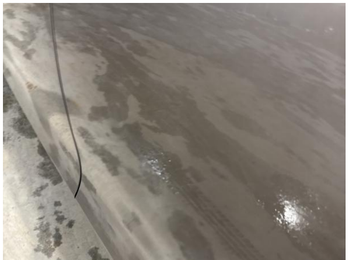
6: Door nsr Dented Between 10mm + 30mm