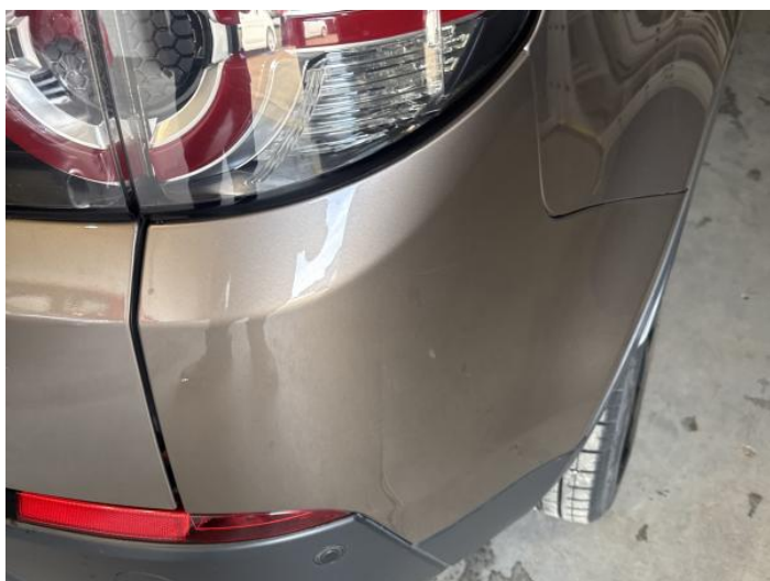
1: Bumper Rear Chipped Multiple Chips