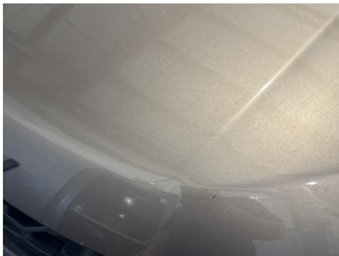
10: Bonnet Chipped 1 To 5