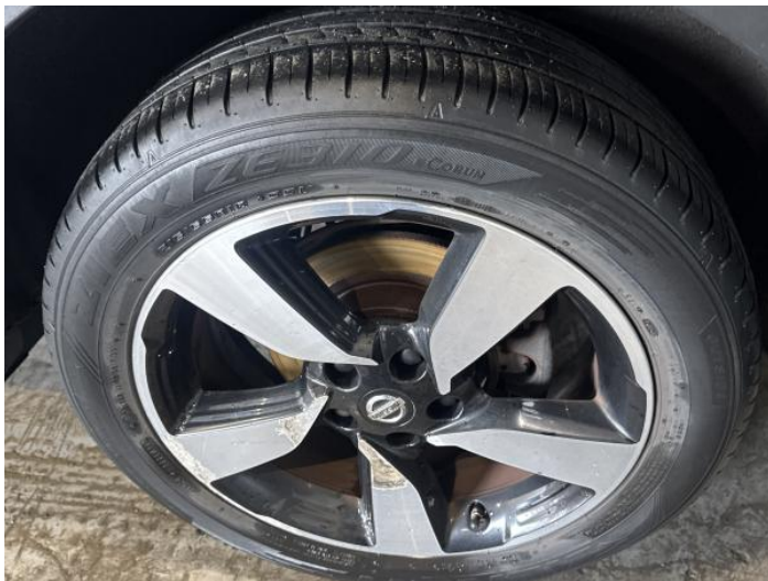
9: Wheel nsr Corroded Light