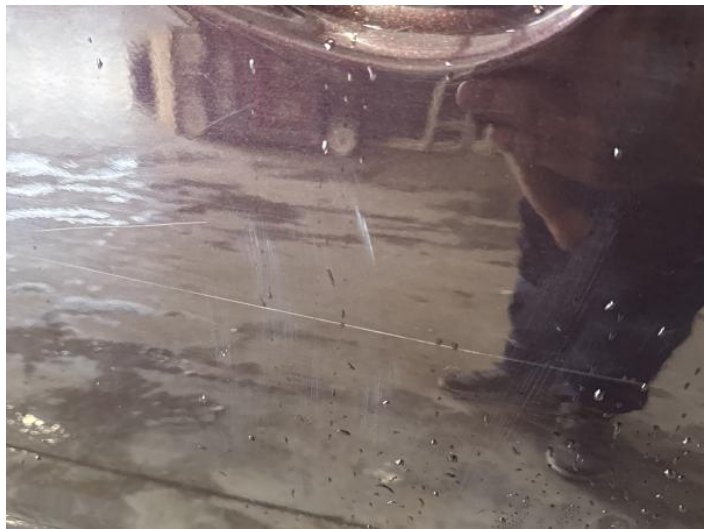
5: Wing nsf Scratched Over 25mm Not Thru Paint