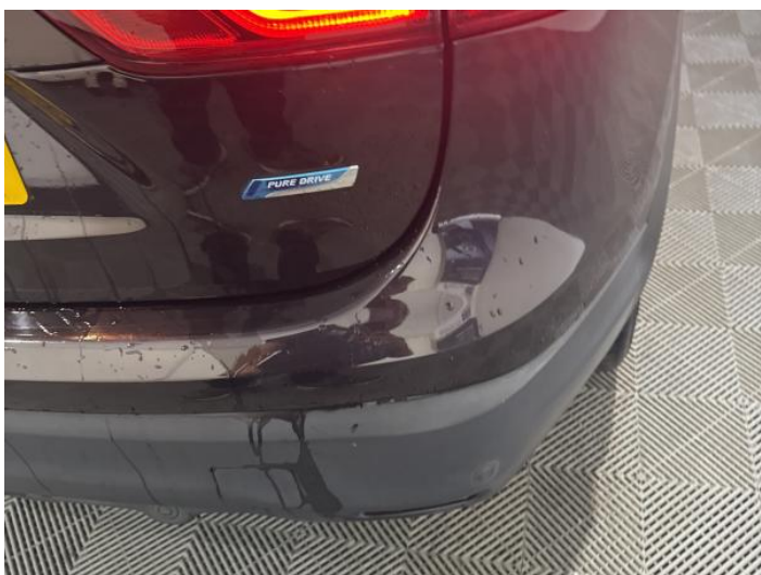
19: Bumper Rear Chipped Multiple Chips