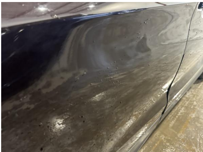
15: Door osr Dented Over 2 UpTo 10mm