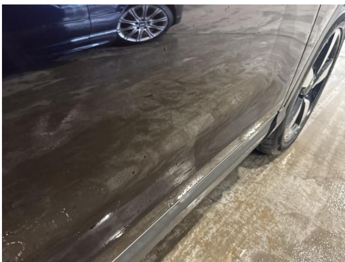
13: Door osf Dented Over 2 UpTo 10mm