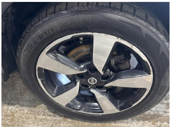
12: Wheel osf Scratched Over 50mm