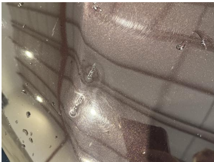
1: Bonnet Dented With Paint Damage