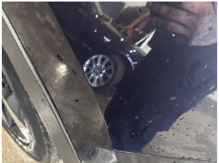
10: Wing osf Chipped 1 To 5