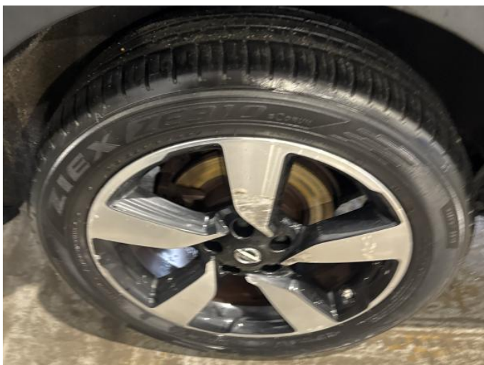
17: Wheel osr Scratched Over 50mm