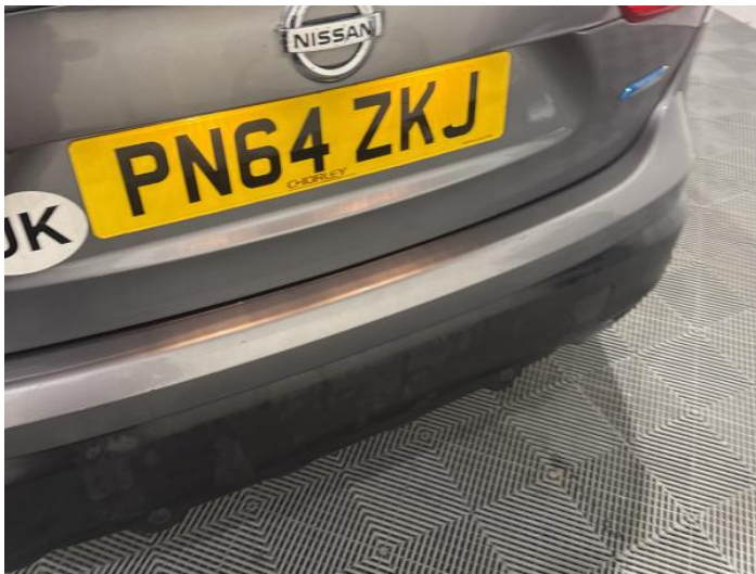
9: Bumper Rear Chipped Multiple Chips