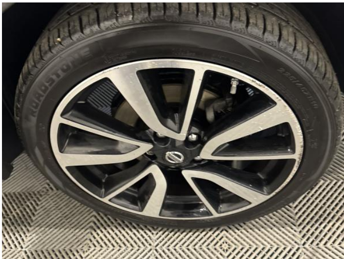
15: Wheel of Scratched Over 50mm