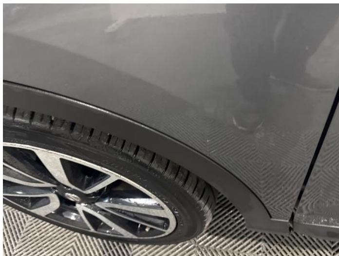
4: Wing nsf Chipped 1 To 5