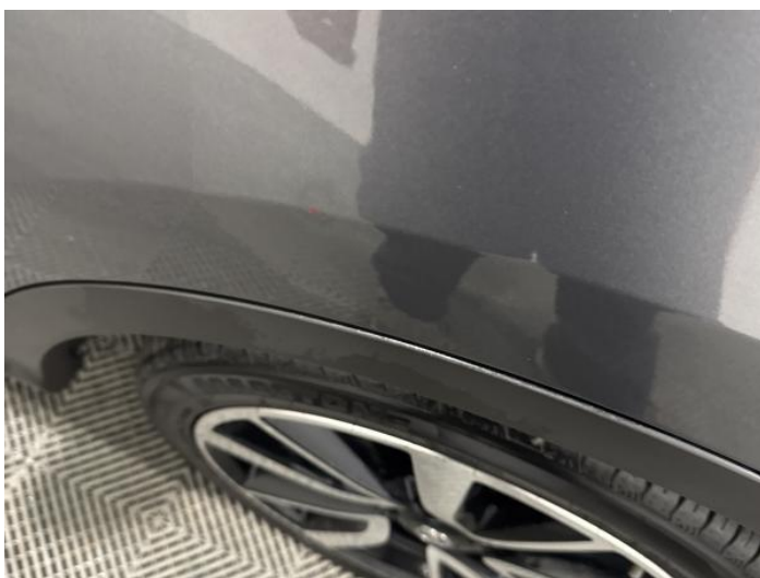
13: Wing osf Chipped 1 To 5