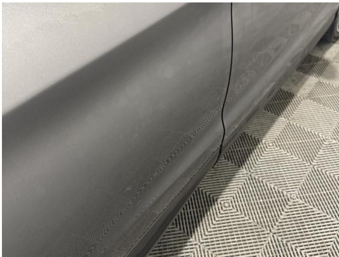
11: Door osr Dented Over 2 UpTo 10mm