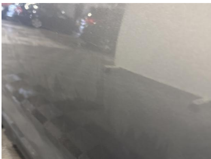
5: Door nsf Chipped 1 To 5