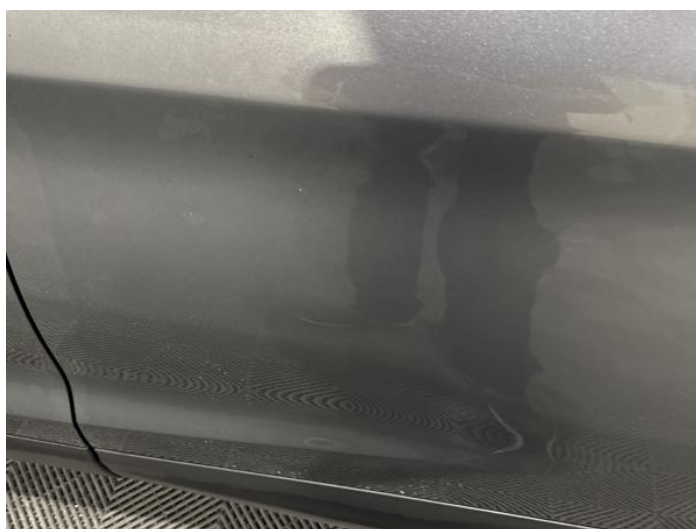
6: Door nsr Chipped 1 To 5