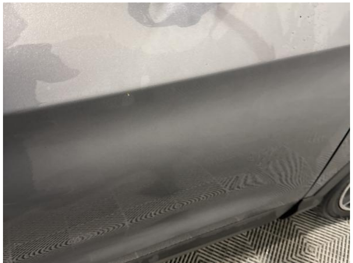
12: Door osf Chipped 1 To 5