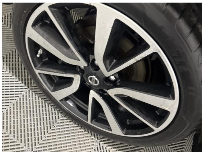
14: Wheel osr Scratched Over 50mm