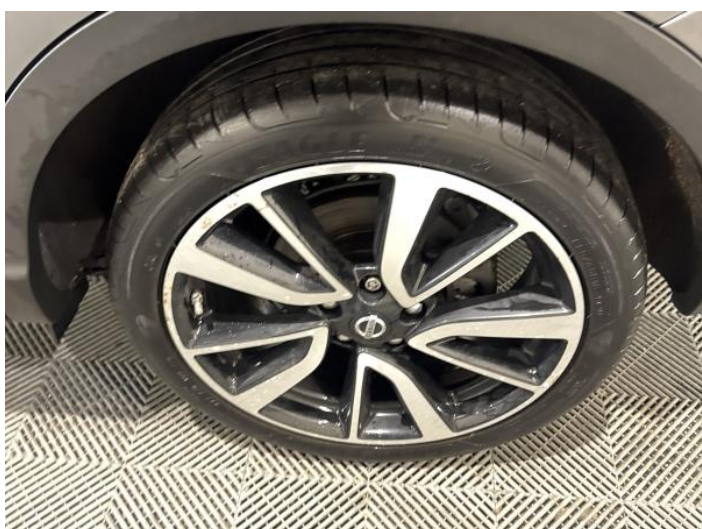
7: Wheel nsr Scratched Over 50mm