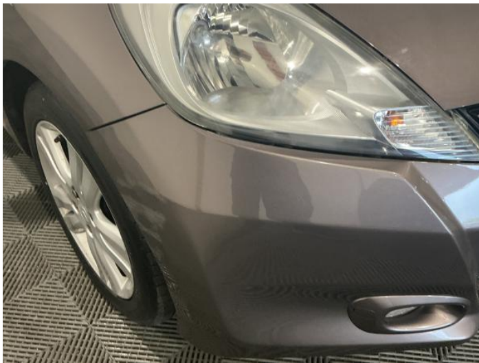
9: Bumper Front Scratched Over 100mm Thru Paint