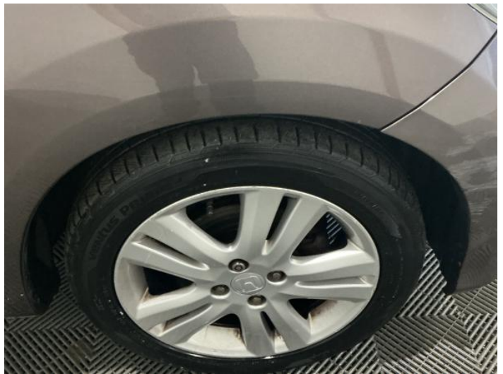
10: Wheel osf Scratched Over 50mm