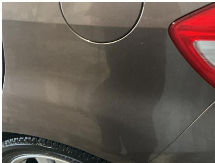
2: Qtr Panel nsr Dented Over 2 UpTo 10mm