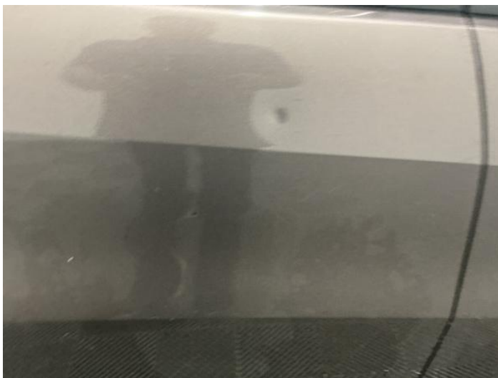
13: Door osr Dented Between 10mm + 30mm