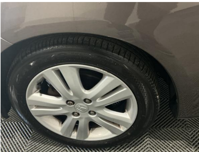
7: Wheel nsf Scratched Over 50mm