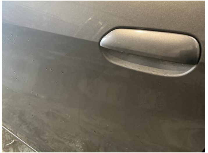
4: Door nsr Dented With Paint Damage