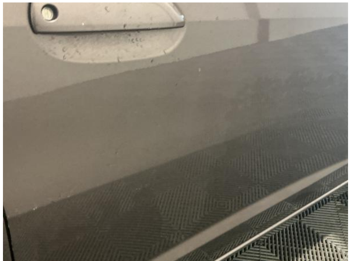
12: Door osf Chipped Multiple Chips