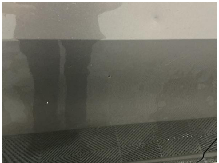
14: Door osr Chipped 1 To 5