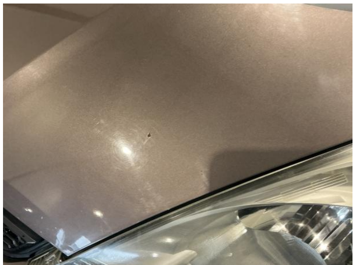
8: Bonnet Chipped 1 To 5