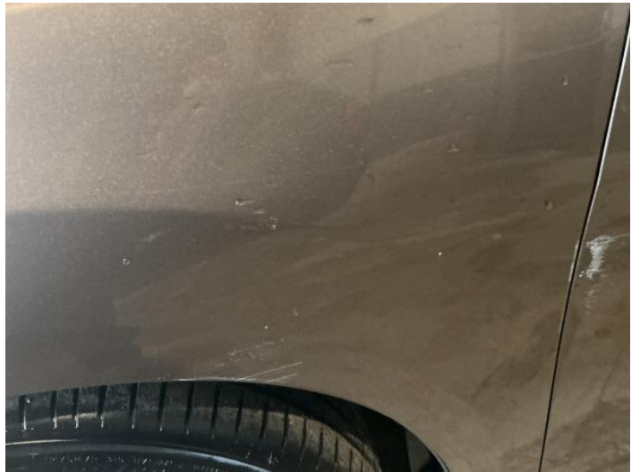
6: Wing nsf Scratched Over 25mm Thru Paint