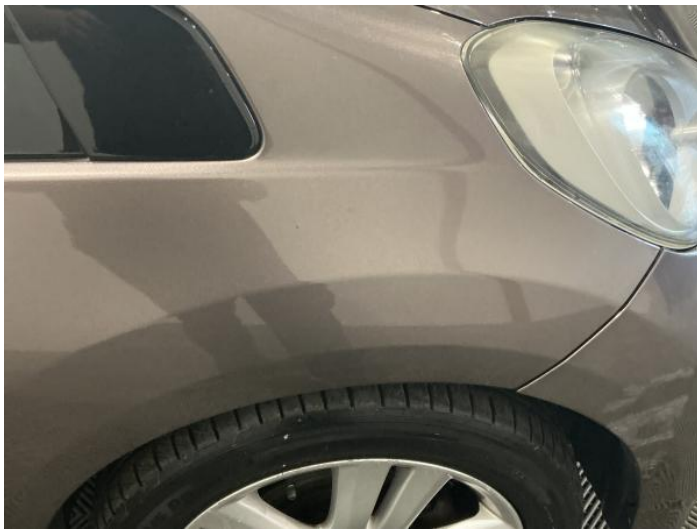
11: Wing osf Chipped 1 To 5