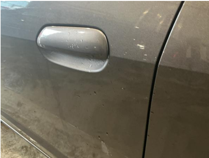
5: Door nsf Poor Previous Repair Paint Flake