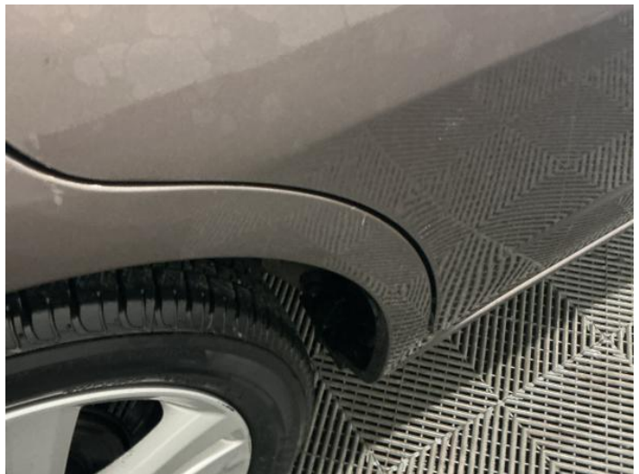
16: Qtr Panel osr Chipped 1 To 5