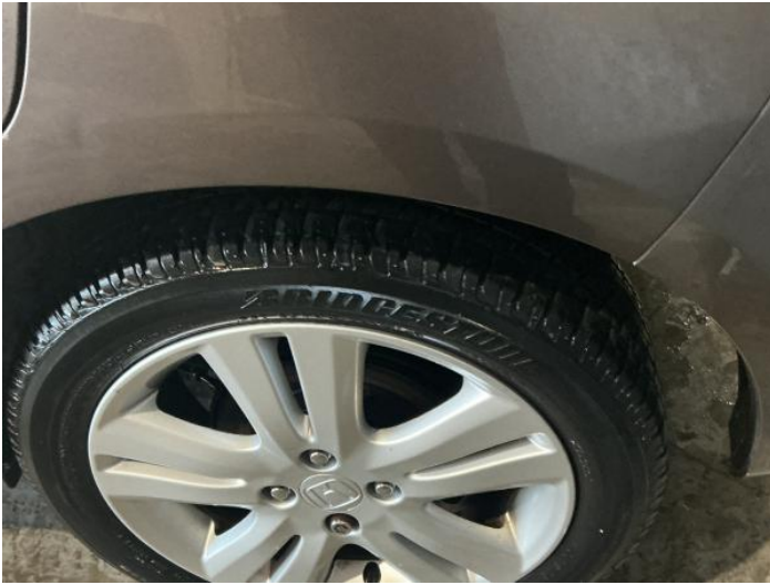
3: Wheel nsr Scratched Over 50mm