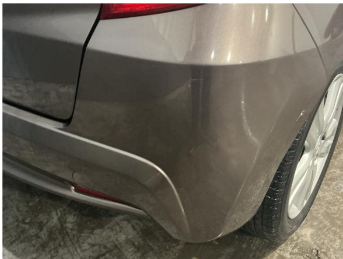
1: Bumper Rear Scratched Over 100mm Thru Paint