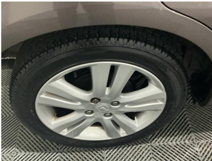
15: Wheel osr Scratched Over 50mm