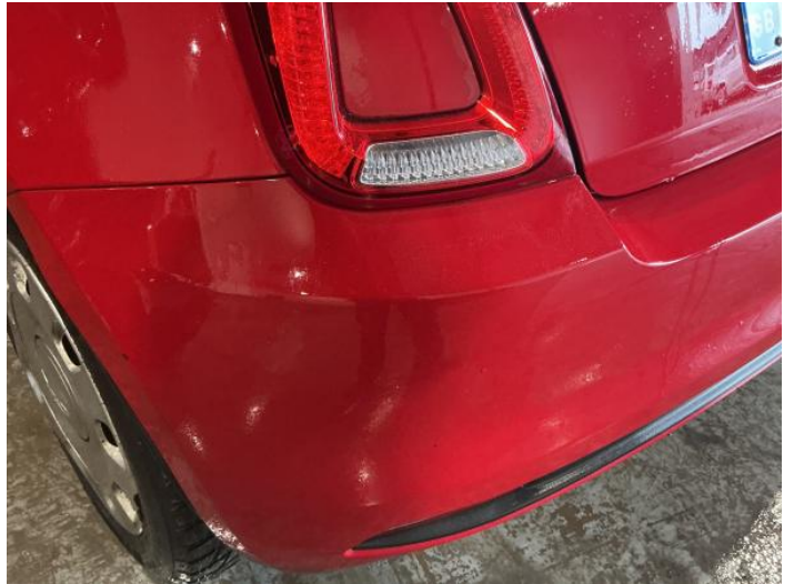
9: Qtr Panel osr Scratched Over 25mm Not Thru Paint