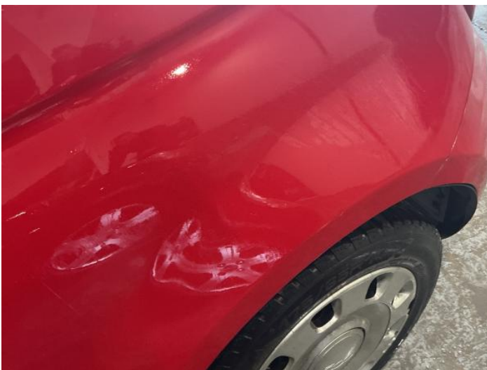
13: Qtr Panel nsr Dented Over 2 UpTo 10mm