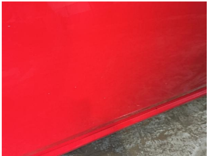
5: Wing osf Scratched Over 25mm Not Thru Paint