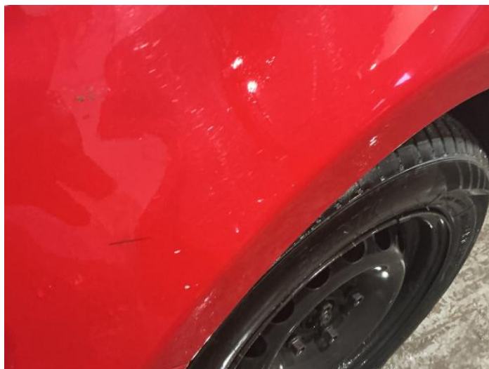
15: Door nsf Chipped 1 To 5