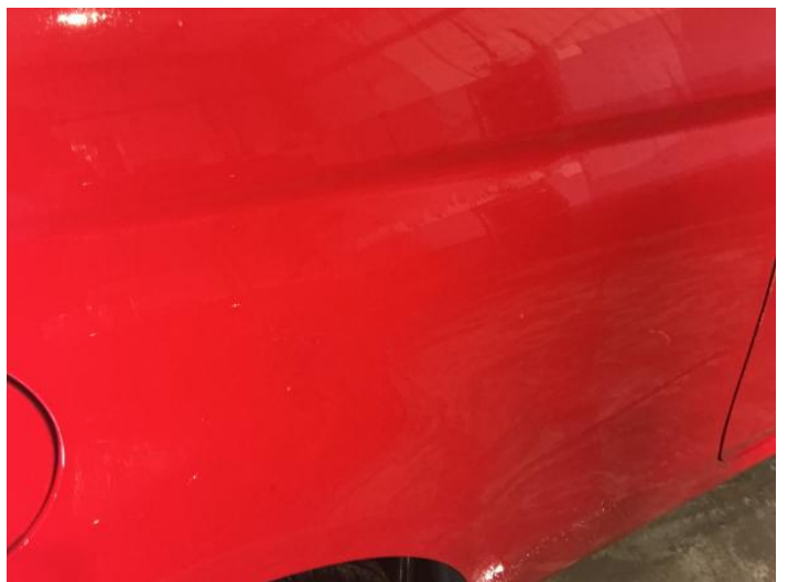
7: Door osf Scratched Over 25mm Not Thru Paint