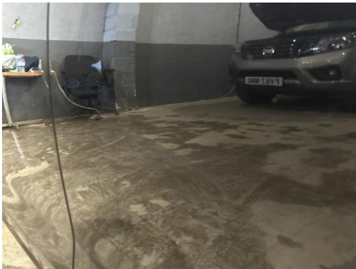
9: Door nsr Scratched Over 25mm Not Thru Paint