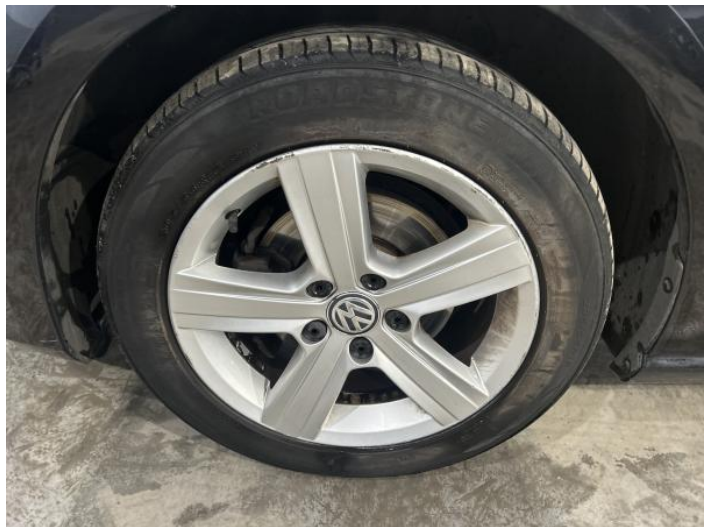
12: Wheel nsf Scratched Over 50mm