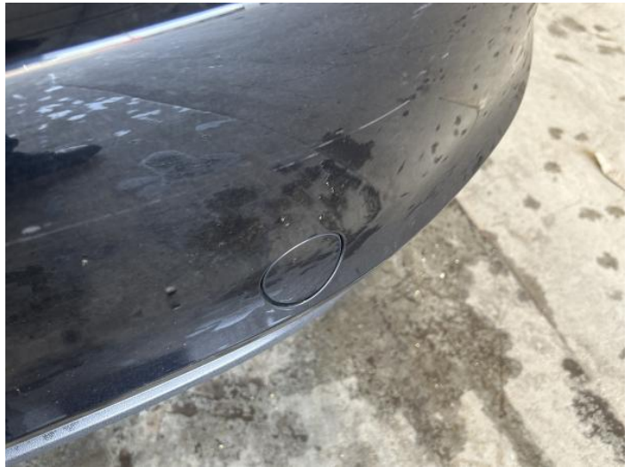
6: Bumper Rear Scratched 25 to 100mm Thru Paint