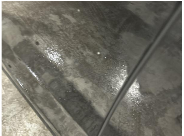
10: Door nsf Chipped 1 To 5