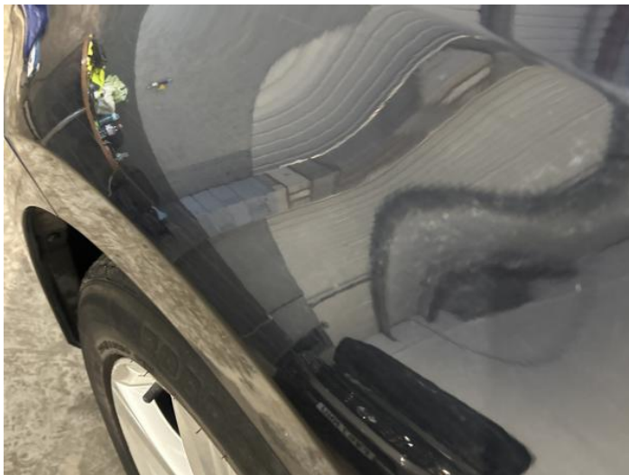
11: Wing nsf Scratched Over 25mm Not Thru Paint