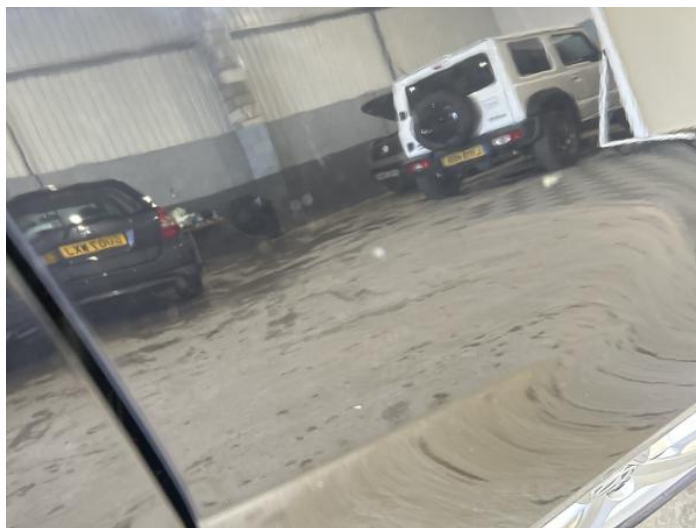
2: Wing osf Chipped 1 To 5