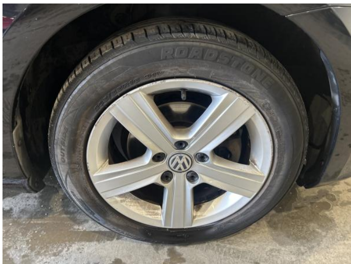
1: Wheel osf Scratched Over 50mm