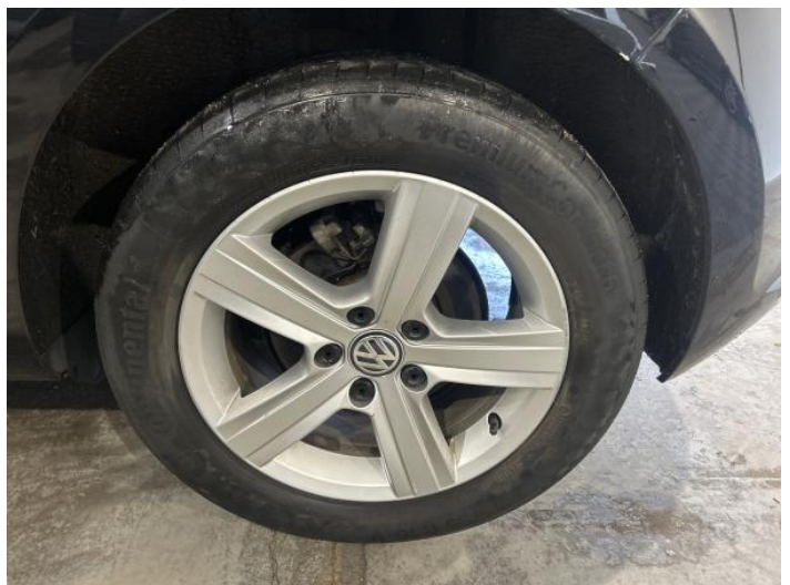
8: Wheel nsr Scratched Up To 50mm