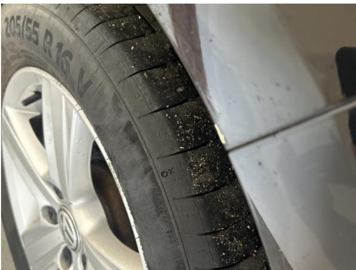
7: Qtr Panel nsr Chipped 1 To 5