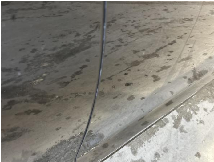
3: Door osf Chipped Edge Chip