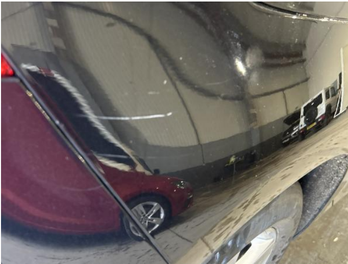
5: Qtr Panel osr Scratched Over 25mm Not Thru Paint