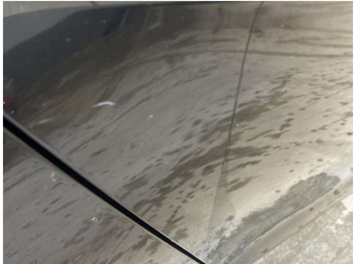
4: Door osr Scratched UpTo 25mm Not Thru Paint