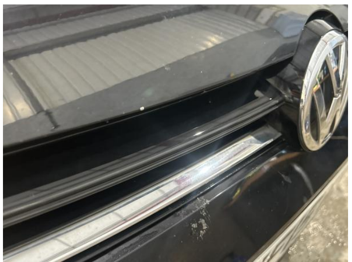
14: Bonnet Chipped 1 To 5