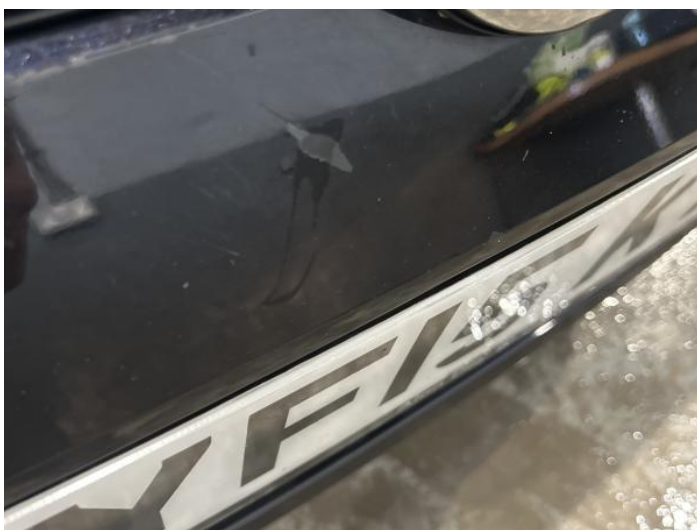
13: Bumper Front Scratched UpTo 25mm Thru Paint