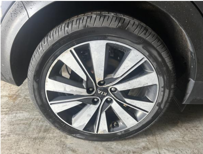
5: Wheel osr Corroded Light