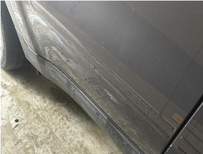
3: Door Moulding osr Missing Replace