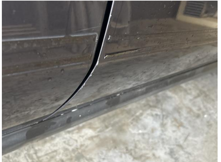
4: Door osf Chipped Edge Chip