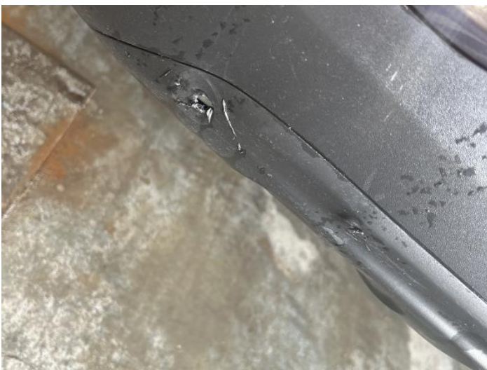
7: Bumper Rear Moulding Broken Replace