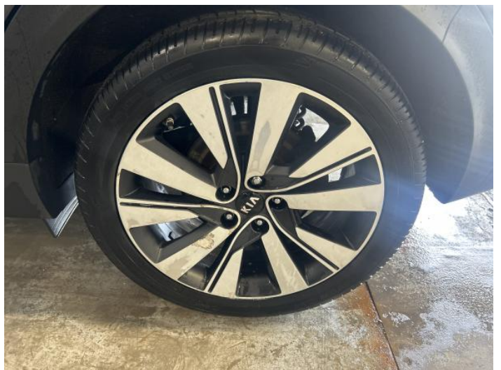
8: Wheel nsr Corroded Light