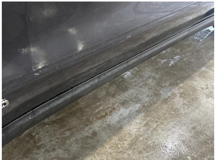
10: Door Moulding nsf Missing Replace