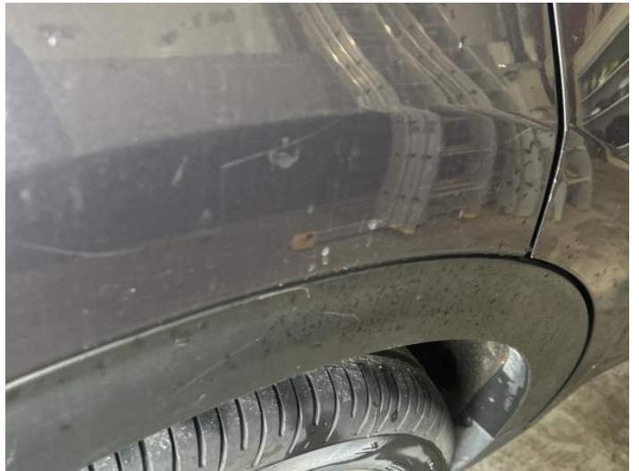
6: Qtr Panel osr Scratched Over 25mm Not Thru Paint