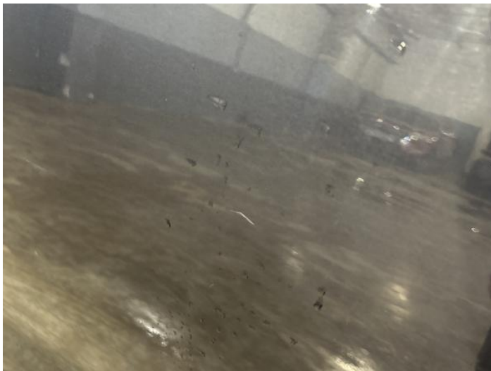
11: Door nsr Chipped 1 To 5