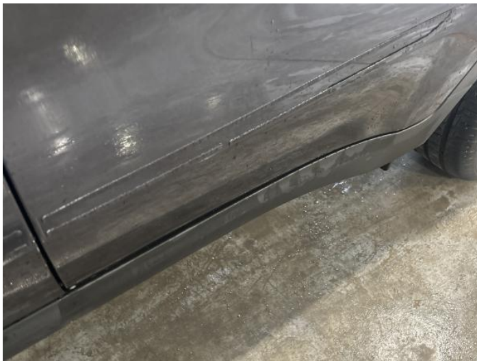
9: Door Moulding nsr Missing Replace