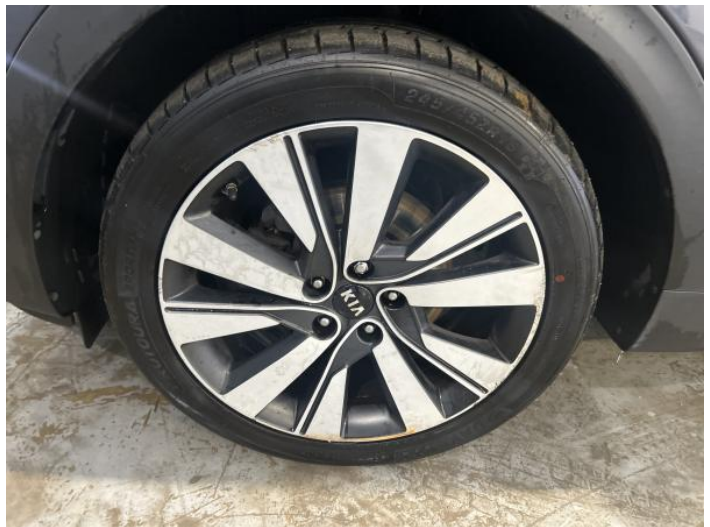
12: Wheel nsf Scratched Over 50mm