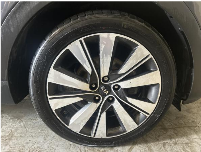
1: Wheel of Scratched Over 50mm