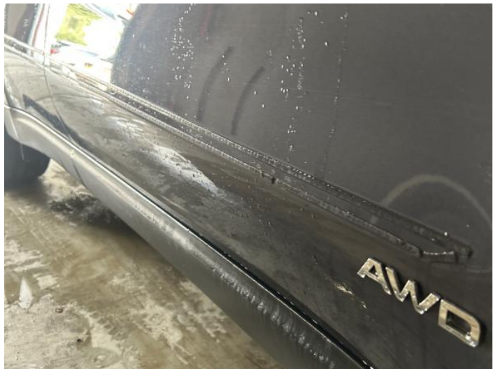
2: Door Moulding of Missing Replace