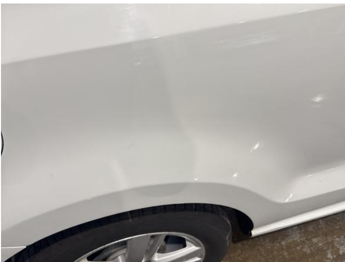
13: Qtr Panel osr Chipped 1 To 5