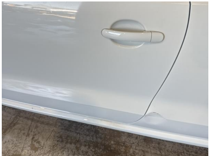
4: Door nsf Scratched Over 25mm Thru Paint