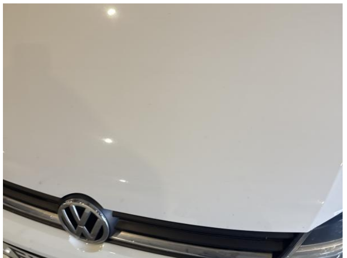
8: Bonnet Chipped 1 To 5