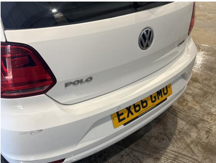
1: Bumper Rear Scratched Over 100mm Thru Paint