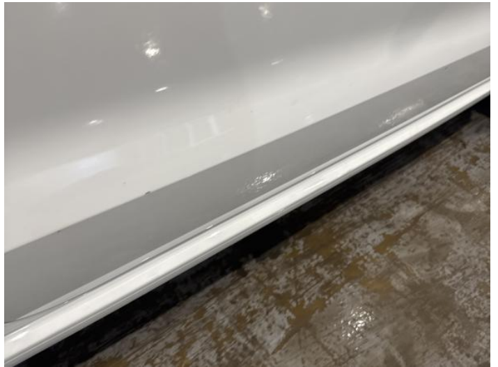
12: Door osf Chipped 1 To 5