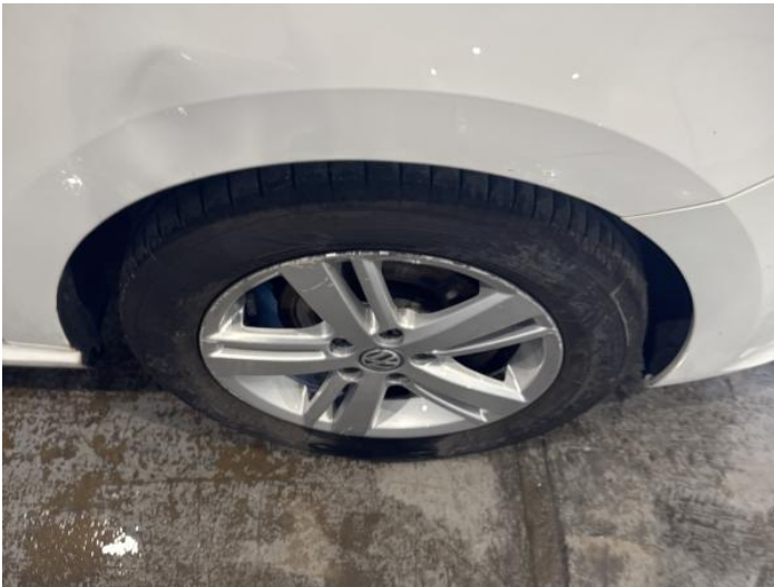
11: Wheel osf Scratched Over 50mm