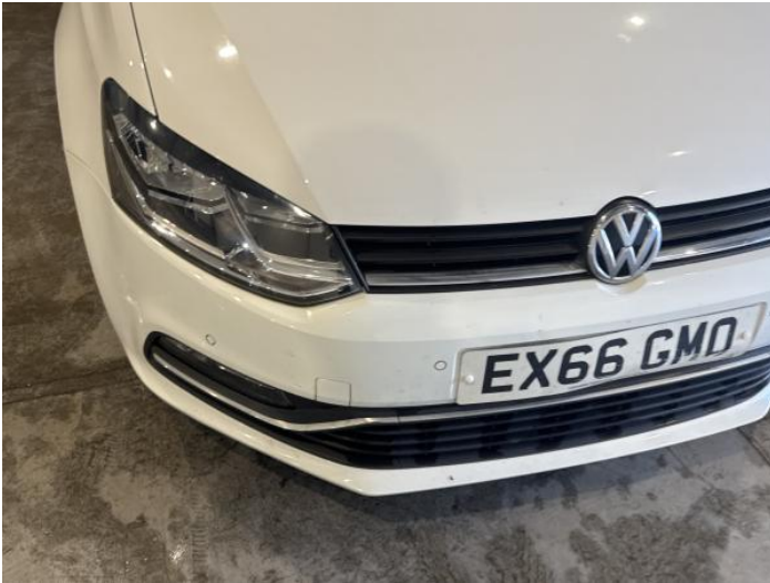
9: Bumper Front Scratched Over 100mm Thru Paint