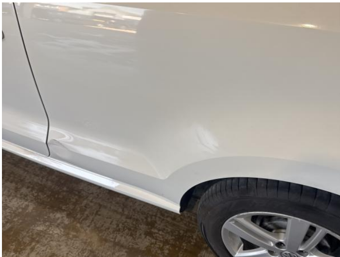
3: Qtr Panel nsr Dented With Paint Damage