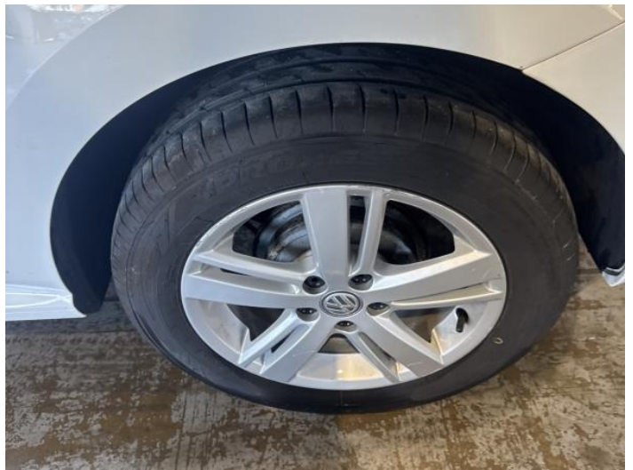
6: Wheel nsr Scratched Over 50mm