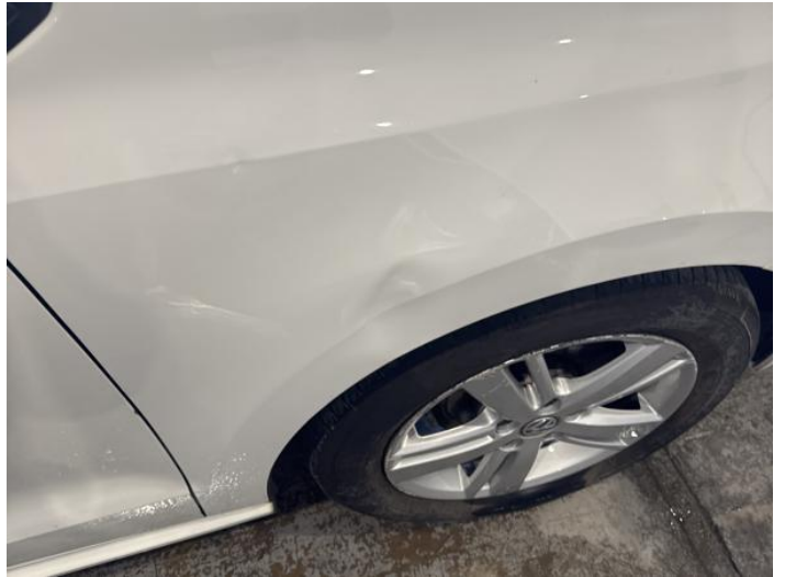
10: Wing osf Dented Over 30mm