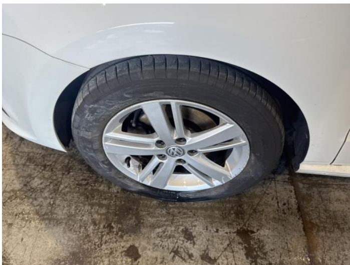
7: Wheel nsf Scratched Over 50mm