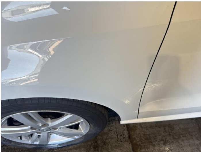
5: Wing nsf Chipped 1 To 5