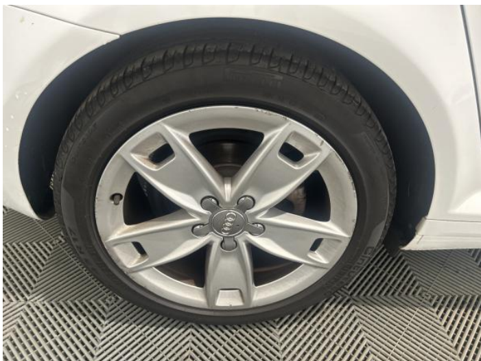
3: Wheel osr Scratched Over 50mm