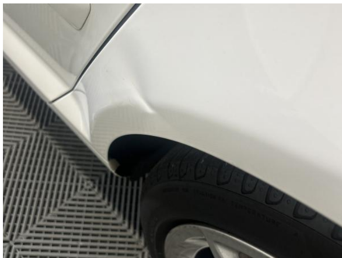
4: Qtr Panel nsr Dented Over 30mm