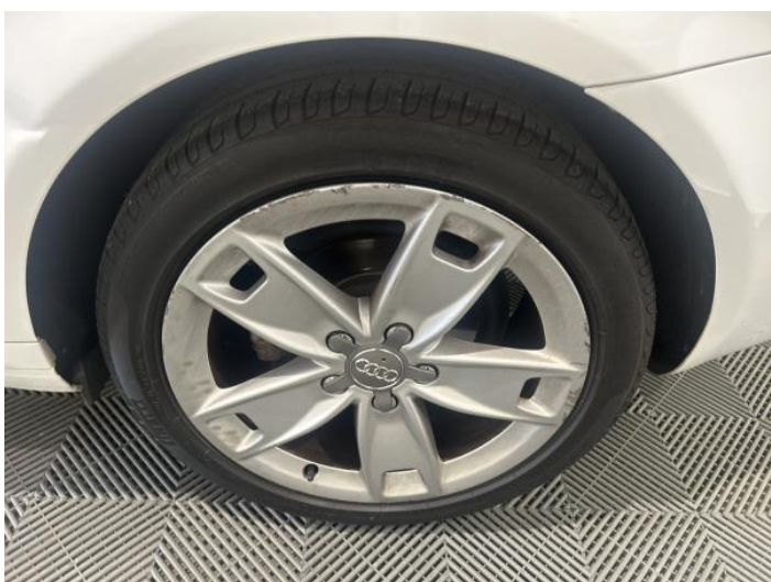
5: Wheel nsr Scratched Over 50mm