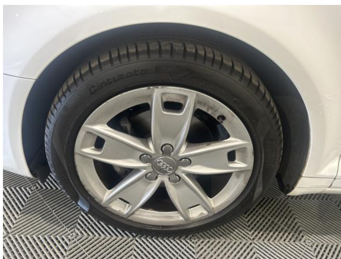
6: Wheel nsf Scratched Over 50mm