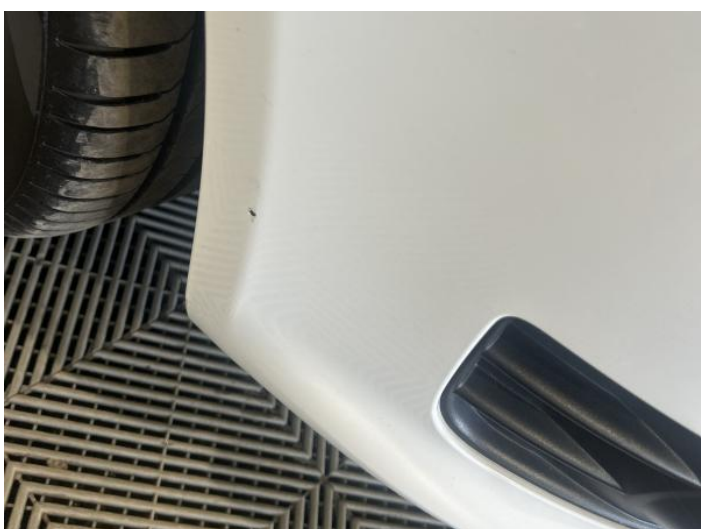
7: Bumper Front Chipped 1 To 5