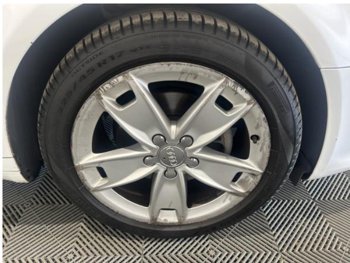
1: Wheel osf Scratched Over 50mm