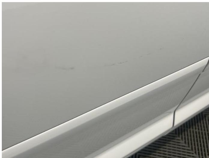
2: Door osr Scratched Over 25mm Not Thru Paint