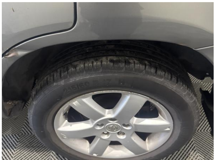
8: Wheel nsr Scratched Over 50mm