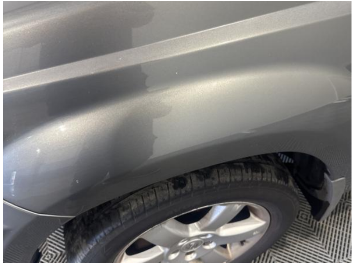
4: Wing nsf Chipped 1 To 5