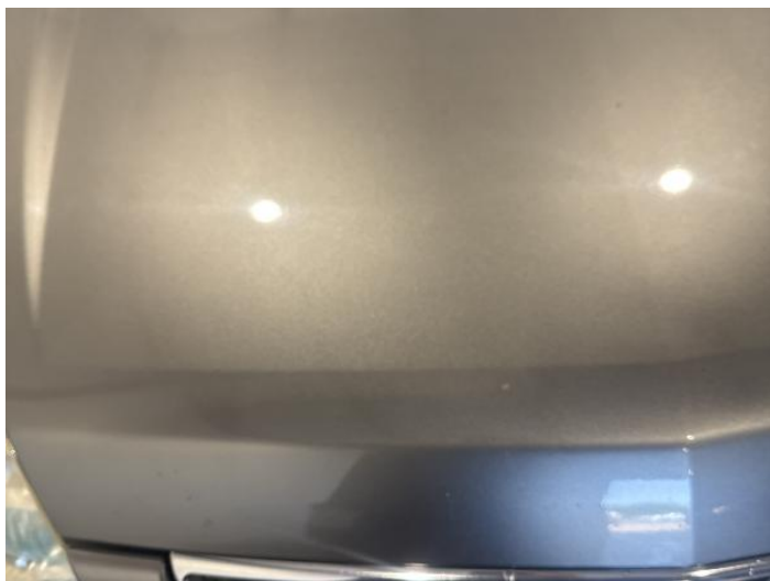
1: Bonnet Chipped 1 To 5