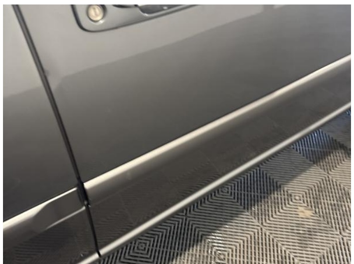
14: Door osf Dented Over 30mm