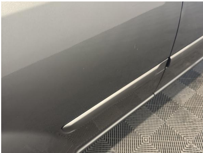
11: Door osr Chipped 1 To 5