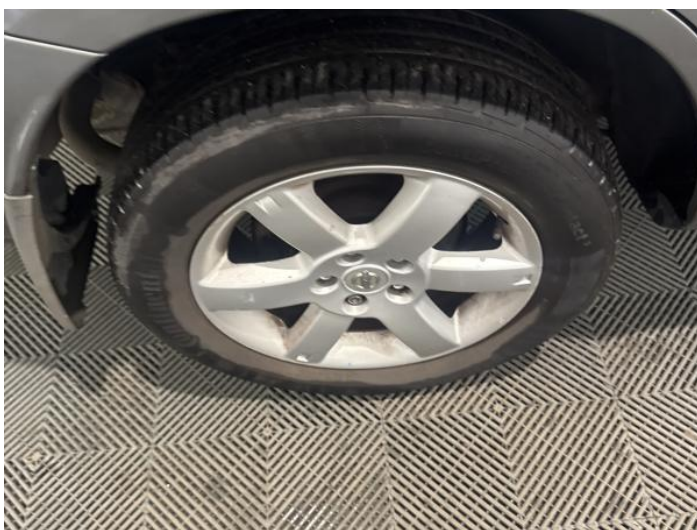
13: Wheel osr Scratched Over 50mm