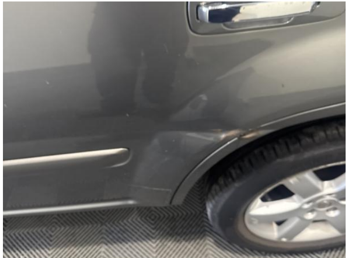
6: Door nsr Dented With Paint Damage