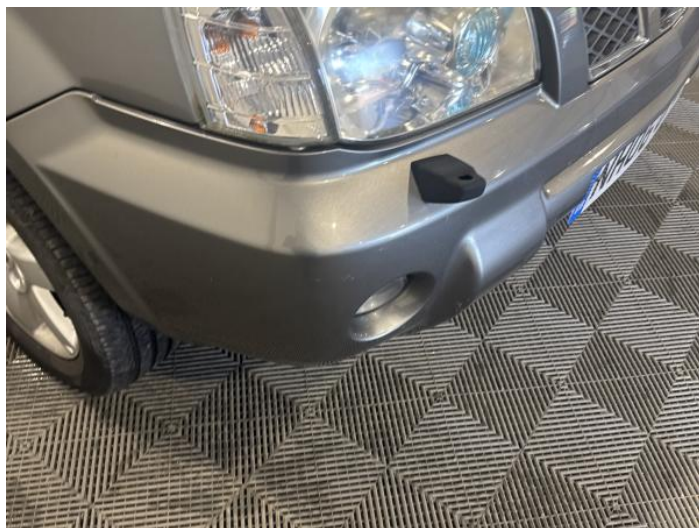
2: Bumper Front Scratched Over 100mm Thru Paint