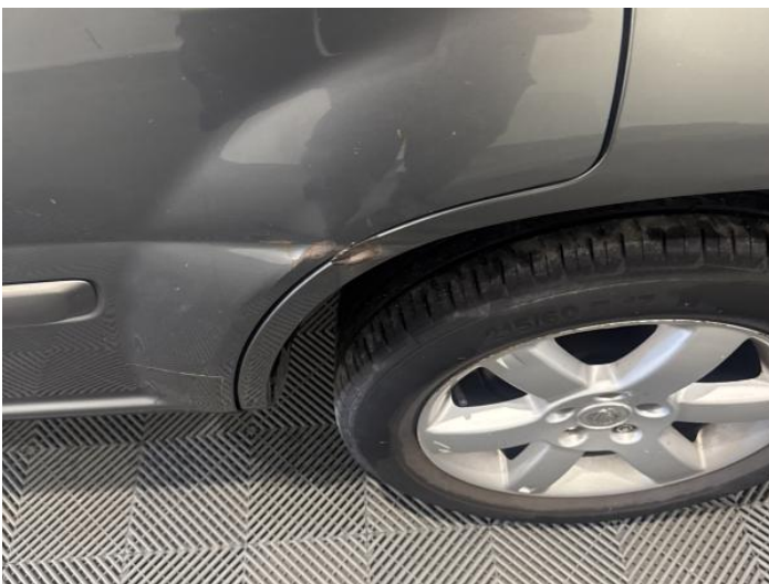
7: Qtr Panel nsr Dented With Paint Damage