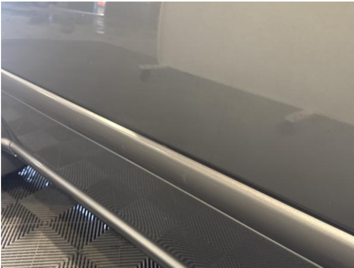
5: Door nsf Chipped 1 To 5