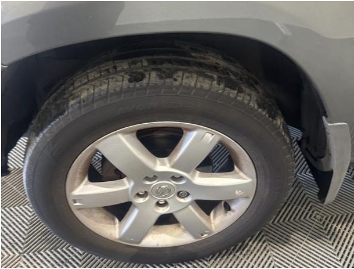
3: Wheel nsf Scratched Over 50mm