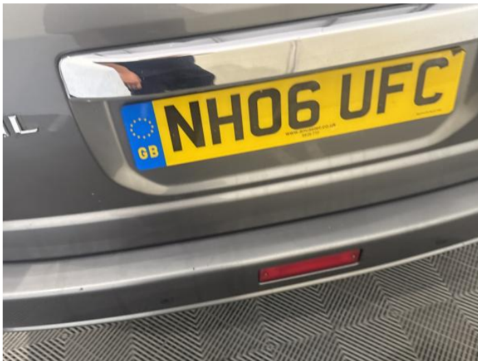
9: Bumper Rear Scratched Over 100mm Thru Paint