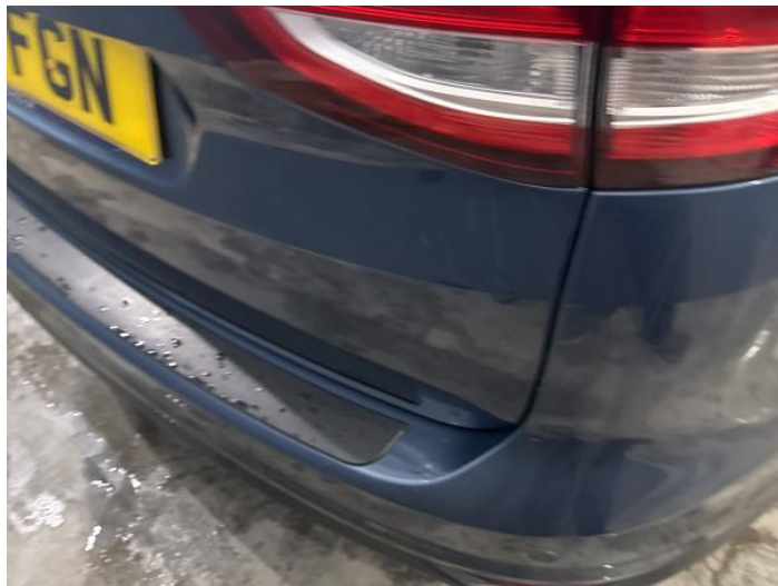
10: Bumper Rear Chipped Multiple Chips