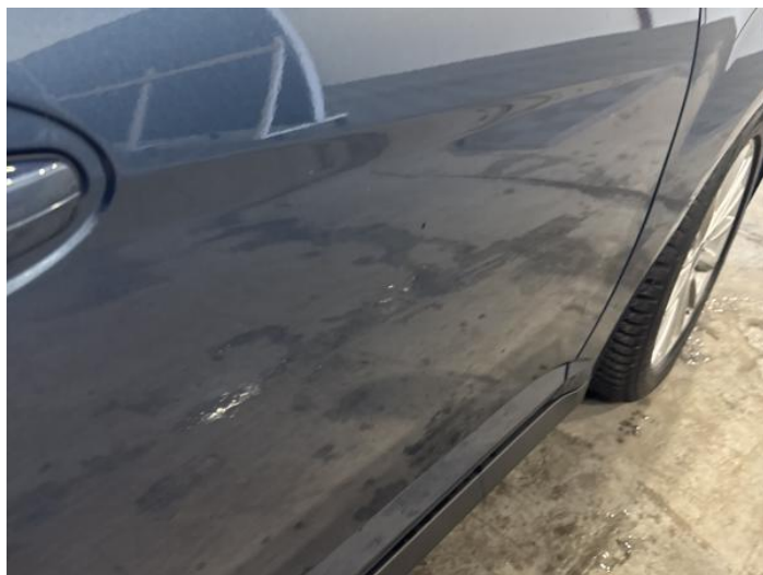
14: Door osf Chipped 1 To 5