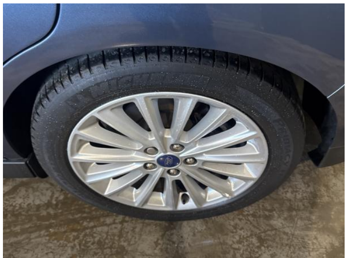
8: Wheel nsr Scratched Up To 50mm