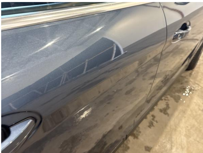
13: Door osr Dented Over 2 UpTo 10mm