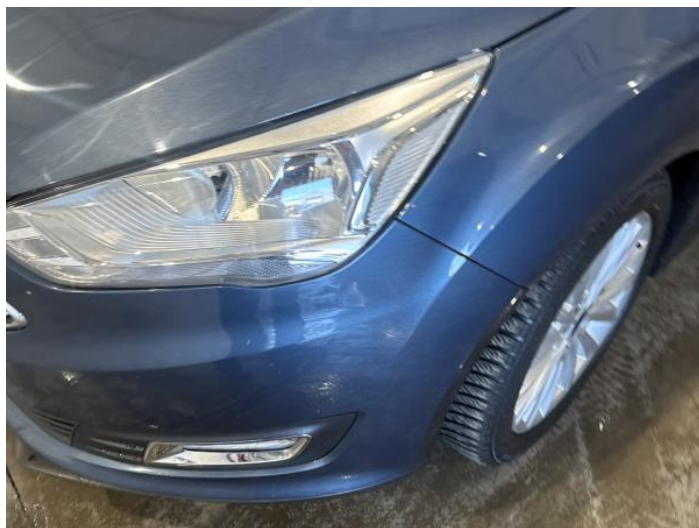
2: Bumper Front Chipped Multiple Chips