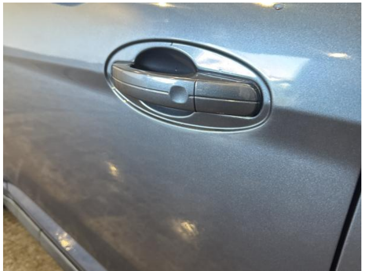
6: Door nsf Dented 2 Or Less Up To 10mm