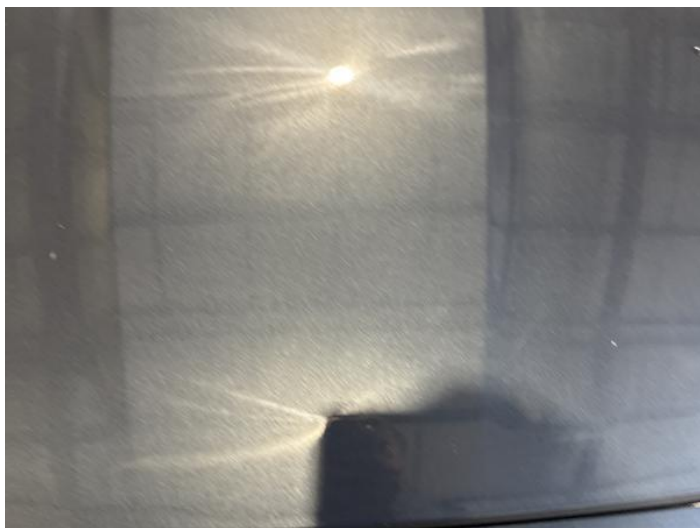
1: Bonnet Chipped 1 To 5