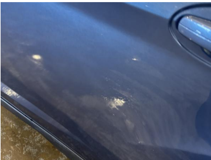
7: Door nsr Poor Previous Repair Poor Paint