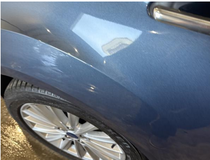
5: Wing nsf Chipped 1 To 5