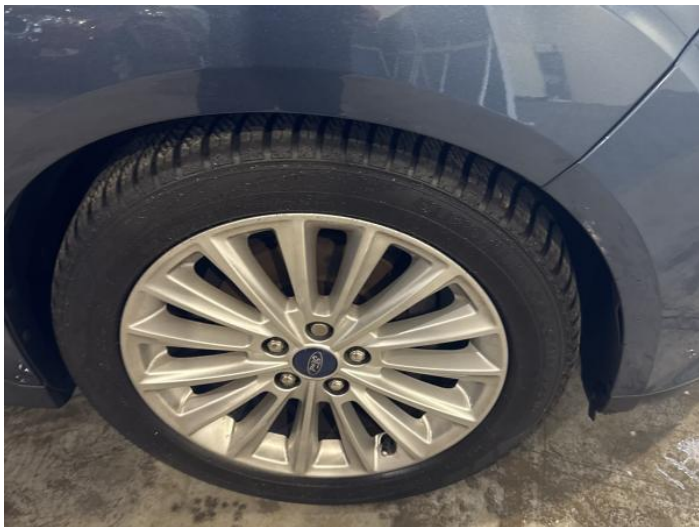
15: Wheel of Scratched Up To 50mm