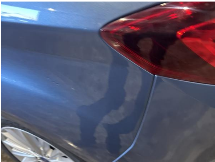
9: Qtr Panel nsr Chipped 1 To 5