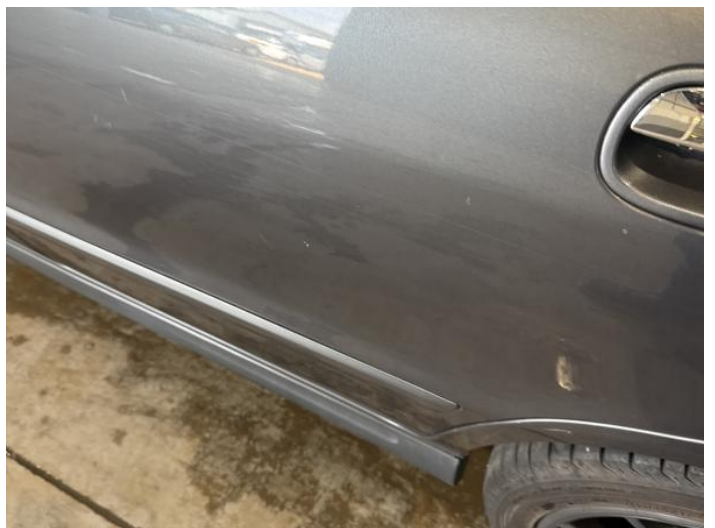
8: Door nsr Chipped 1 To 5