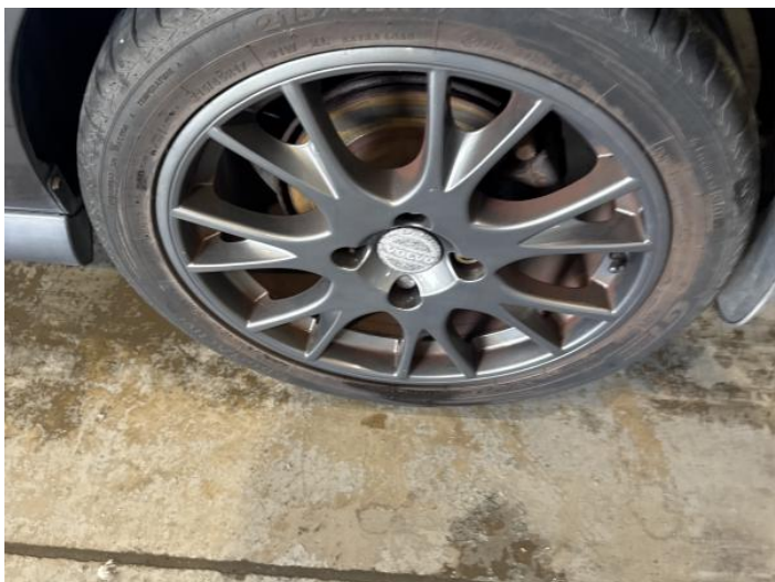
9: Wheel nsr Scratched Up To 50mm