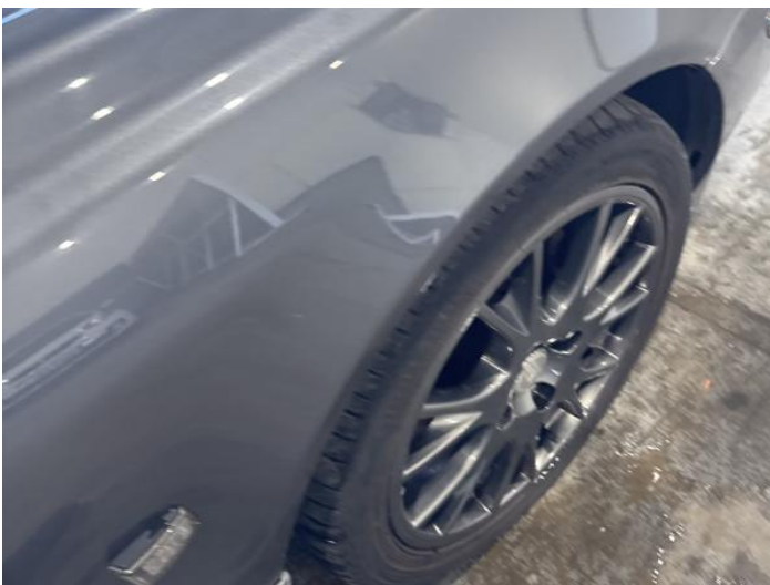
19: Wing osf Chipped 1 To 5