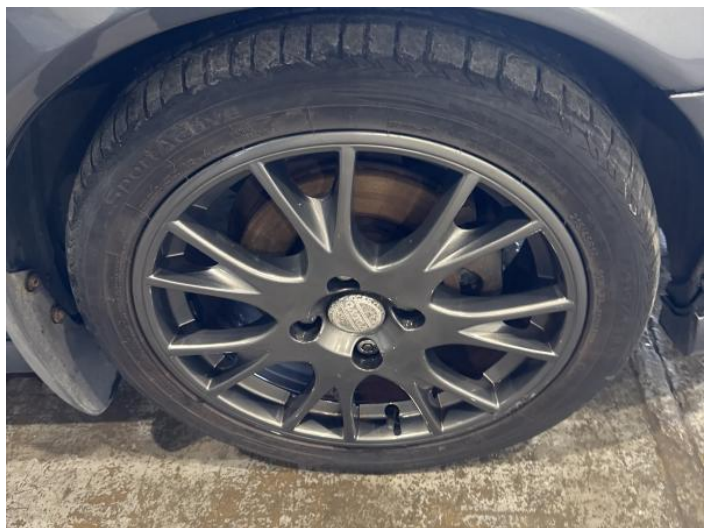
20: Wheel osf Scratched Up To 50mm