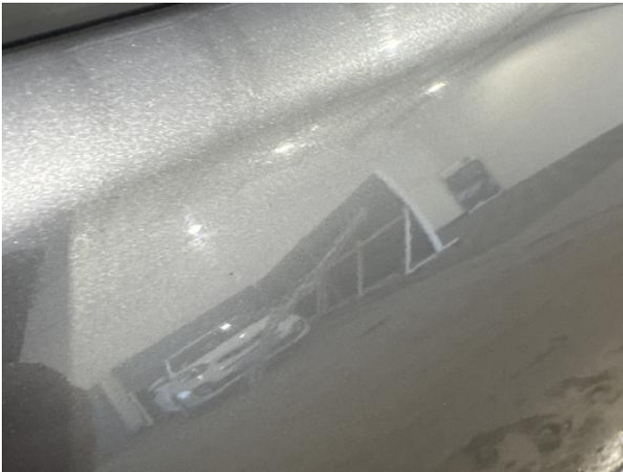
17: Door osr Poor Previous Repair Poor Paint