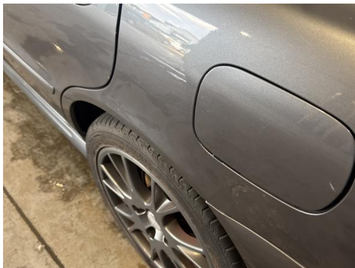
10: Qtr Panel nsr Chipped 1 To 5