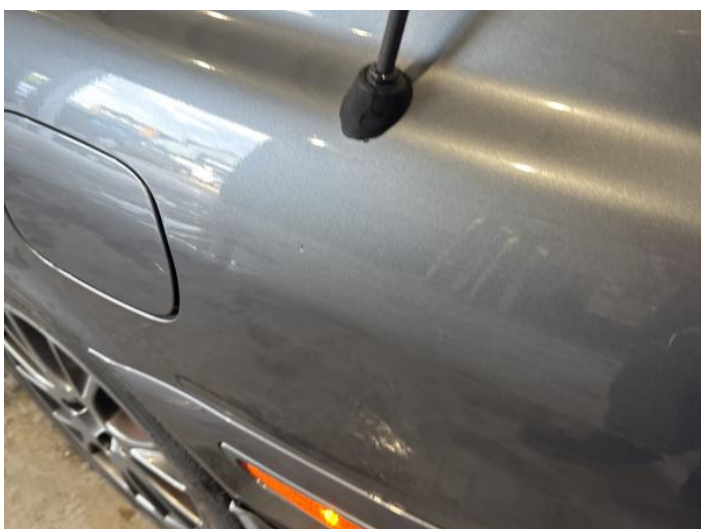
11: Qtr Panel nsr Dented Between 10mm + 30mm