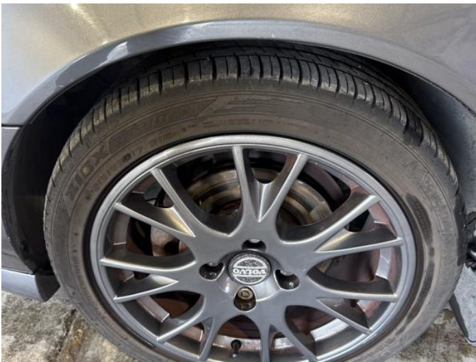
5: Wheel nsf Scratched Up To 50mm