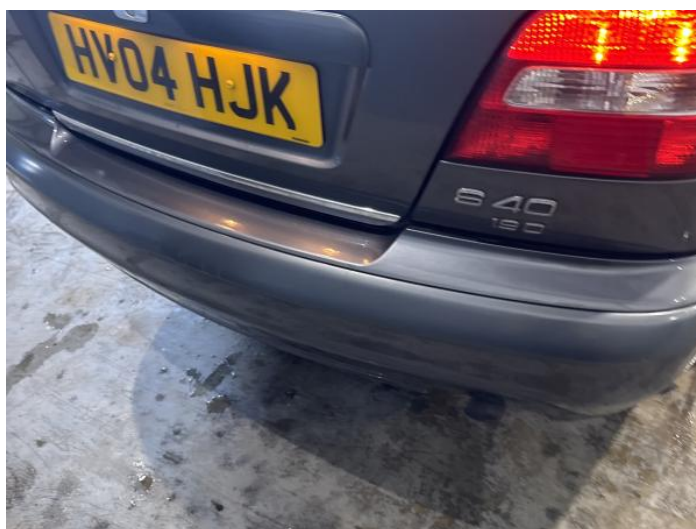
12: Bumper Rear Scratched 25 to 100mm Thru Paint