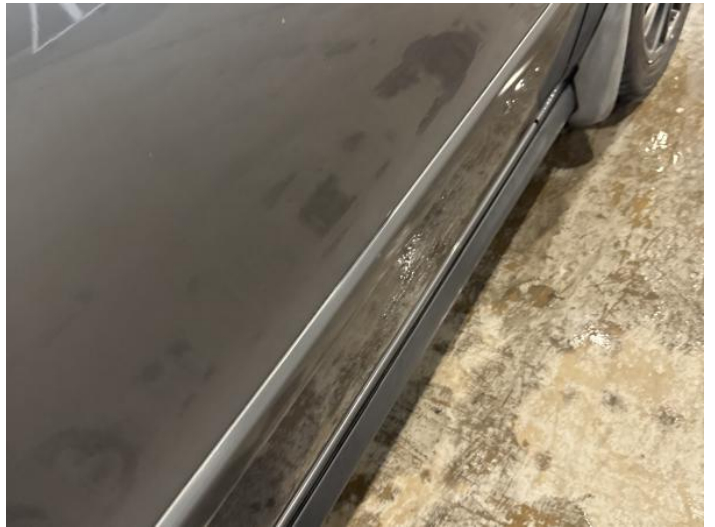
18: Door osf Chipped 1 To 5