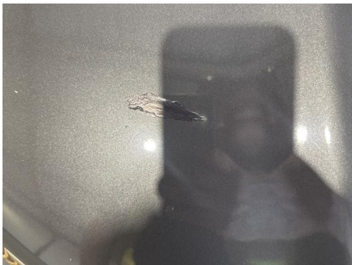
1: Bonnet Poor Previous Repair Poor Paint