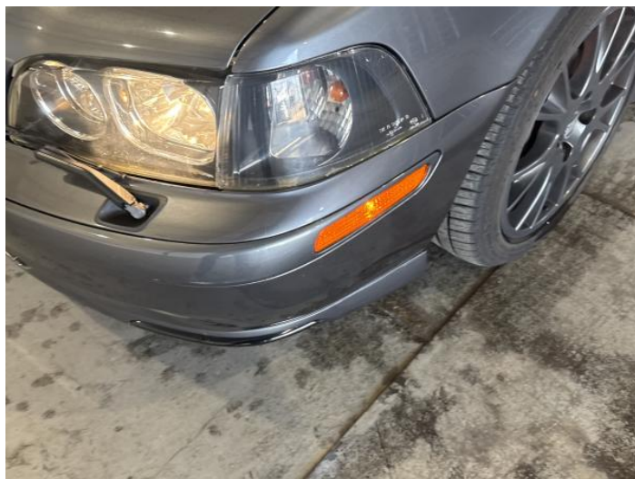
2: Bumper Front Scratched 25 to 100mm Thru Paint