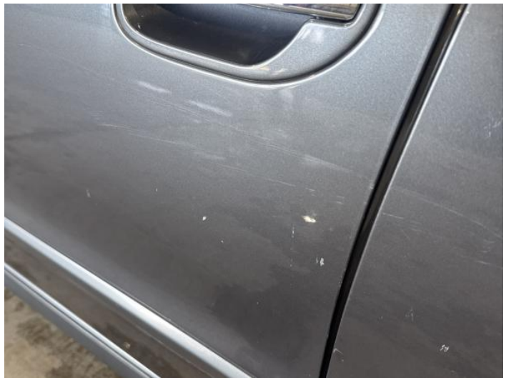
6: Door nsf Scratched Over 25mm Thru Paint