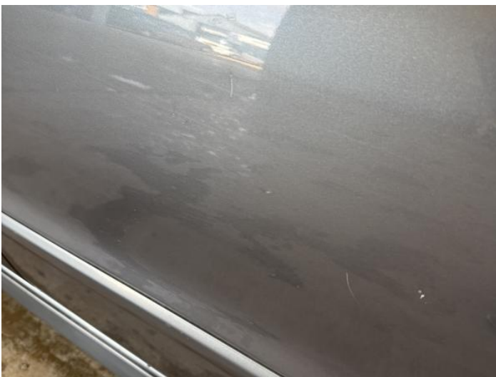
7: Door nsr Dented 2 Or Less UpTo 10mm