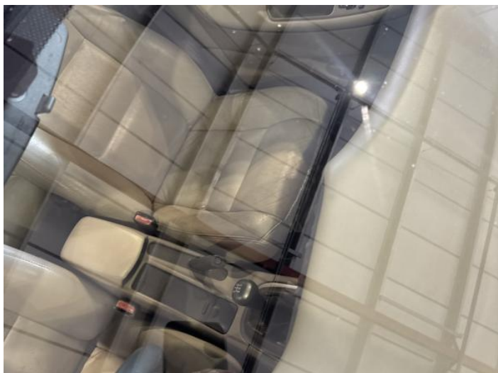
21: Screen Front Chipped UpTo 10mm