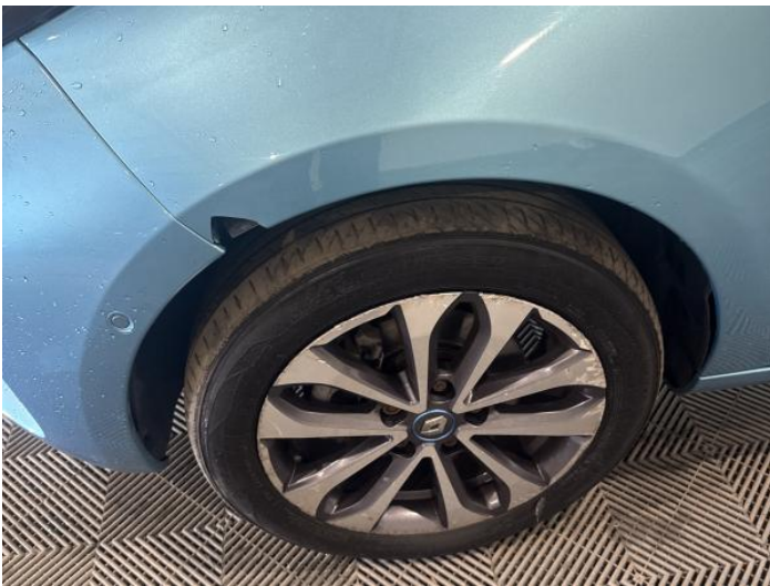
5: Wheel nsf Scratched Over 50mm