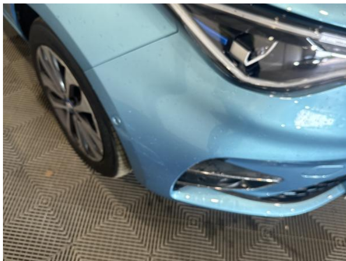
2: Bumper Front Scratched 25 to 100mm Thru Paint