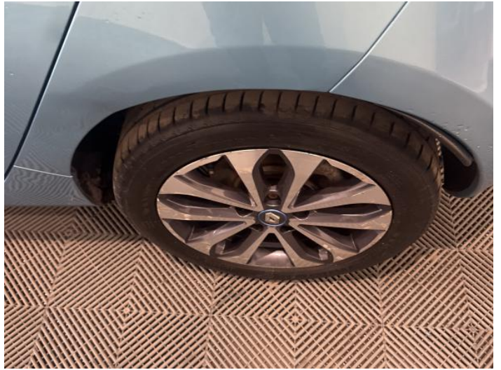
10: Wheel nsr Scratched Over 50mm