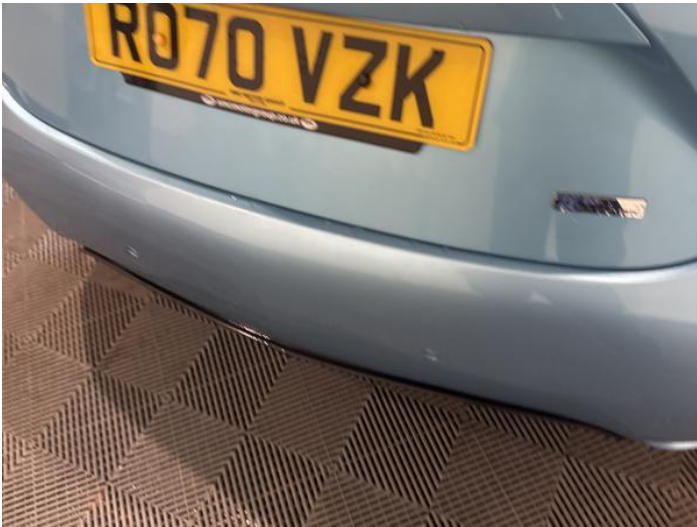
11: Bumper Rear Chipped Multiple Chips