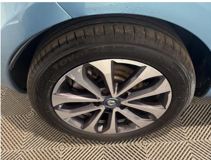
13: Wheel osr Scratched Over 50mm