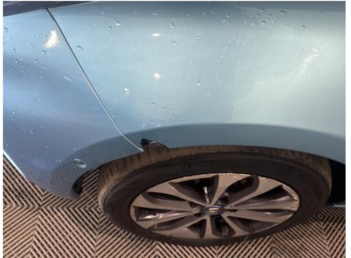
3: Bumper Front Scratched Over 25mm Not Thru Paint