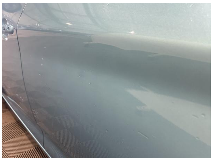
7: Door nsf Scratched Over 25mm Not Thru Paint