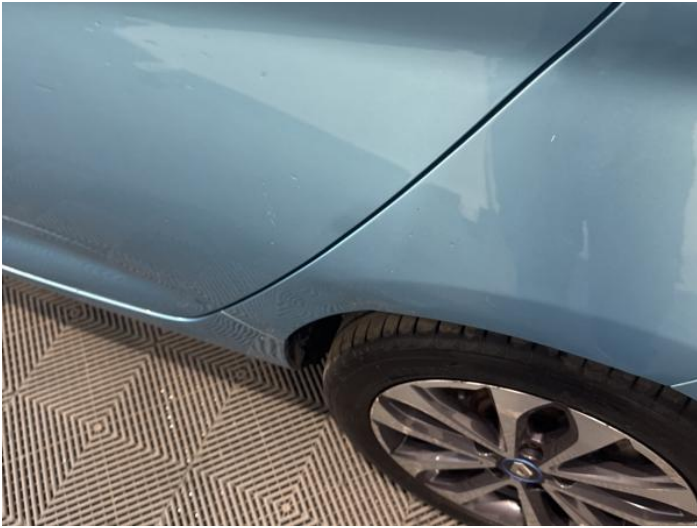
9: Qtr Panel nsr Dented Over 30mm