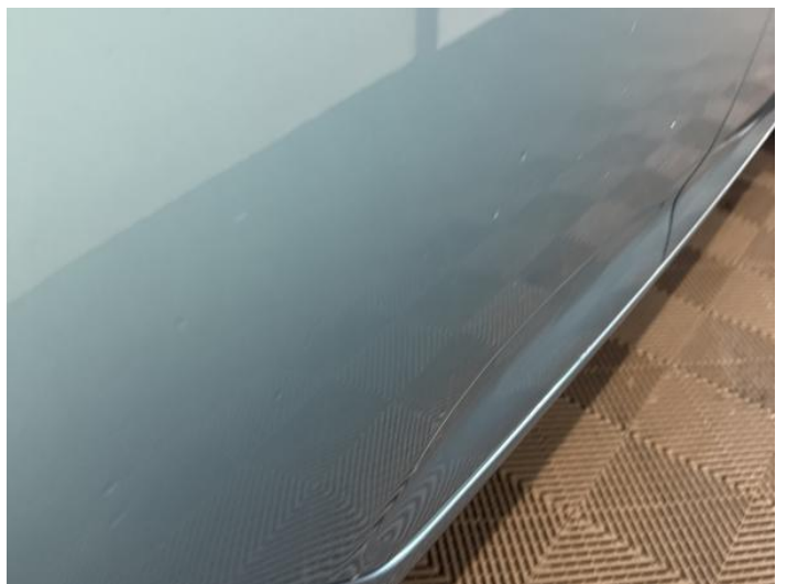
14: Door osf Chipped 1 To 5