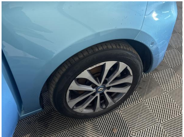
16: Wheel osf Scratched Over 50mm