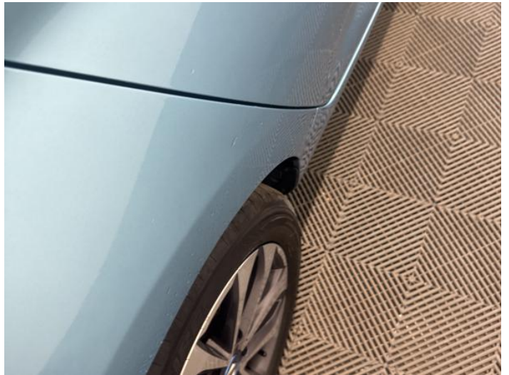
12: Qtr Panel osr Dented Between 10mm + 30mm