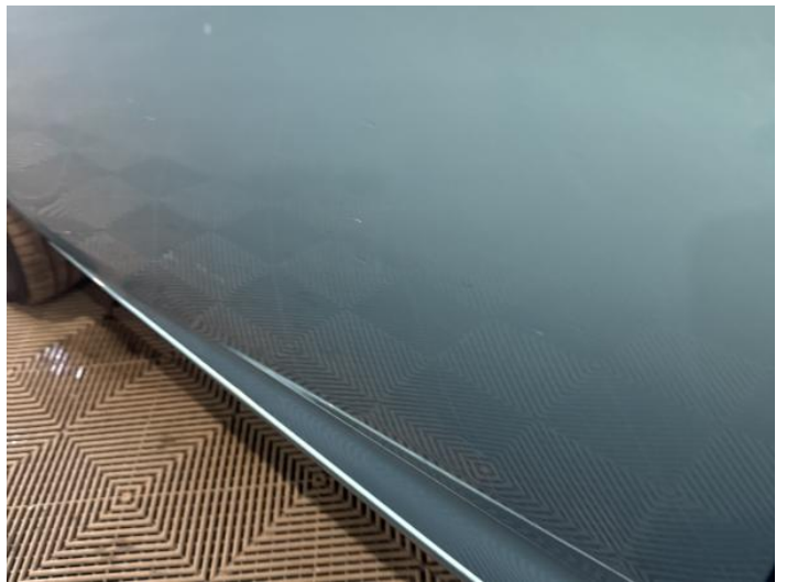
6: Door nsf Chipped 1 To 5