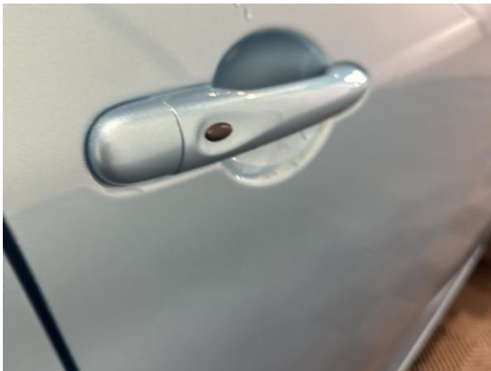
15: Door osf Dented Between 10mm + 30mm