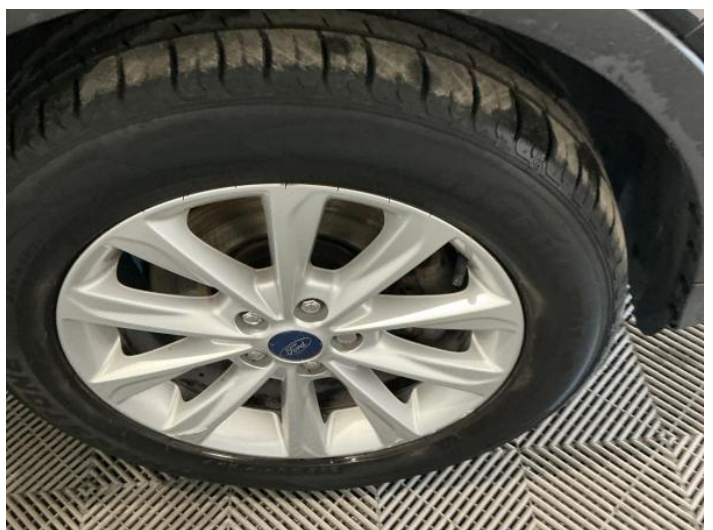
20: Wheel osf Scratched Up To 50mm