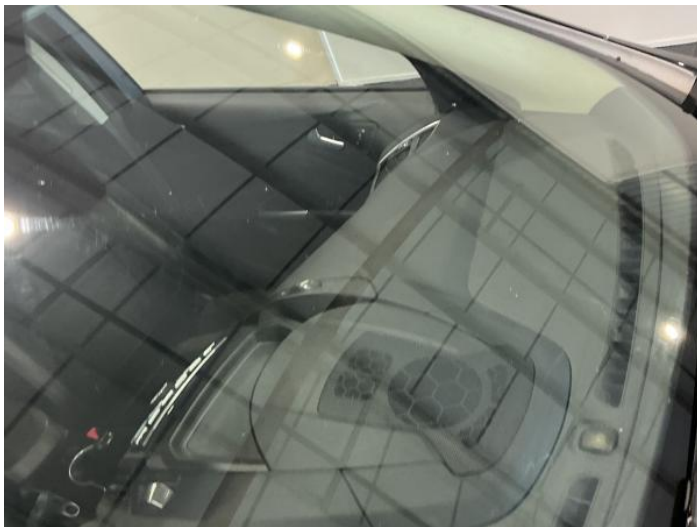
21: Screen Front Chipped UpTo 10mm