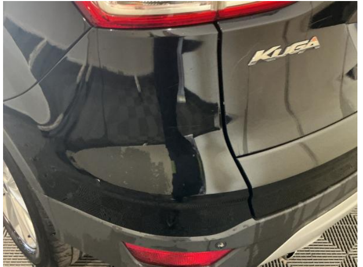
9: Qtr Panel nsr Scratched Over 25mm Not Thru Paint