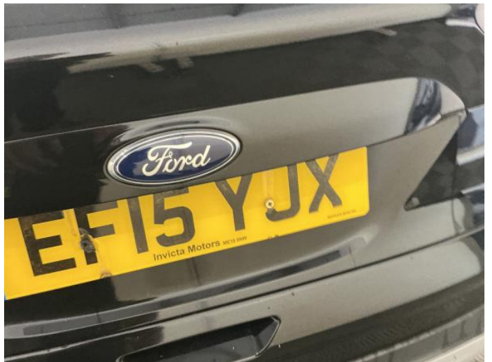
11: Bumper Rear Scratched Over 25mm Not Thru Paint