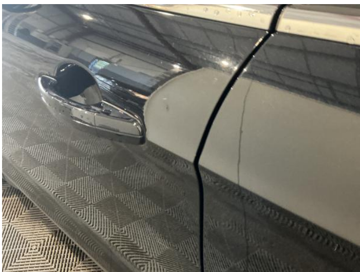
5: Door nsf Dented Over 2 UpTo 10mm