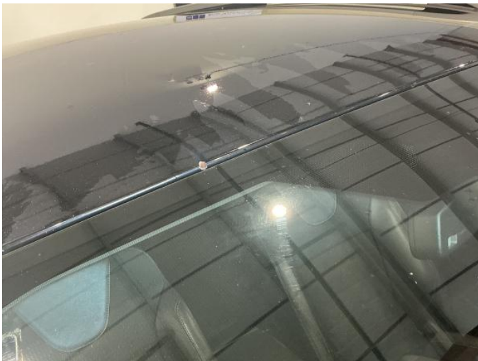
22: Roof Chipped Edge Chip

Carpet Condition Average Seat Condition Average