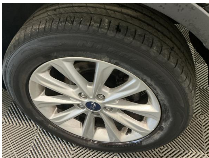
8: Wheel nsr Scratched Over 50mm