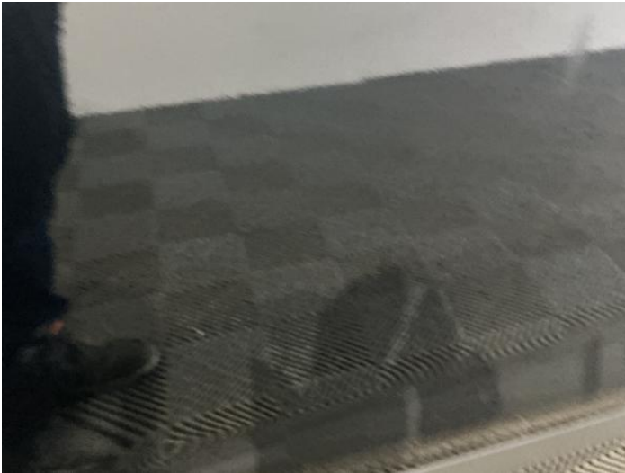
15: Door osr Chipped 1 To 5