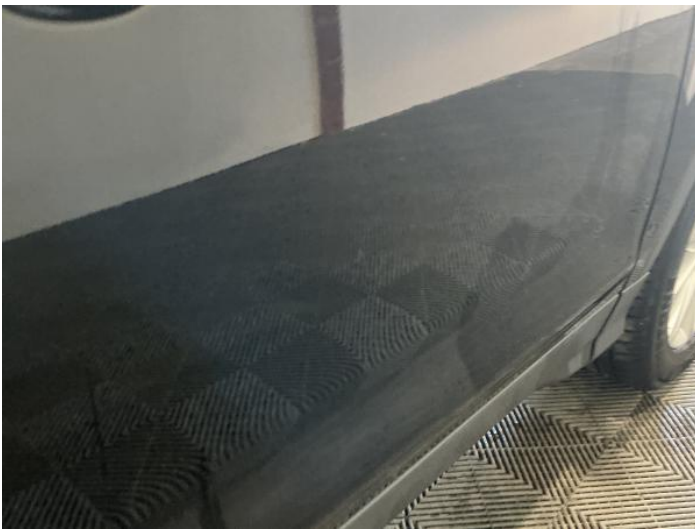
17: Door osf Chipped 1 To 5