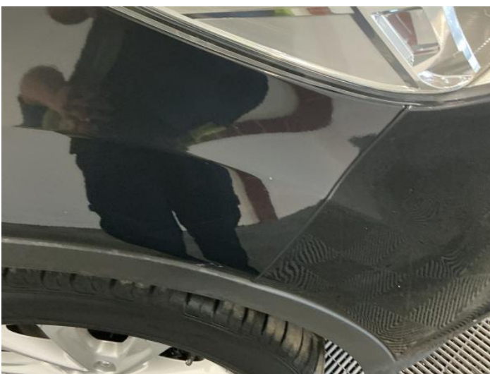
19: Wing osf Chipped 1 To 5