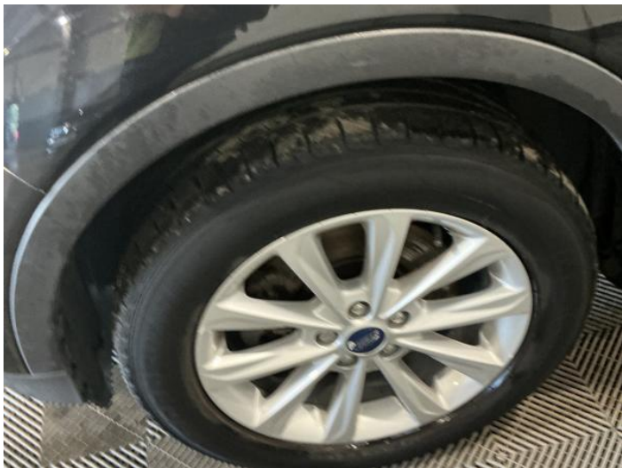
3: Wheel nsf Scratched Over 50mm