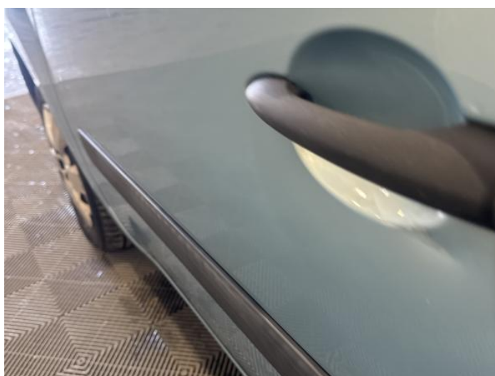
8: Door nsf Dented Over 30mm