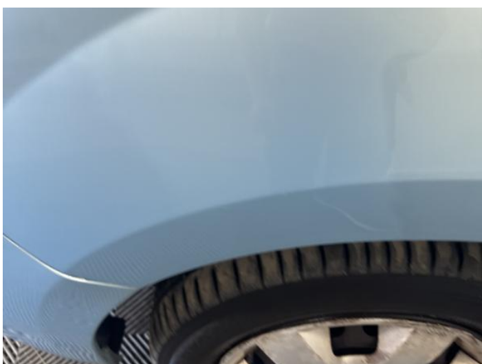
7: Wing nsf Chipped 1 To 5