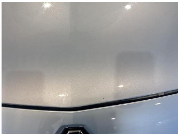
4: Bonnet Chipped 1 To 5