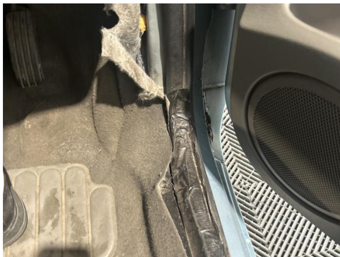
2: Other N/A N/A