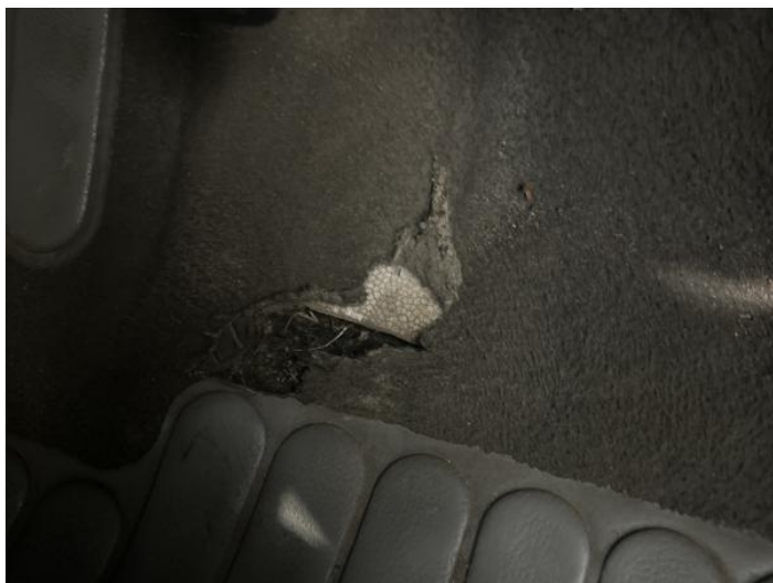
1: Carpets Front Holed Over 3mm