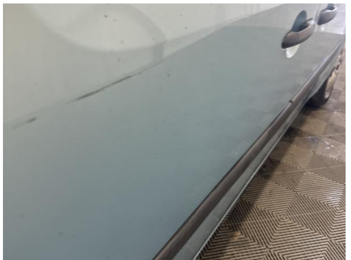
14: Door osr Scratched Over 25mm Thru Paint