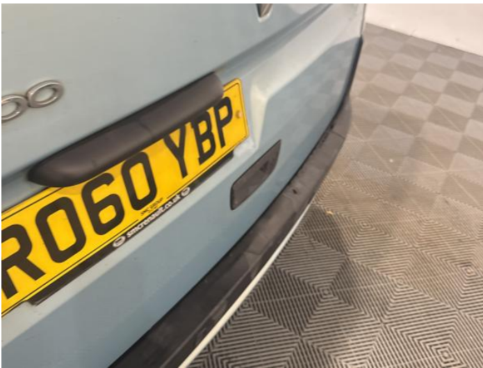
11: Boot Lid Dented Over 2 UpTo 10mm