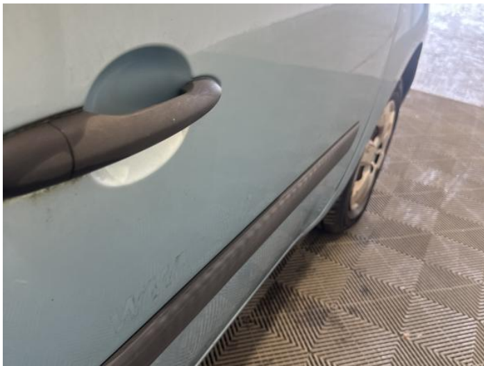
15: Door osf Dented Over 30mm