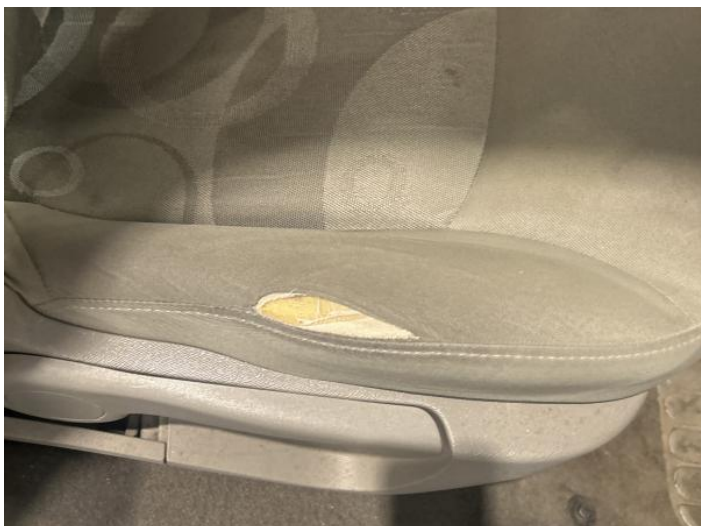
3: Seat Base Cover osf Holed Over 3mm