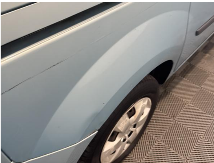
13: Qtr Panel osr Dented With Paint Damage