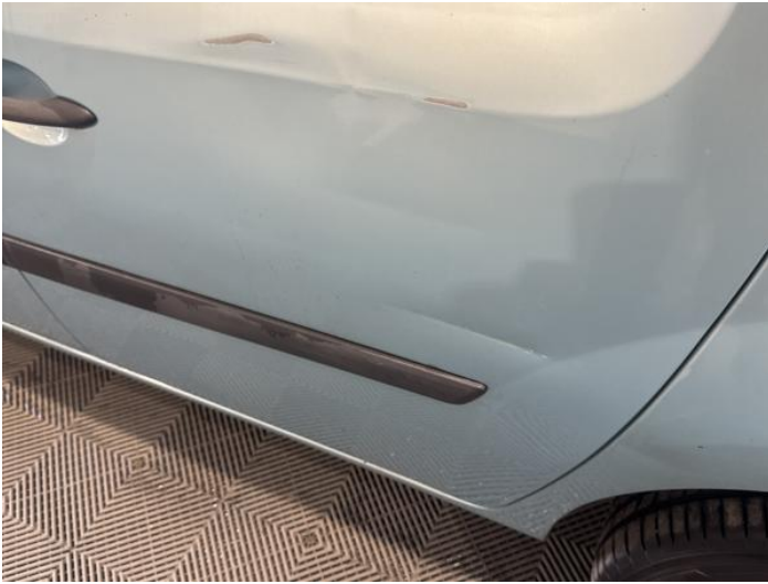
9: Door nsr Dented With Paint Damage