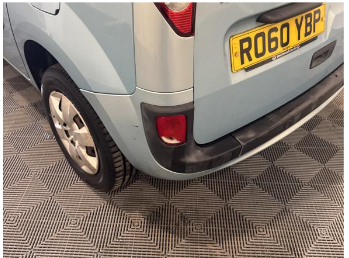
12: Bumper Rear Poor Previous Repair Poor Colour