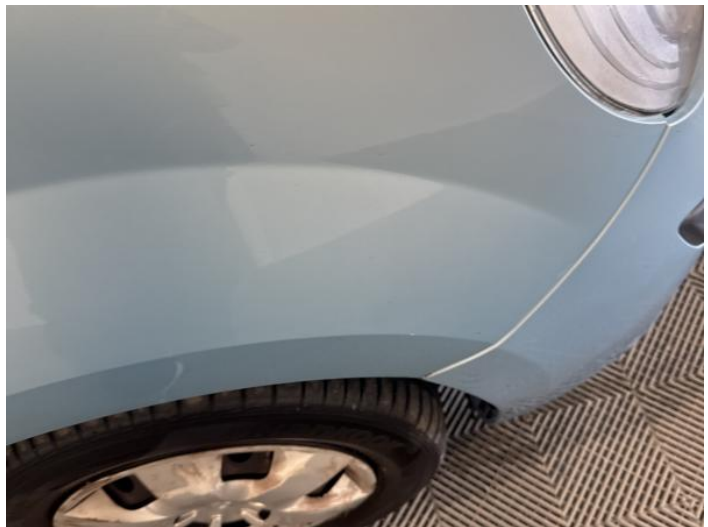
16: Wing osf Chipped 1 To 5