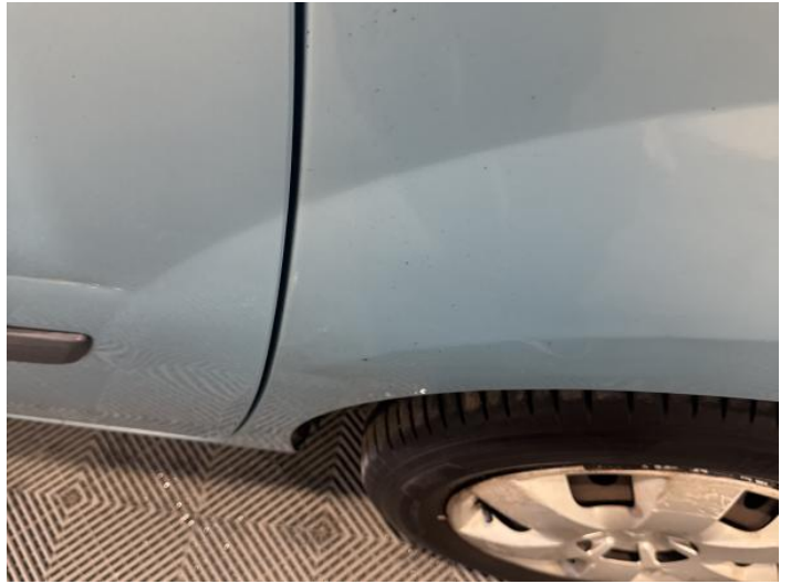
10: Qtr Panel nsr Dented With Paint Damage