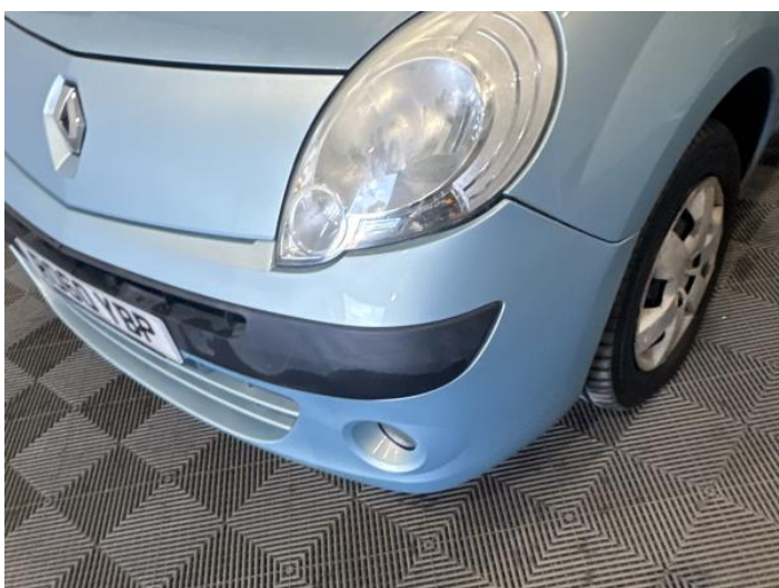
5: Bumper Front Scratched 25 to 100mm Thru Paint