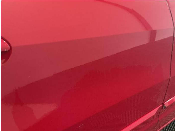
16: Door osr Dented With Paint Damage