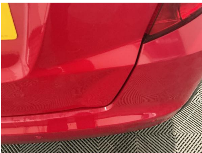
13: Boot Lid Dented Over 30mm