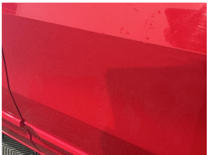
8: Door nsr Dented Between 10mm + 30mm