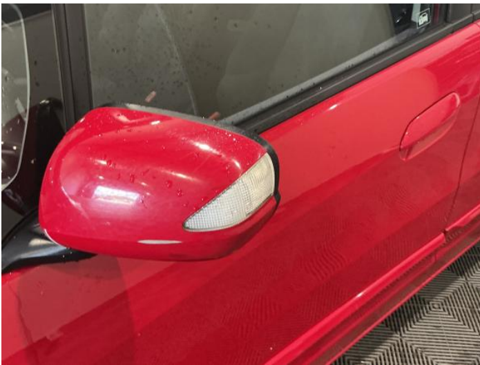
5: Door Mirror Assy nsf Scratched (Painted) Over 25mm Thru Paint