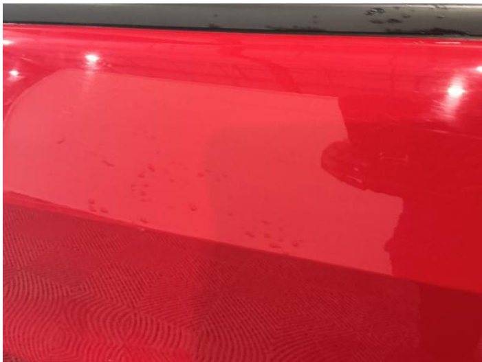
9: Door nsr Chipped 1 To 5