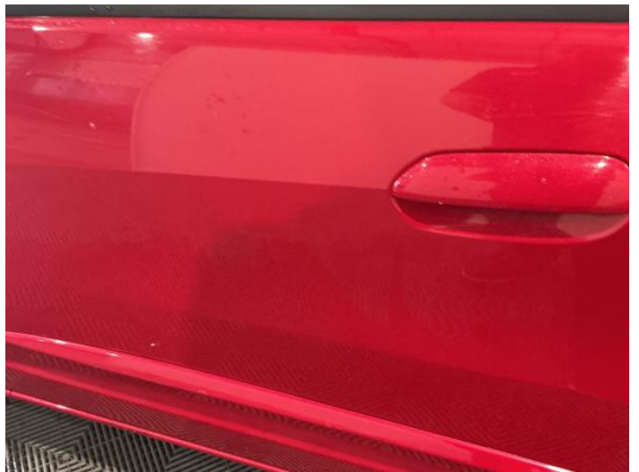
6: Door nsf Dented Over 2 UpTo 10mm