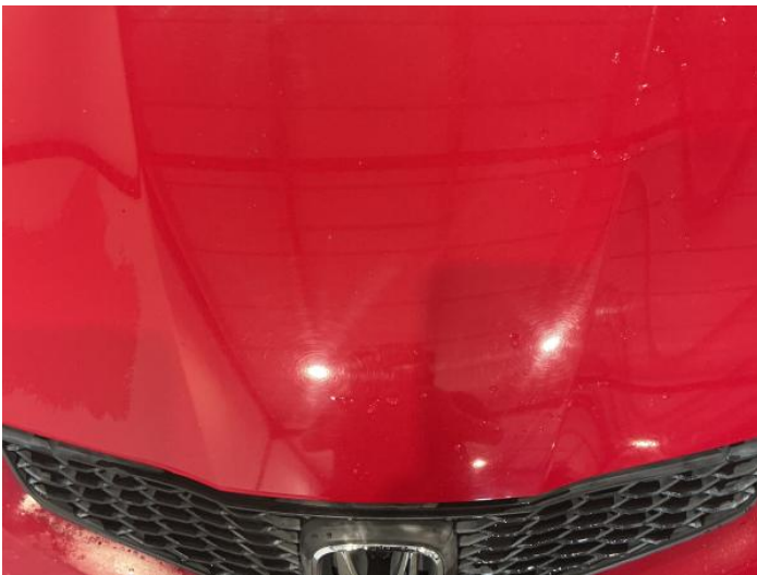
1: Bonnet Poor Previous Repair Paint Flake