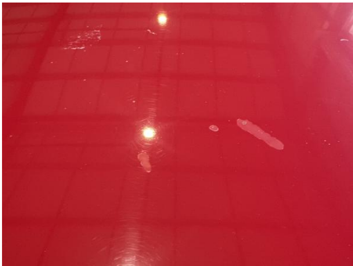
21: Roof Poor Previous Repair Paint Flake