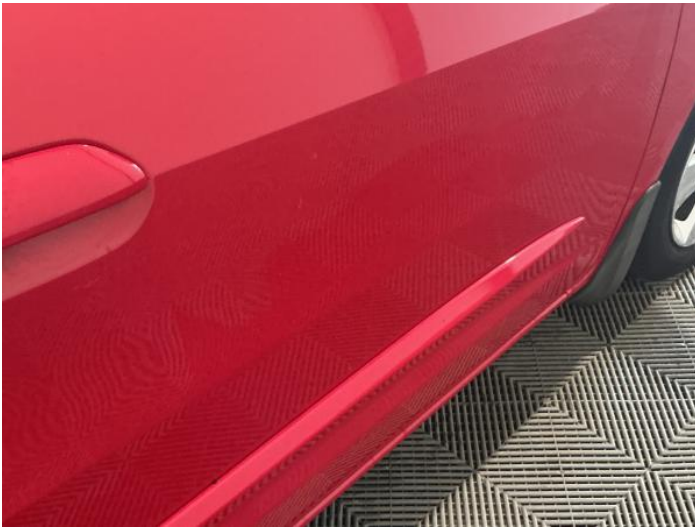
17: Door osf Chipped 1 To 5