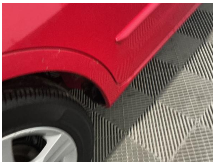
14: Qtr Panel osr Dented With Paint Damage