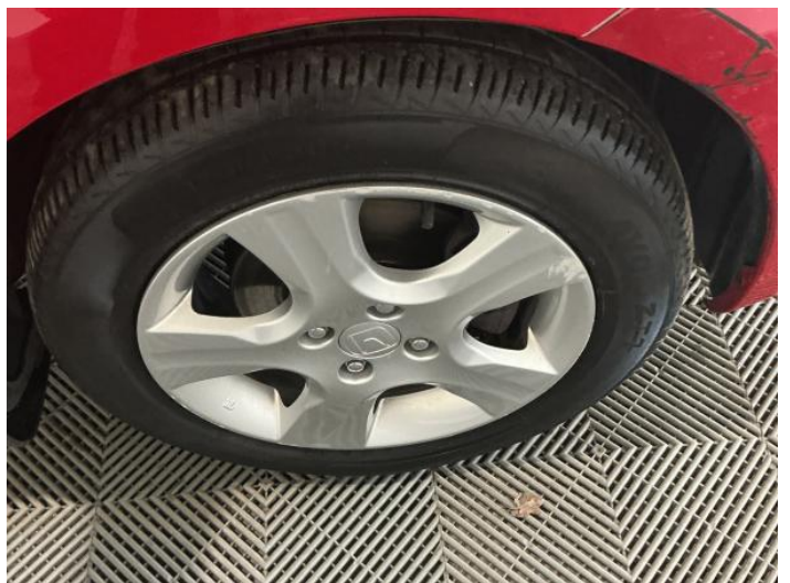
20: Wheel osf Scratched Over 50mm