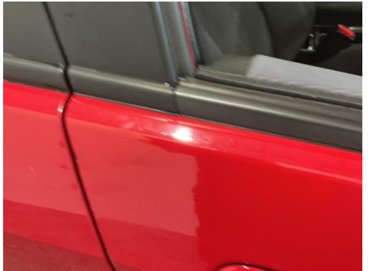
18: Door osf Dented Over 2 UpTo 10mm