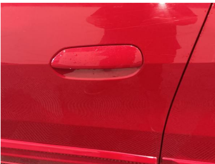
7: Door nsr Chipped 1 To 5