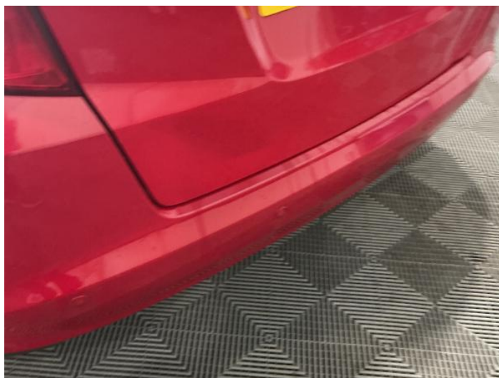
12: Bumper Rear Scratched Over 100mm Thru Paint