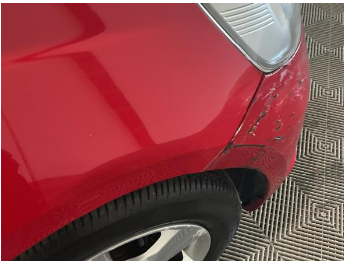
19: Wing osf Dented Over 30mm