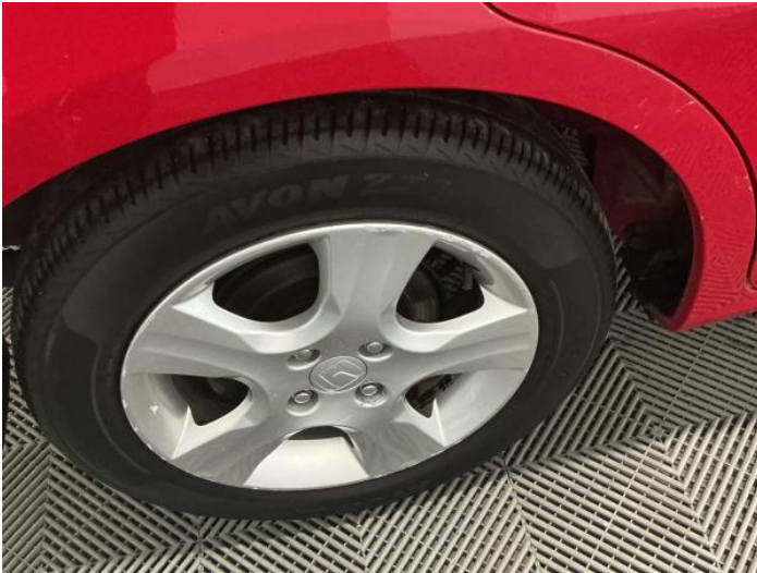
15: Wheel osr Scratched Over 50mm