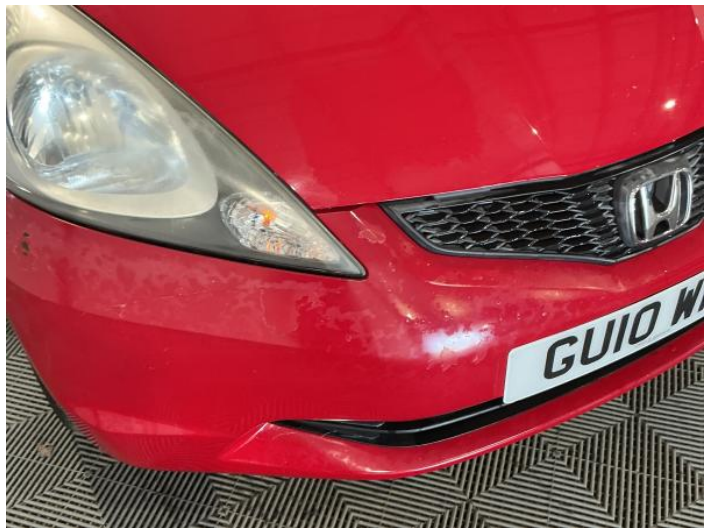
2: Bumper Front Poor Previous Repair Paint Flake