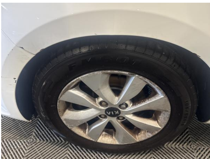
7: Wheel nsf Scratched Over 50mm