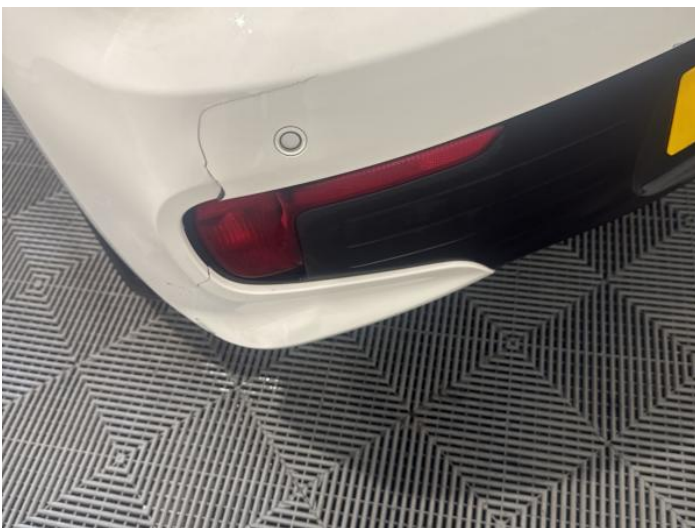
13: Reflector nsr Broken Replace