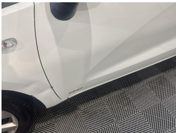
8: Door nsf Dented With Paint Damage