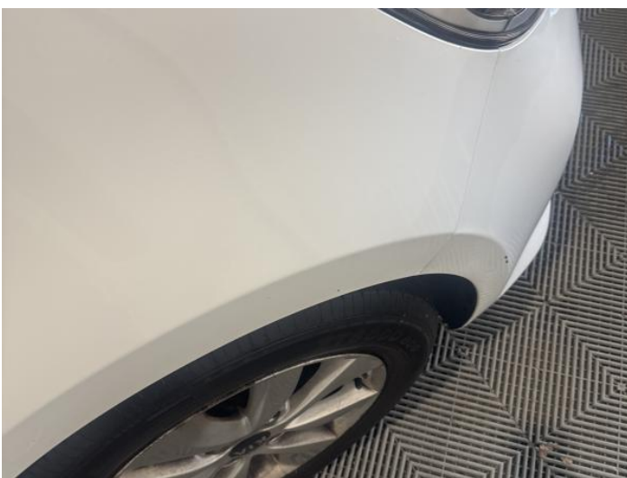
19: Wing osf Chipped 1 To 5