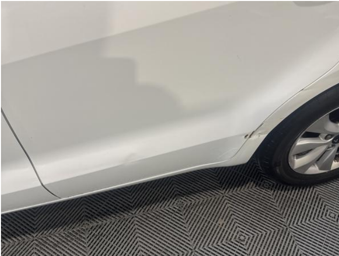
9: Door nsr Dented With Paint Damage