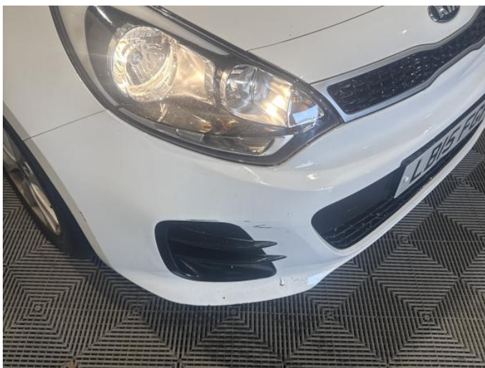
5: Bumper Front Cracked UpTo 25mm