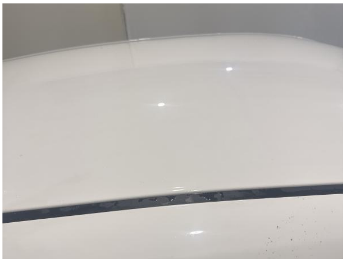
1: Roof Dented Hail - Moderate