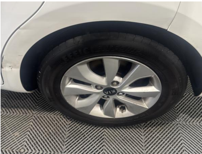
11: Wheel nsr Scratched Over 50mm