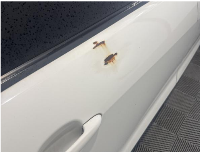
17: Door osr Rusted Over 5mm