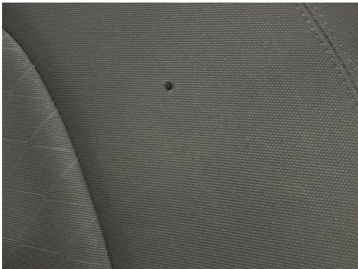
21: Seat Base Cover osf Holed UpTo 3mm