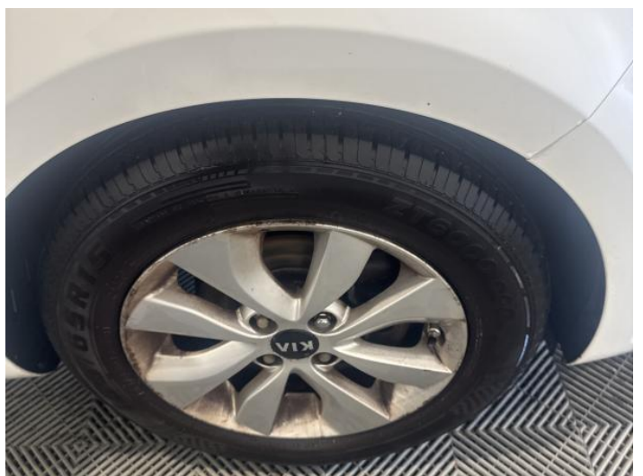
20: Wheel osf Scratched Over 50mm