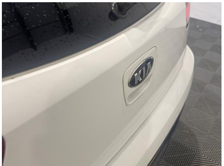
14: Boot Lid Chipped 1 To 5