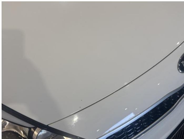
4: Bonnet Chipped 1 To 5