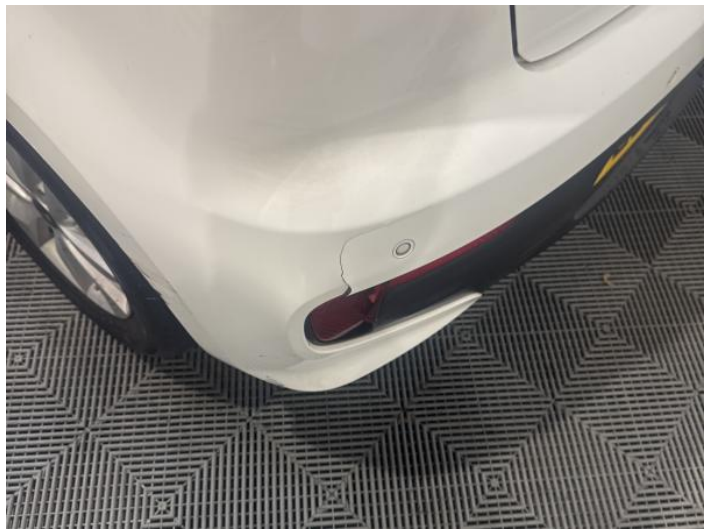
12: Bumper Rear Cracked Over 25mm