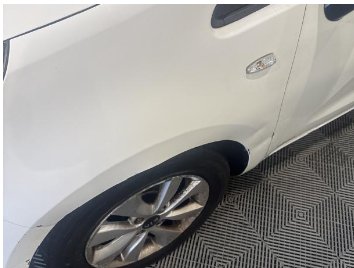
6: Wing nsf Dented With Paint Damage