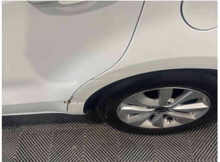
10: Qtr Panel nsr Dented With Paint Damage