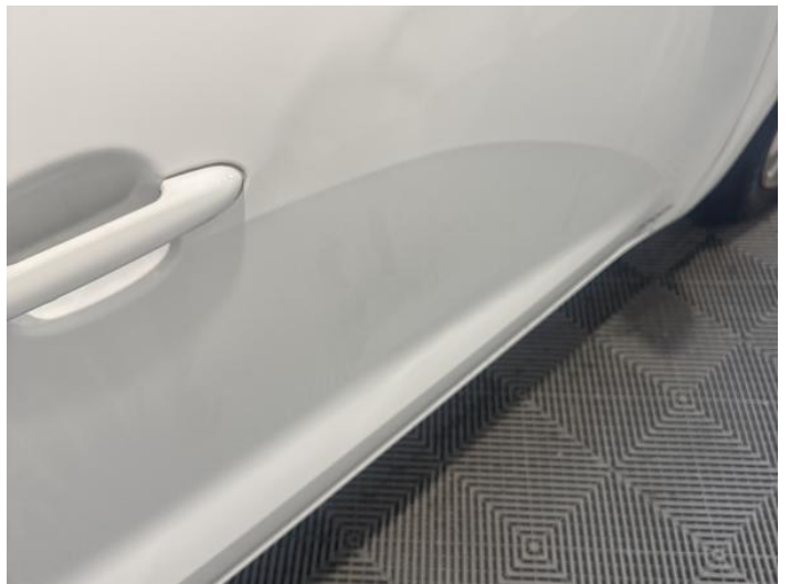
18: Door osf Dented Over 30mm