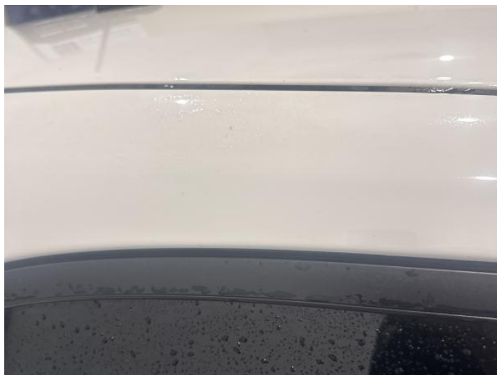
2: D Pillars Dented 2 Or Less Up To 10mm