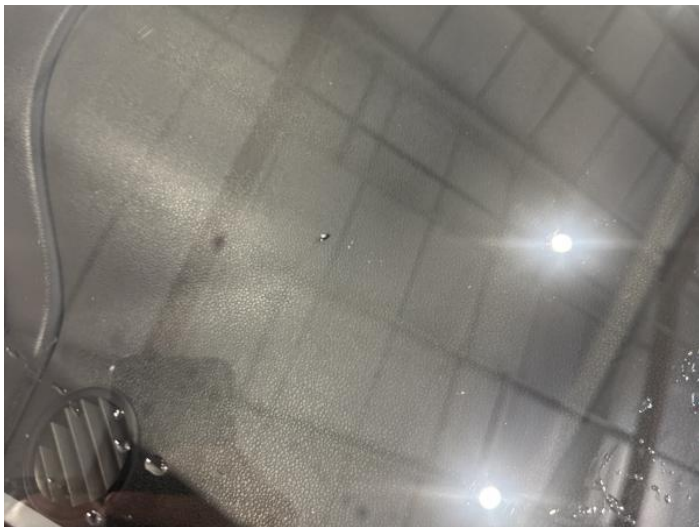
3: Screen Front Chipped UpTo 10mm