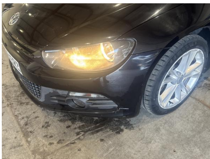
8: Bumper Front Scratched Over 100mm Thru Paint