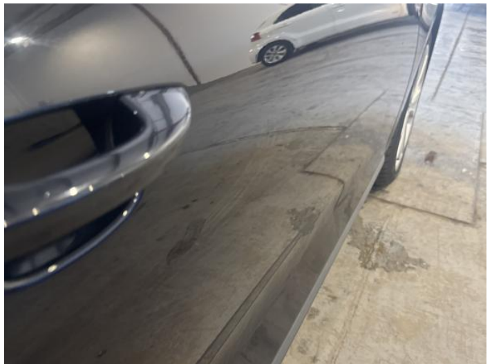
10: Door osf Dented Over 2 UpTo 10mm