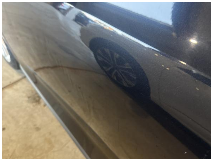
4: Door nsf Dented Over 30mm