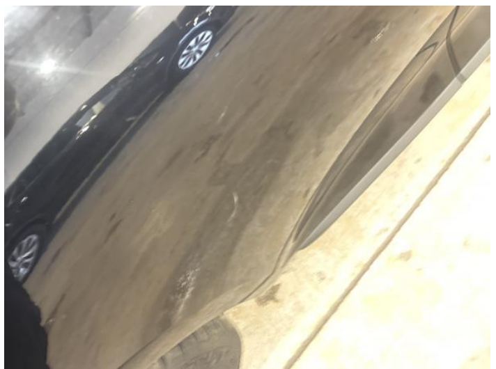
12: Qtr Panel osf Scratched Over 25mm Thru Paint