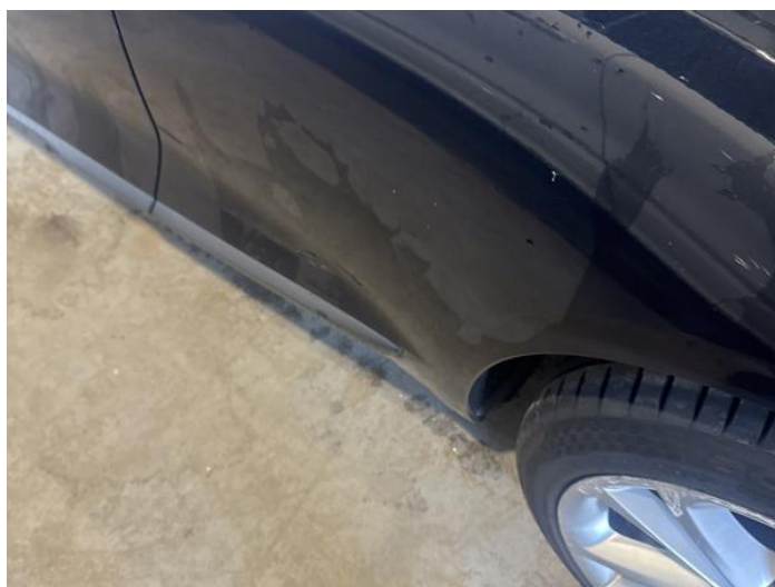
2: Qtr Panel nsr Scratched Over 25mm Thru Paint