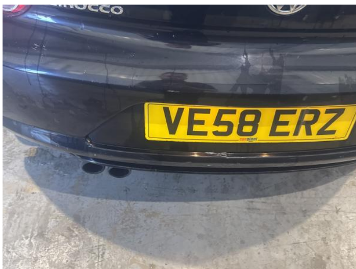
1: Bumper Rear Dented With Paint Damage