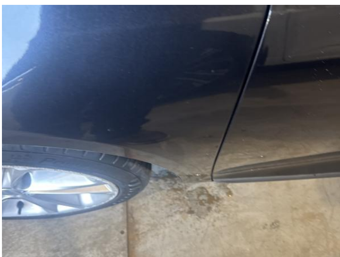
5: Wing nsf Dented 2 Or Less UpTo 10mm