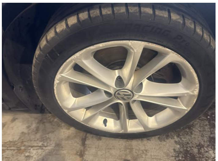
14: Wheel osf Scratched Over 50mm