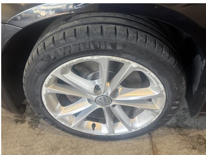
7: Wheel nsf Scratched Over 50mm