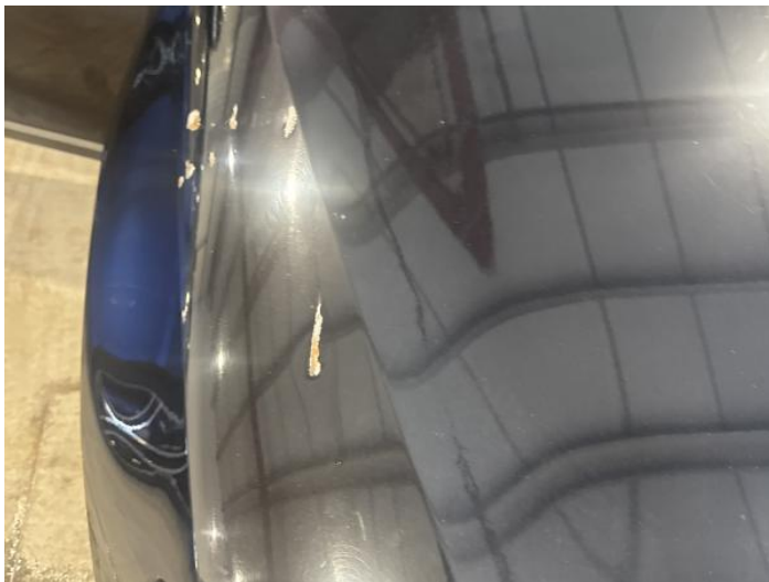
9: Bonnet Rusted Over 5mm