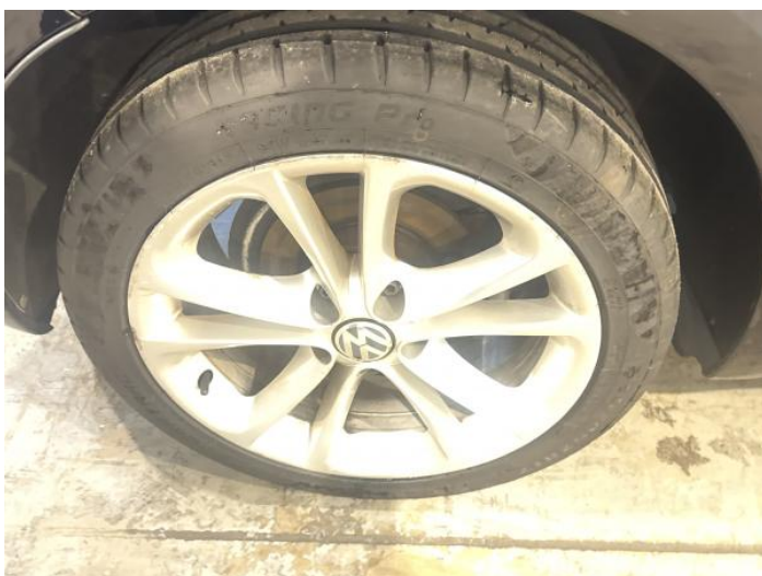
13: Wheel osr Scratched Over 50mm