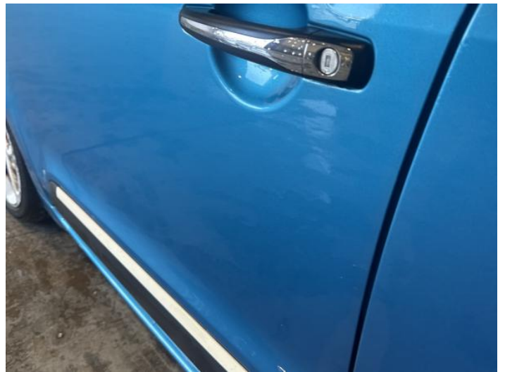
6: Door nsf Chipped 1 To 5