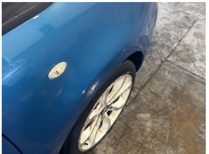
20: Wing osf Chipped 1 To 5