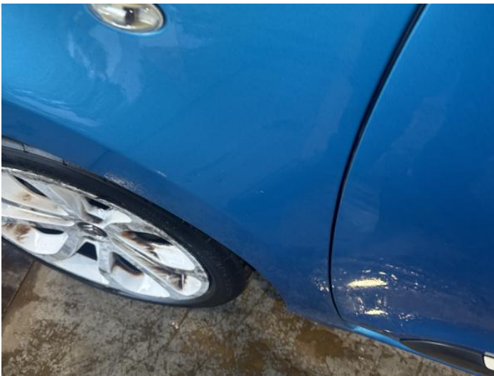
5: Wing nsf Chipped 1 To 5