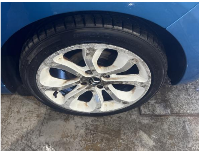
19: Wheel osf Scratched Over 50mm