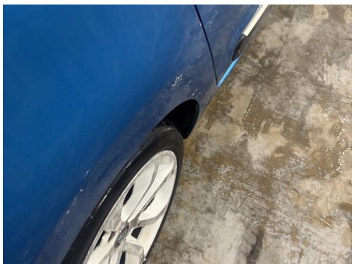
14: Qtr Panel osr Dented 2 Or Less UpTo 10mm