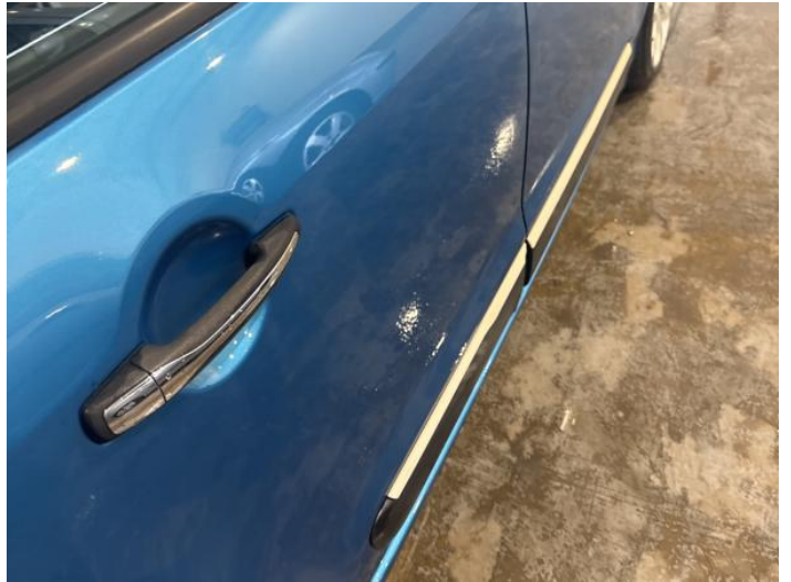
16: Door osr Chipped 1 To 5