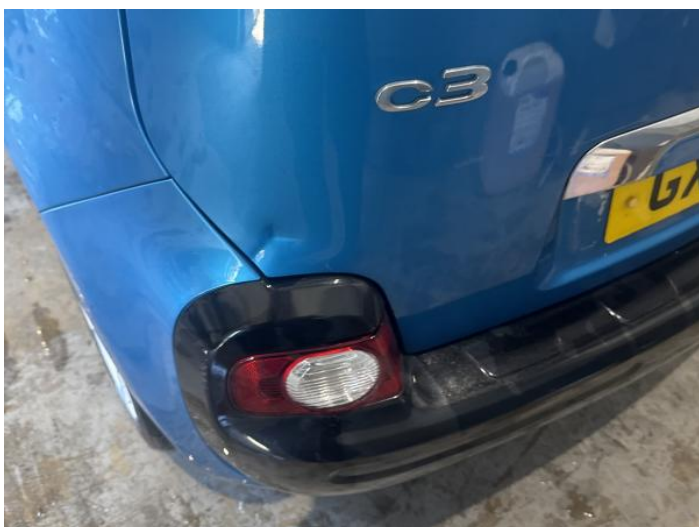
13: Boot Lid Dented Over 30mm