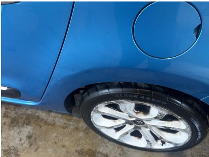
9: Qtr Panel nsr Dented With Paint Damage