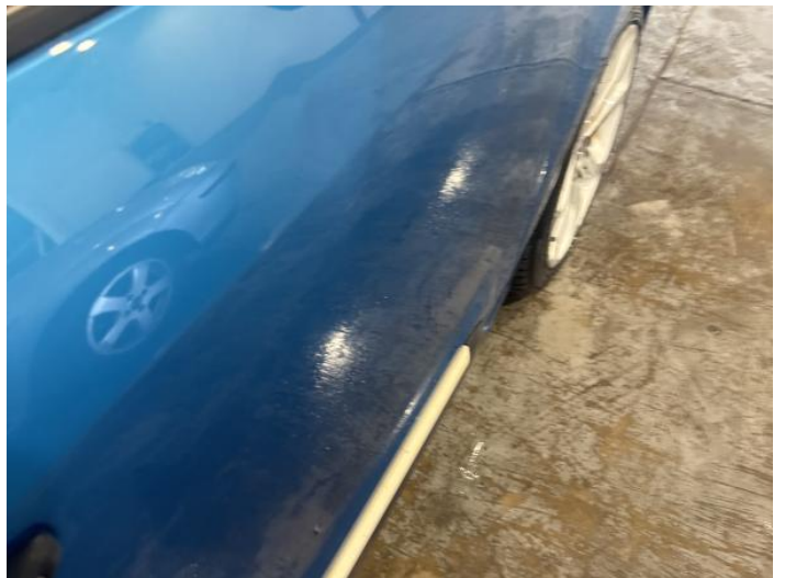
18: Door osf Dented Over 30mm