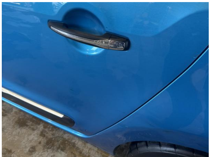
7: Door nsf Scratched Over 25mm Not Thru Paint