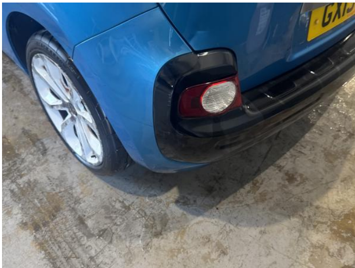
11: Bumper Rear Scratched 25 to 100mm Thru Paint