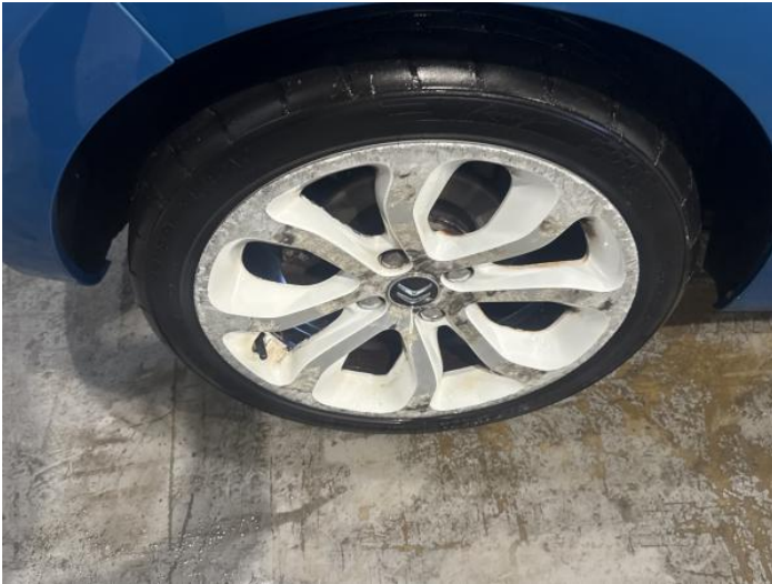
15: Wheel osr Scratched Over 50mm