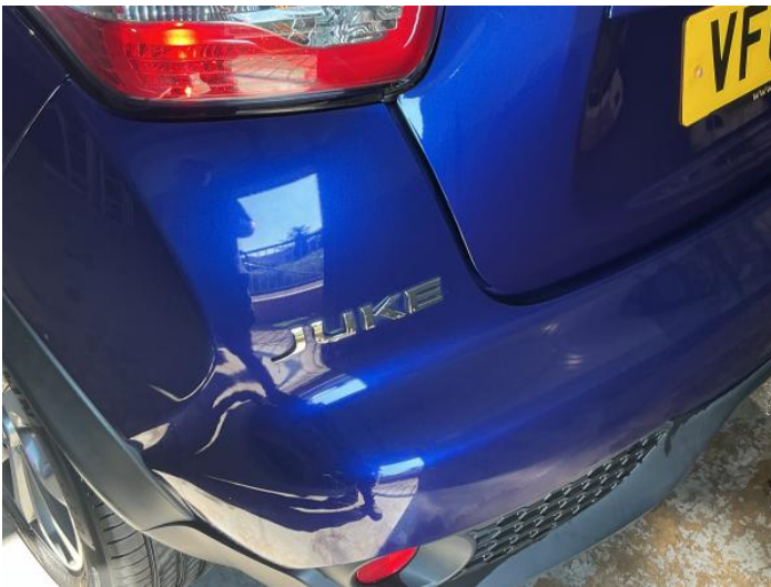
11: Bumper Rear Scratched 25 to 100mm Thru Paint