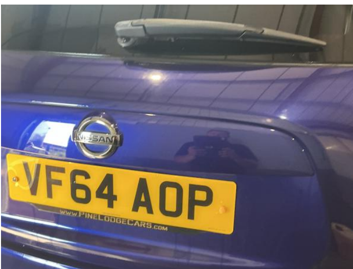
13: Boot Lid Scratched Over 25mm Not Thru Paint