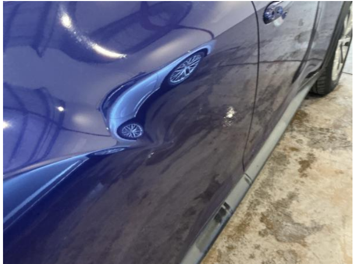
15: Qtr Panel osr Scratched Over 25mm Not Thru Paint