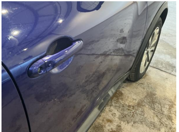
17: Door osr Scratched Over 25mm Not Thru Paint