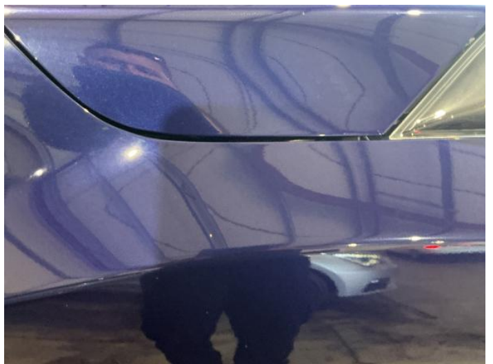
19: Door osf Scratched Over 25mm Not Thru Paint