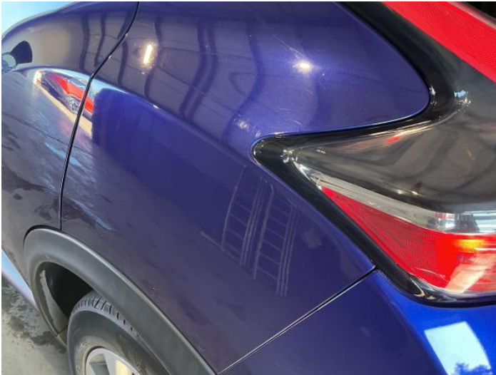
9: Qtr Panel nsr Dented Over 2 UpTo 10mm