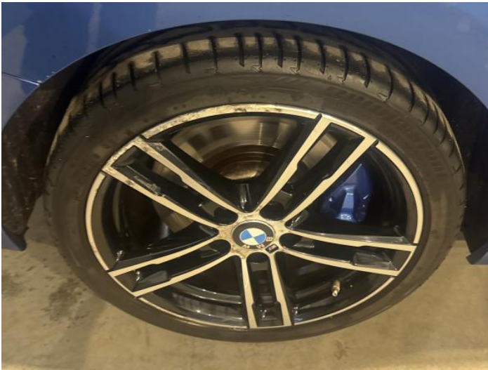
5: Wheel osr Scratched Over 50mm