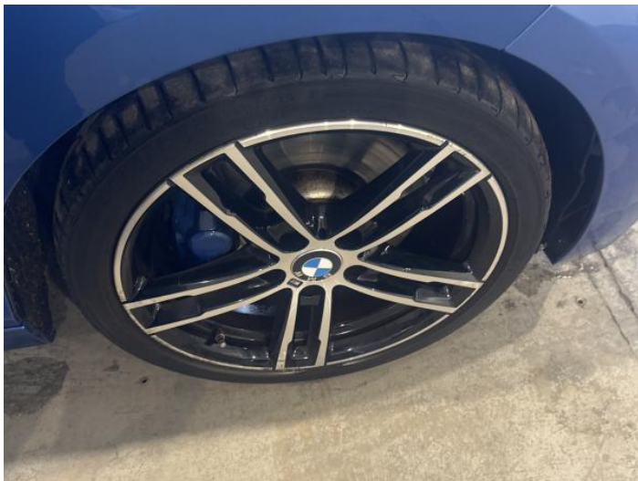
9: Wheel osf Scratched Over 50mm