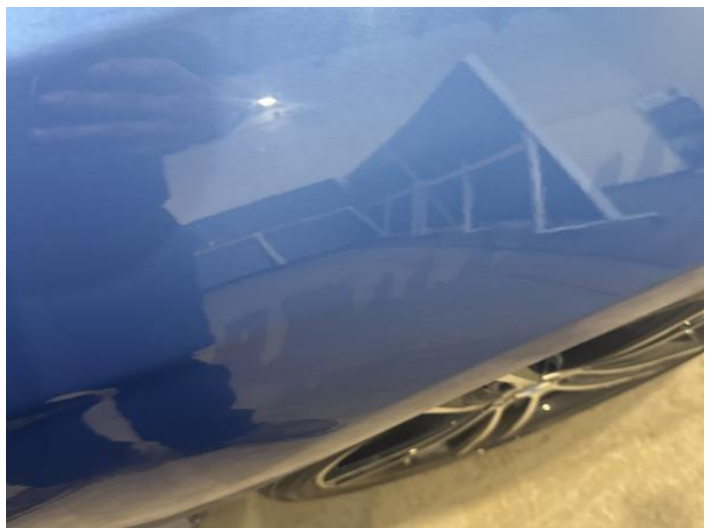
7: Door osf Scratched Over 25mm Not Thru Paint