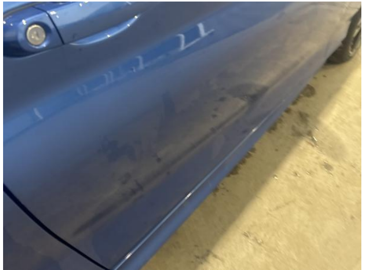
6: Door osf Dented Over 2 UpTo 10mm