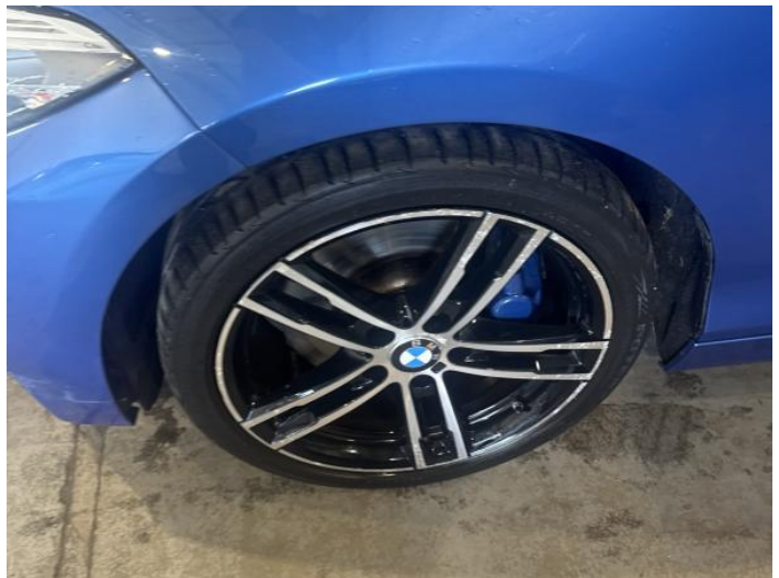
12: Wheel nsf Scratched Over 50mm