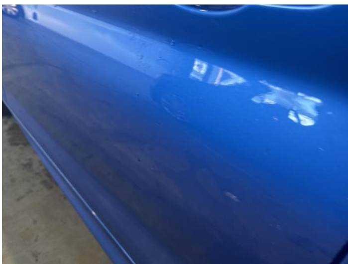
13: Door nsf Chipped 1 To 5