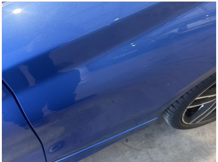
16: Qtr Panel nsr Dented Over 2 UpTo 10mm