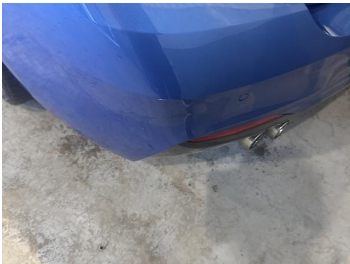
1: Bumper Rear Scratched 25 to 100mm Thru Paint