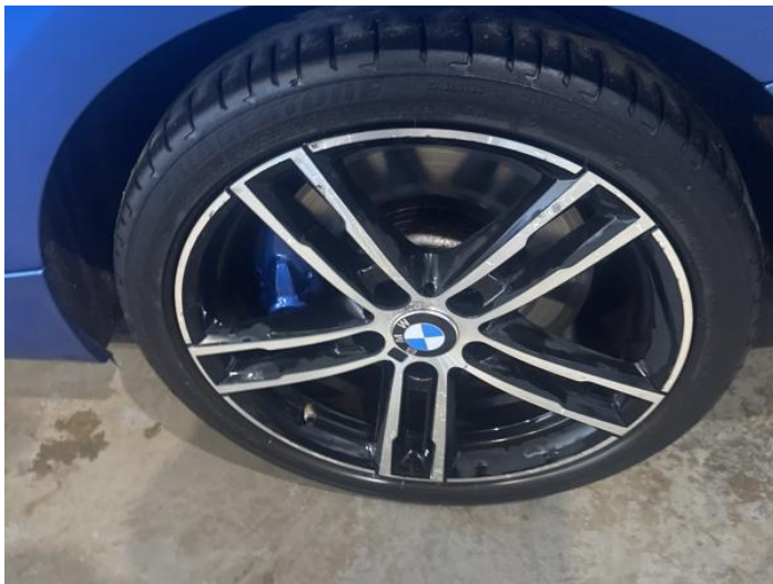
15: Wheel nsr Scratched Over 50mm