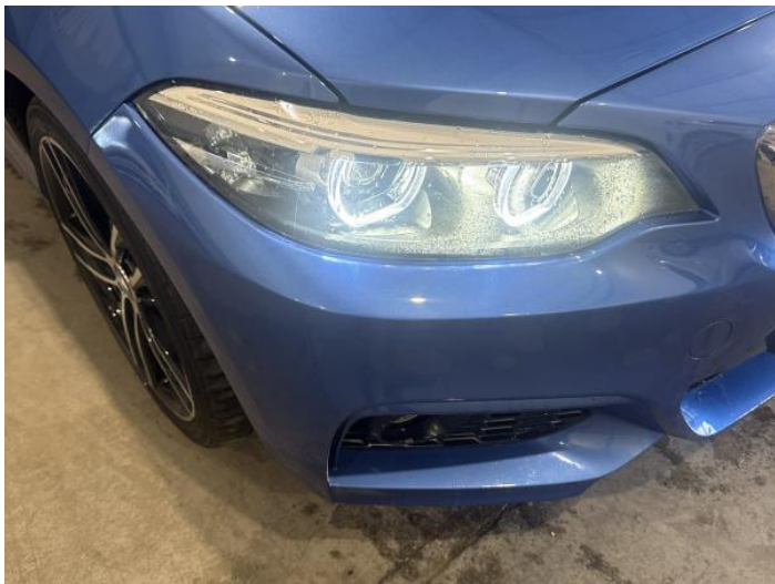
11: Bumper Front Scratched Over 100mm Thru Paint