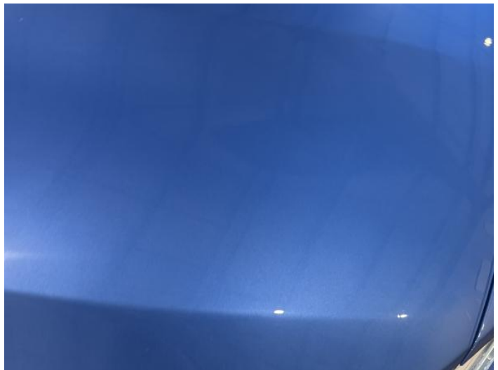
10: Bonnet Chipped 1 To 5