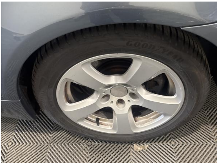
9: Wheel nsr Scratched Over 50mm