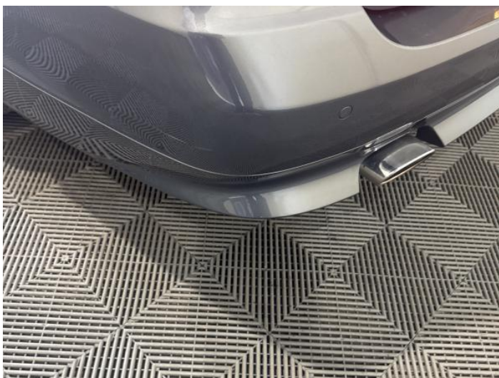
11: Bumper Rear Scratched Over 100mm Thru Paint