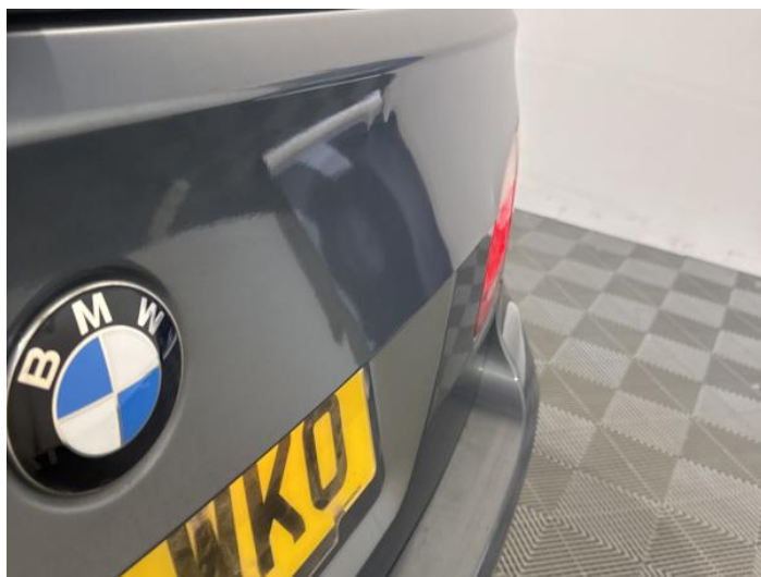
12: Boot Lid Dented Over 2 UpTo 10mm