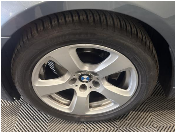
3: Wheel nsf Scratched Up To 50mm