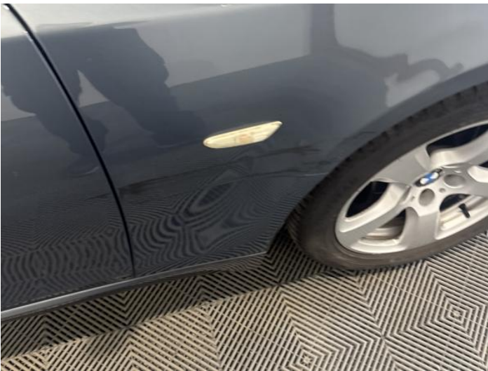
17: Wing osf Dented With Paint Damage