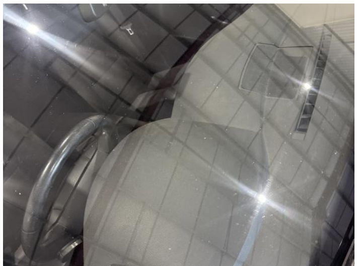
20: Screen Front Chipped UpTo 10mm