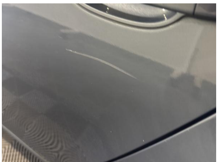
8: Door nsr Scratched Over 25mm Thru Paint