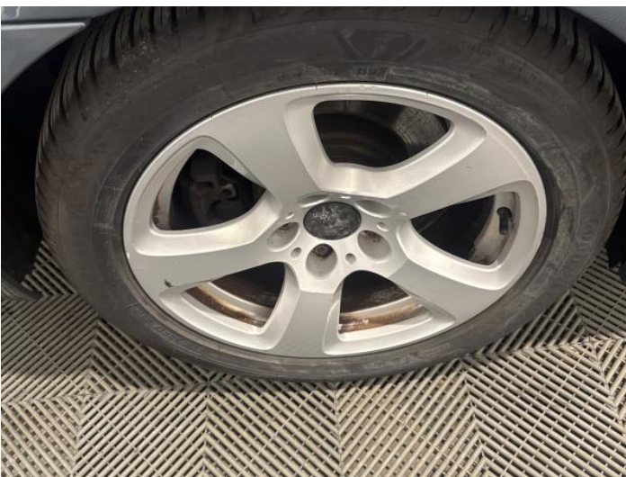
19: Wheel osr Scratched Over 50mm