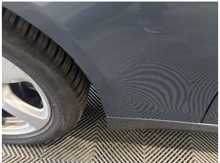
4: Wing nsf Scratched UpTo 25mm Thru Paint