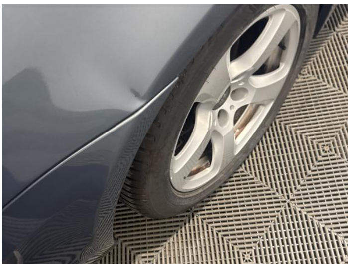
13: Qtr Panel osr Dented Over 30mm