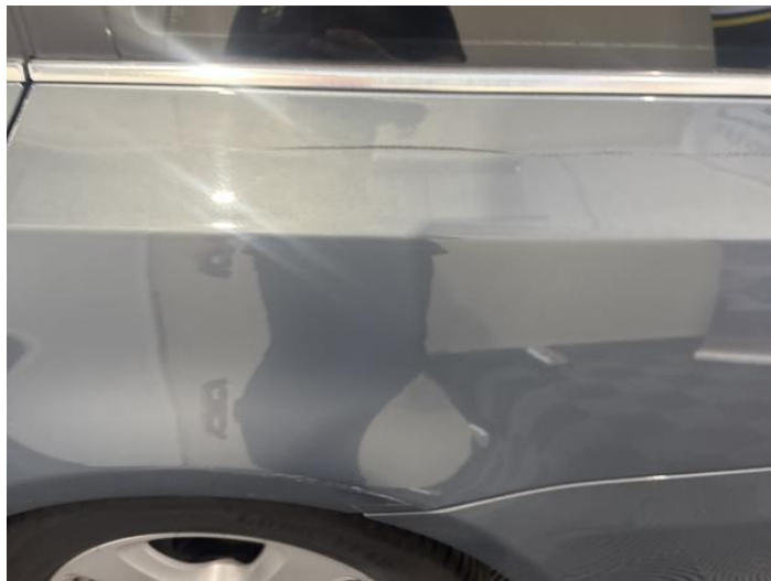
10: Qtr Panel nsr Scratched Over 25mm Thru Paint