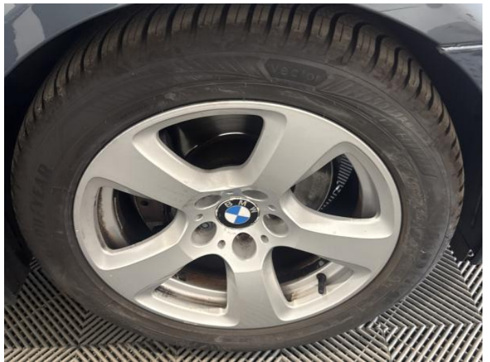
18: Wheel osf Scratched Over 50mm