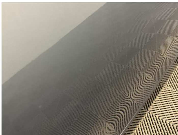
14: Door osr Chipped 1 To 5