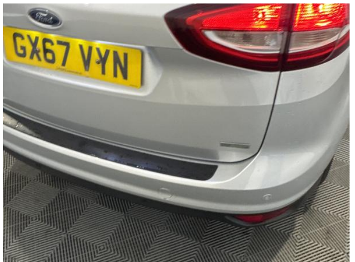
7: Qtr Panel nsr Scratched Over 25mm Not Thru Paint