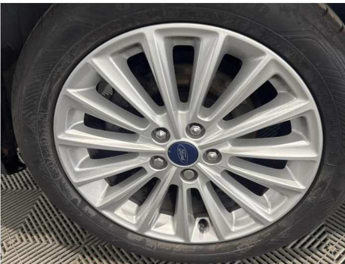
11: Wheel osr Scratched Up To 50mm