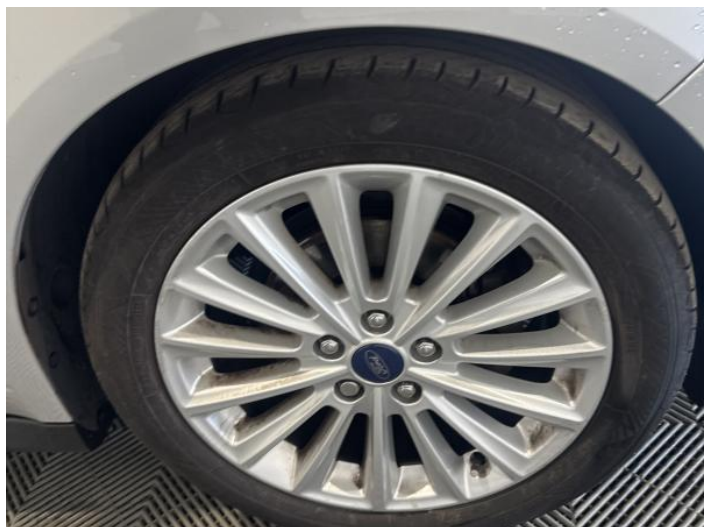
14: Wheel osf Scratched Over 50mm