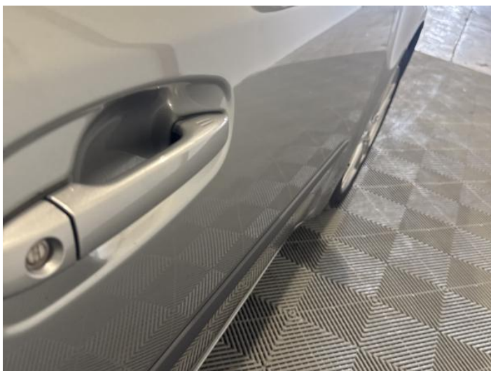
17: Door osf Dented Between 10mm + 30mm