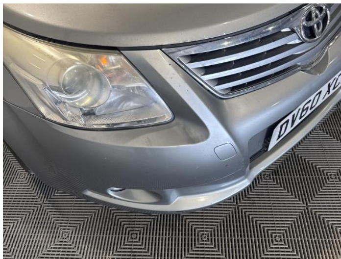
2: Bumper Front Poor Previous Repair Poor Paint