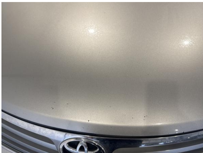
1: Bonnet Dented With Paint Damage