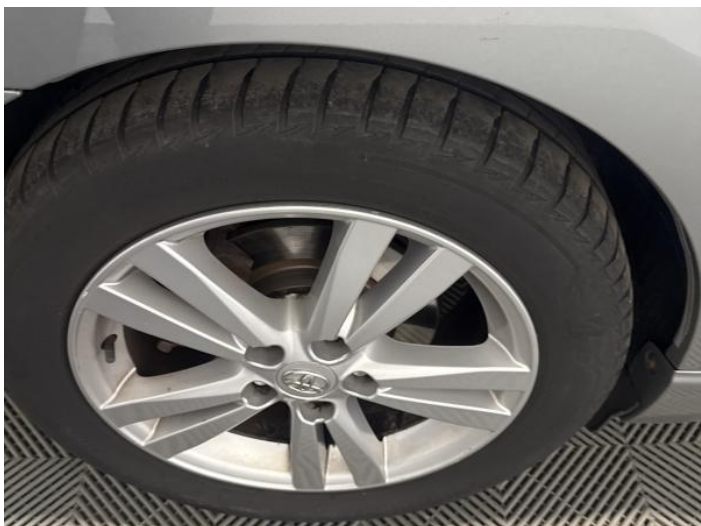
15: Wheel osr Scratched Over 50mm