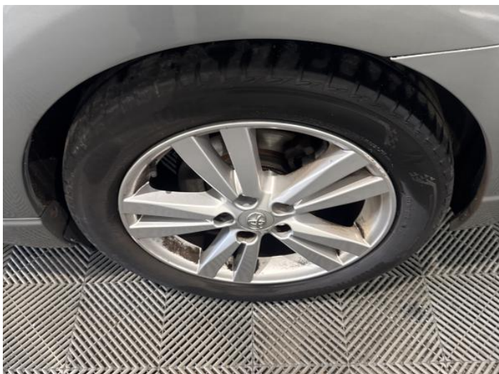
9: Wheel nsr Scratched Over 50mm