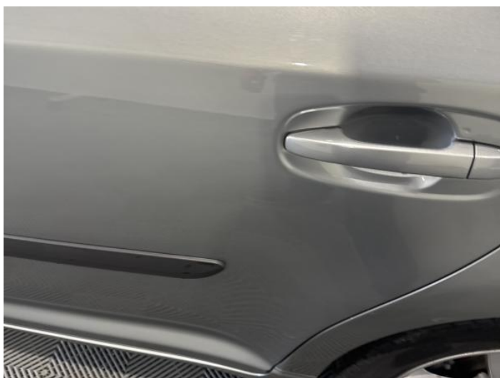
7: Door nsr Chipped 1 To 5