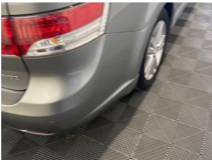
11: Bumper Rear Scratched 25 to 100mm Thru Paint