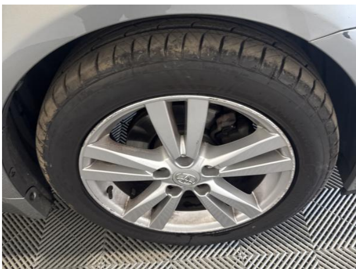
19: Wheel osf Scratched Over 50mm