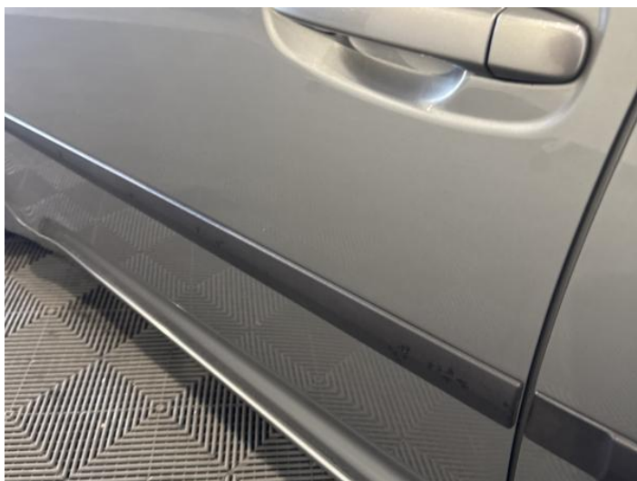
5: Door nsf Dented Over 2 UpTo 10mm