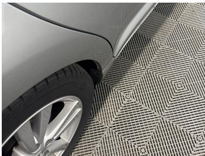
14: Qtr Panel osr Dented Between 10mm + 30mm