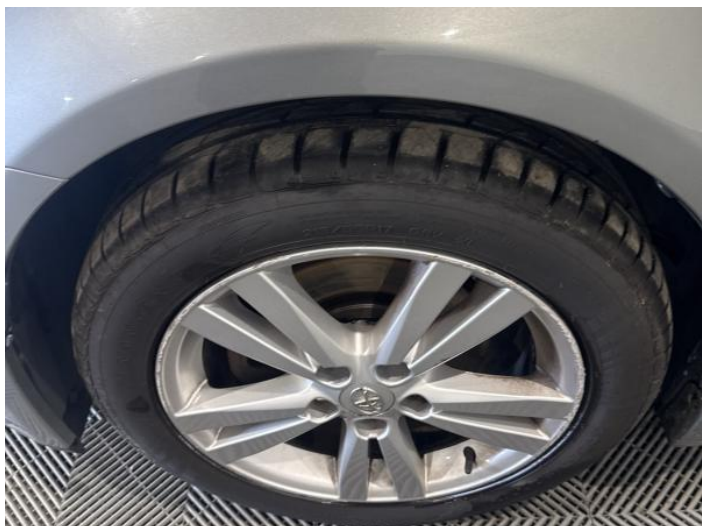
3: Wheel nsf Scratched Over 50mm