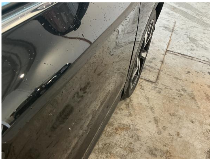
17: Door osf Dented Over 30mm