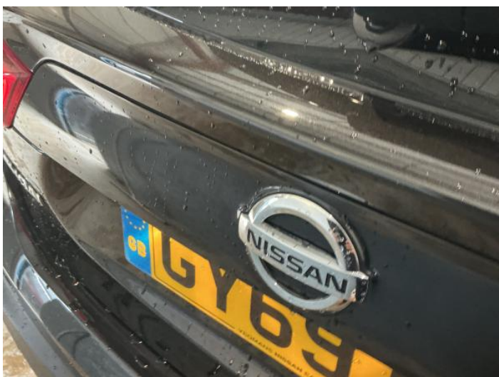
13: Boot Lid Dented Over 2 UpTo 10mm