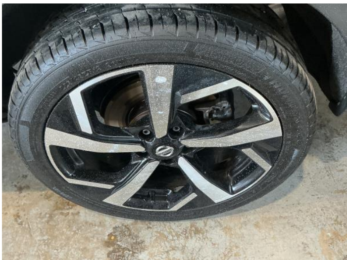
9: Wheel nsr Scratched Over 50mm