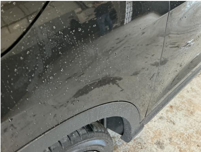
5: Wing nsf Dented Between 10mm + 30mm