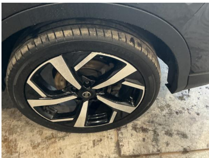
19: Wheel osf Scratched Up To 50mm