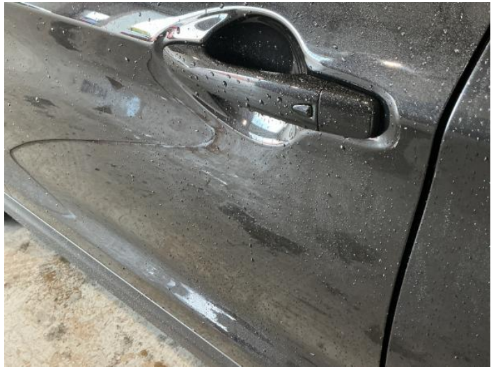
6: Door nsf Chipped 1 To 5