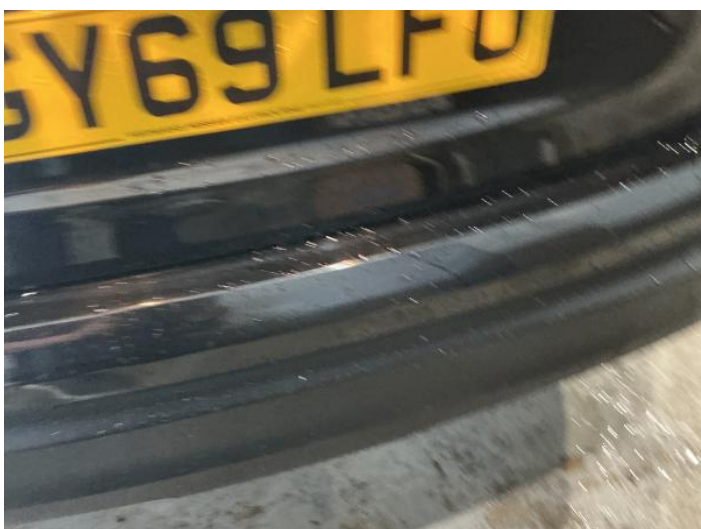
11: Bumper Rear Chipped Multiple Chips