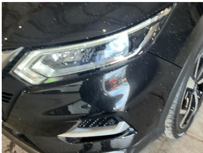
2: Bumper Front Chipped Multiple Chips