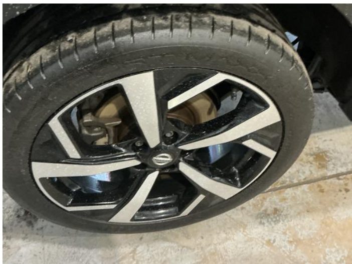
15: Wheel osr Scratched Up To 50mm