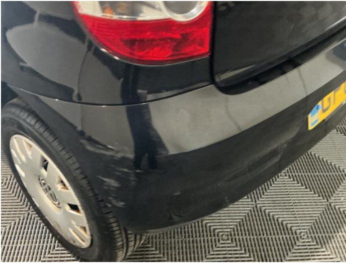
9: Bumper Rear Scratched Over 100mm Thru Paint