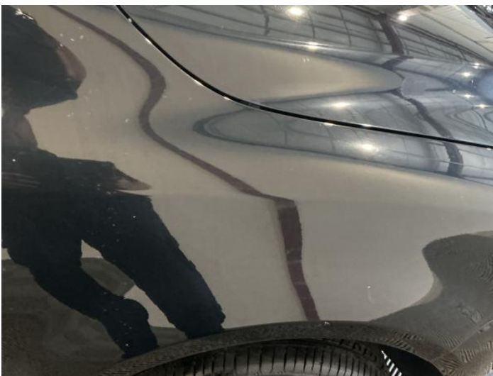
13: Wing osf Chipped Multiple Chips