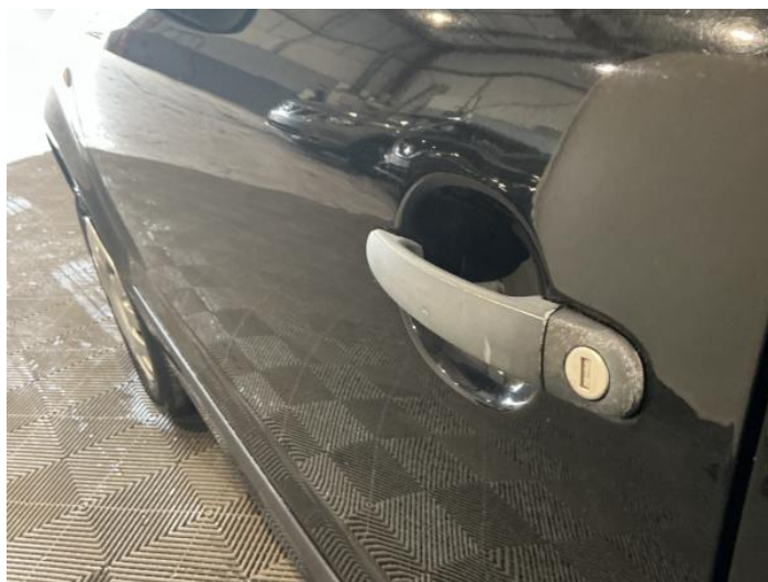
6: Door nsf Dented With Paint Damage