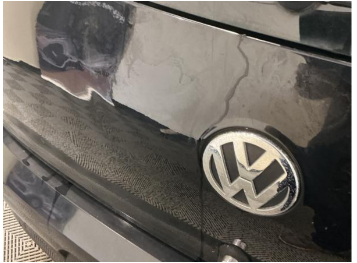
10: Boot Lid Dented Over 30mm