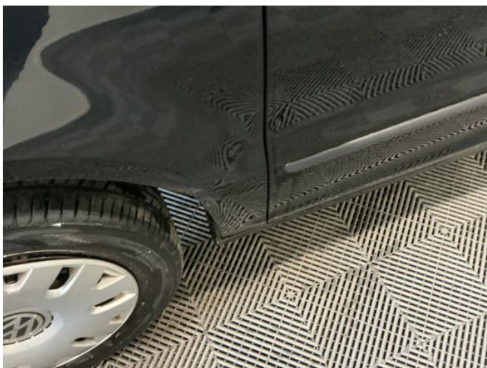
5: Wing nsf Dented Over 30mm