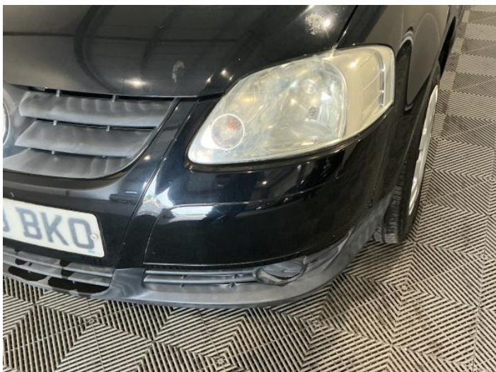
3: Bumper Front Scratched 25 to 100mm Thru Paint