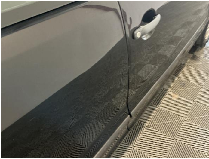
11: Qtr Panel osr Dented Over 30mm