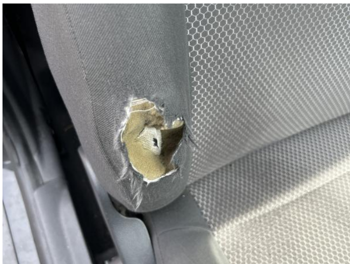
1: Seat Back Cover osf Holed Over 3mm