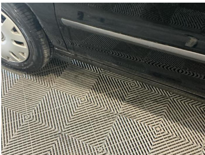
7: Sill ns Dented With Paint Damage