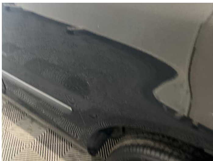
8: Qtr Panel nsr Scratched Over 25mm Thru Paint