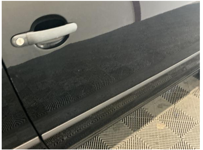
12: Door osf Dented With Paint Damage