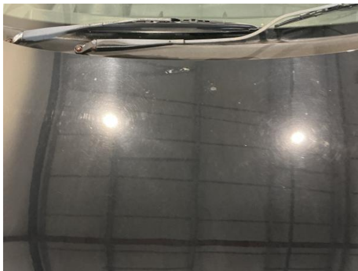
2: Bonnet Poor Previous Repair Paint Flake