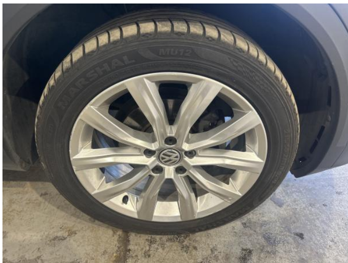
1: Wheel osf Scratched Over 50mm