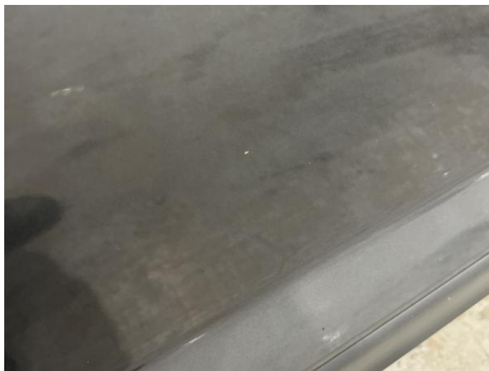
2: Door osf Chipped 1 To 5