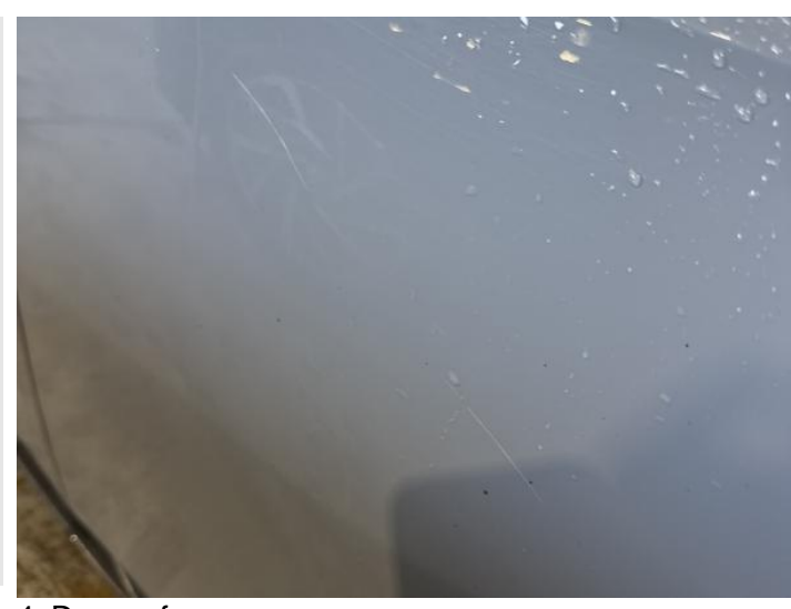
4: Door nsf Scratched Over 25mm Thru Paint

3: Wing nsf Scratched Over 25mm Not Thru Paint