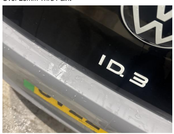
6: Bumper Rear Scratched 25 to 100mm Thru Paint

5: Door nsr Scratched Over 25mm Not Thru Paint