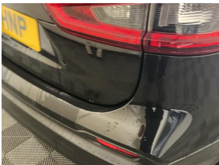
11: Bumper Rear Chipped Multiple Chips