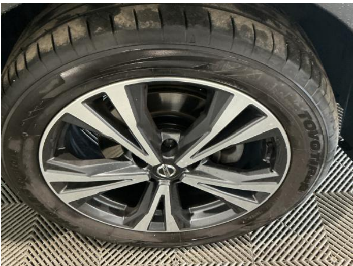
19: Wheel osf Scratched Up To 50mm