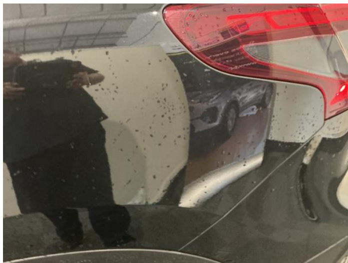
10: Qtr Panel nsr Poor Previous Repair Poor Paint