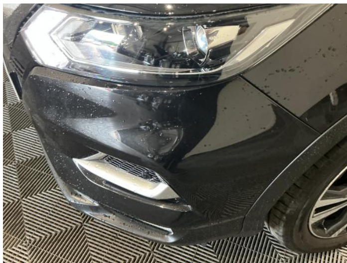
2: Bumper Front Scratched 25 to 100mm Thru Paint