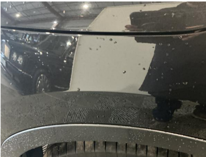
5: Wing nsf Scratched Over 25mm Thru Paint