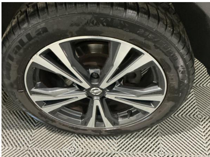
9: Wheel nsr Scratched Over 50mm