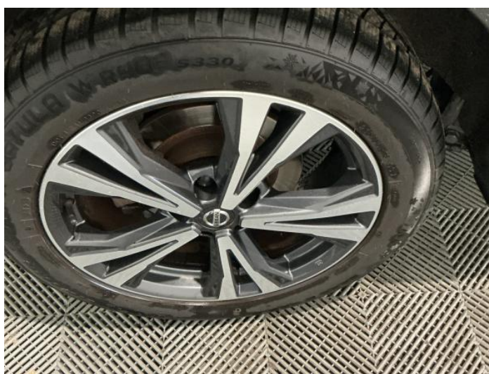
14: Wheel osr Scratched Up To 50mm