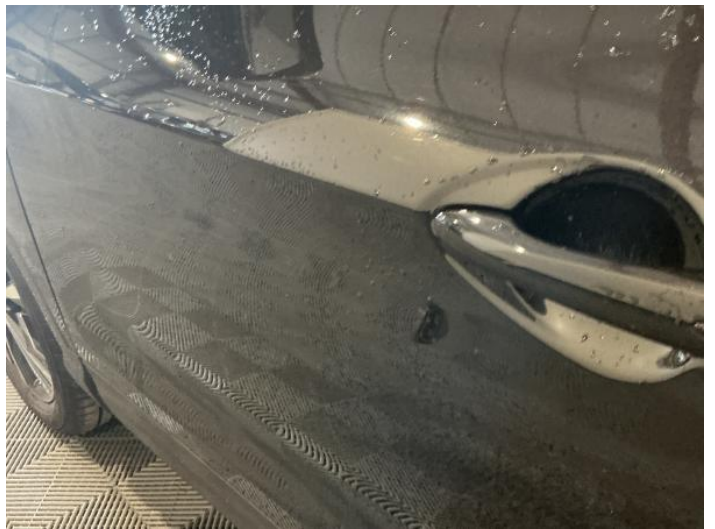
6: Door nsf Chipped 1 To 5