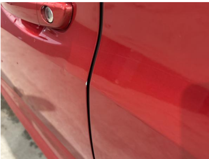
7: Door nsf Chipped Edge Chip