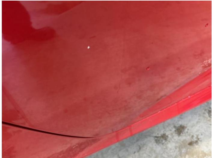
4: Door osr Chipped 1 To 5