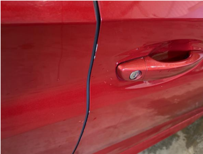
3: Door osf Chipped Edge Chip