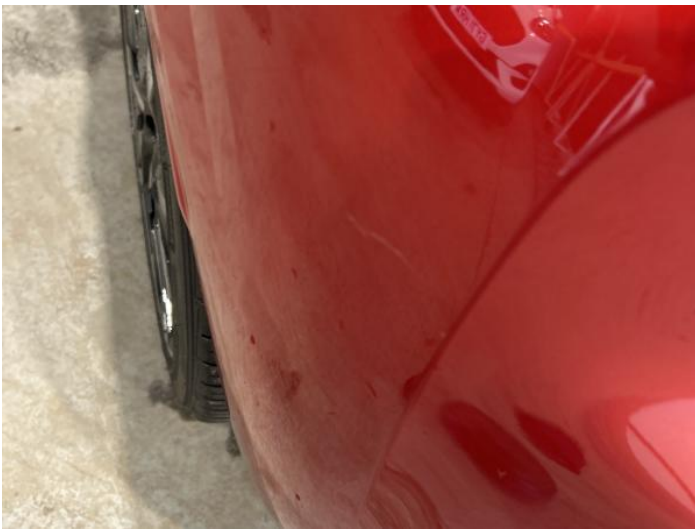
5: Bumper Rear Scratched Over 25mm Not Thru Paint