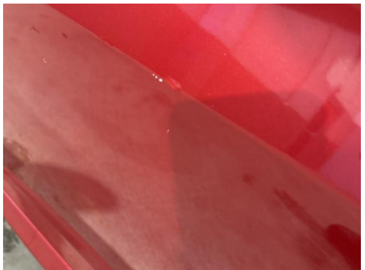
8: Door nsf Chipped 1 To 5