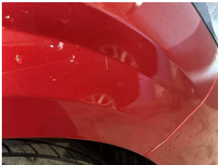
2: Wing osf Chipped 1 To 5