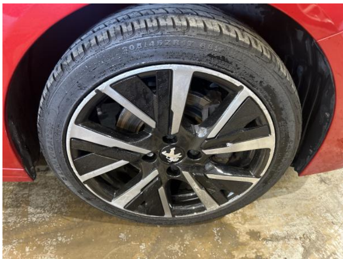
1: Wheel osf Scratched Over 50mm