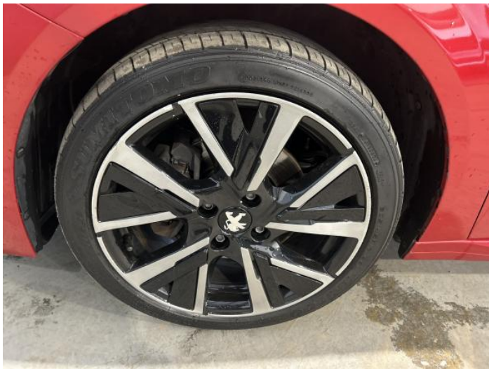
9: Wheel nsf Scratched Over 50mm