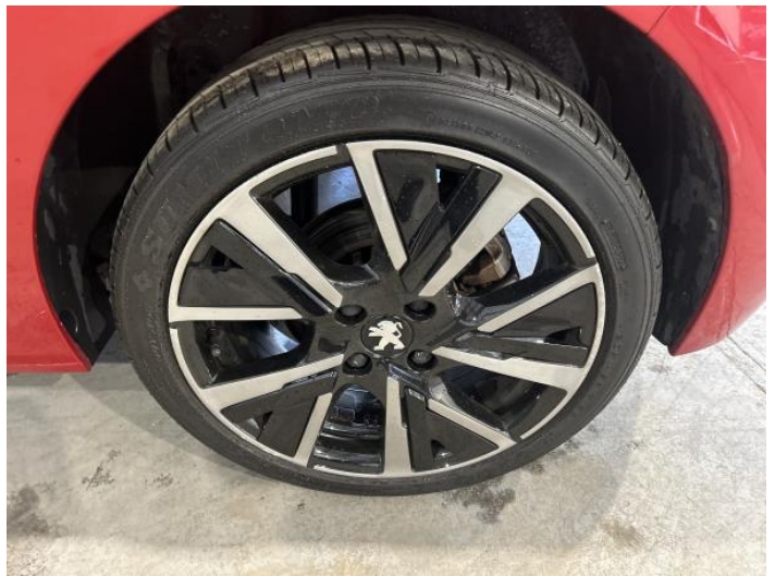
6: Wheel nsr Scratched Over 50mm