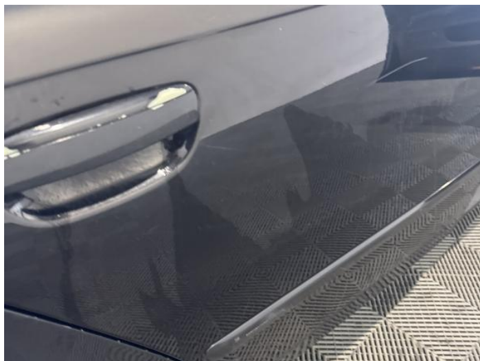
16: Door osr Scratched Over 25mm Thru Paint