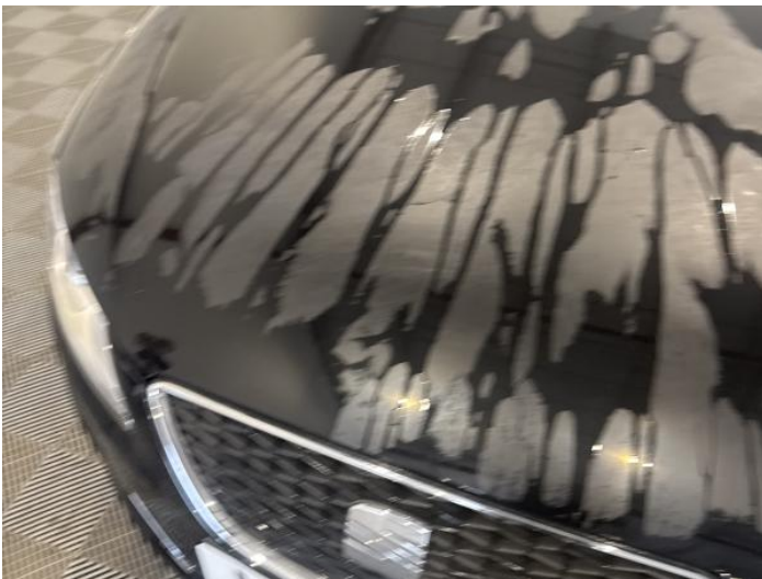
1: Bonnet Poor Previous Repair Poor Paint