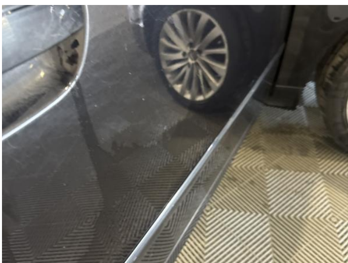
17: Door osf Chipped 1 To 5