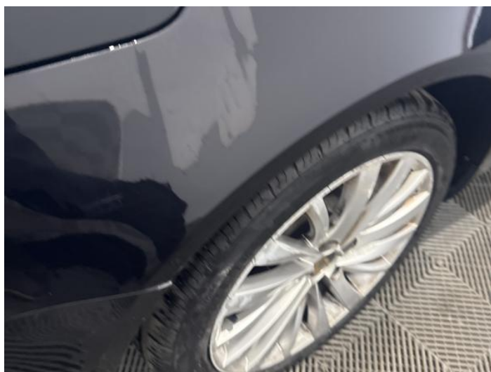
14: Qtr Panel osr Scratched UpTo 25mm Thru Paint