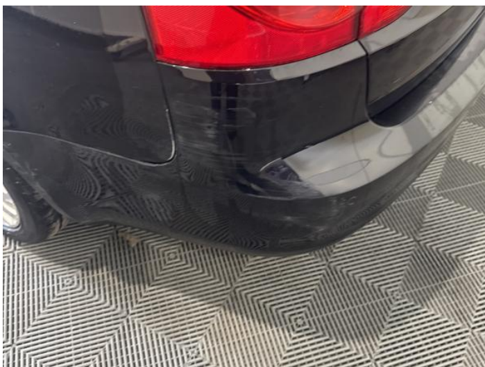
11: Bumper Rear Scratched Over 100mm Thru Paint