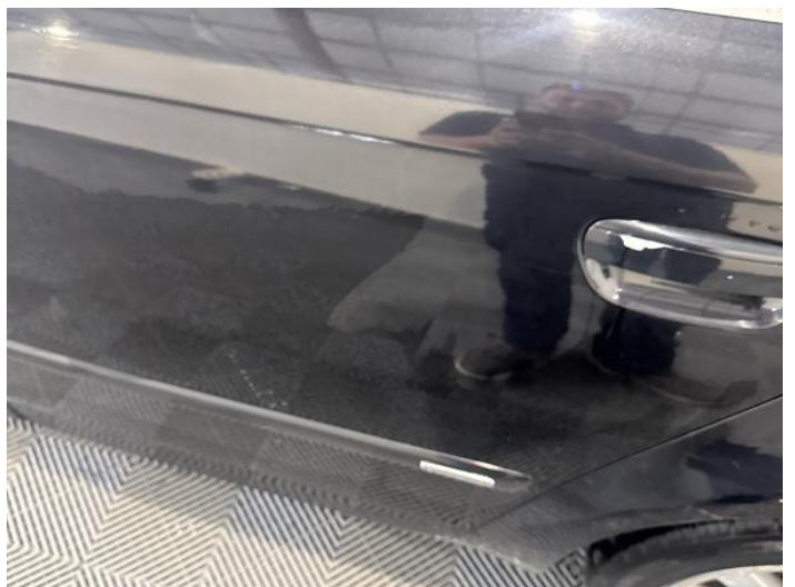
7: Door nsf Scratched Over 25mm Not Thru Paint