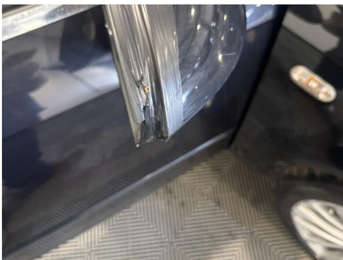
19: Door Mirror Assy osf Broken Replace