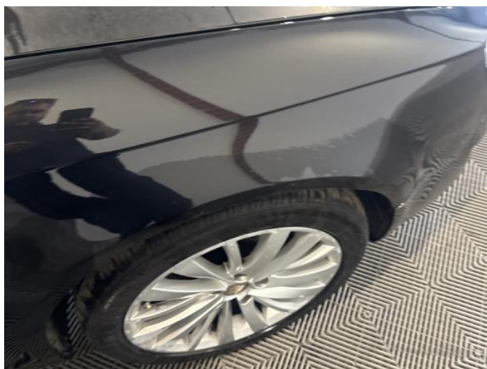
20: Wing osf Chipped 1 To 5