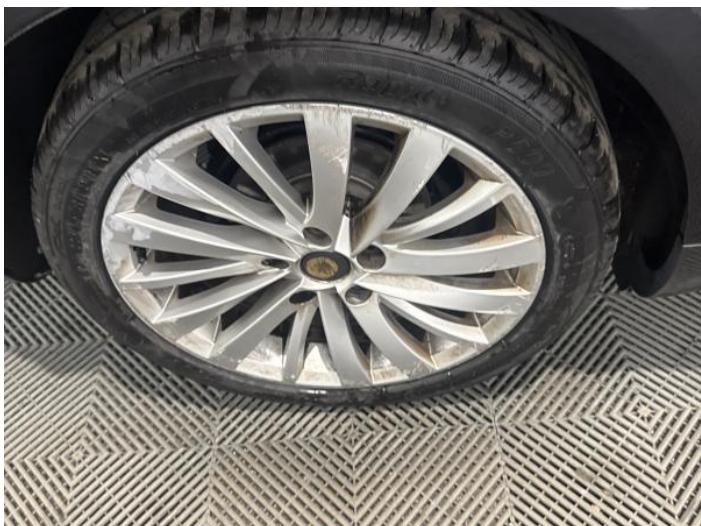
15: Wheel osr Scratched Over 50mm