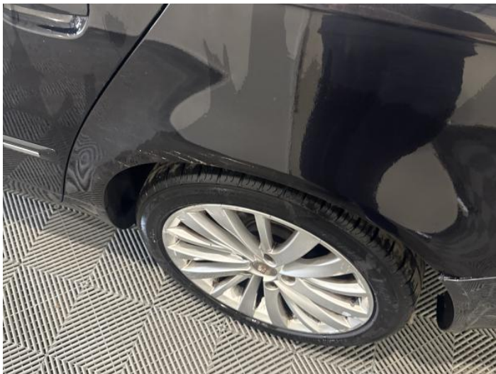
9: Qtr Panel nsr Dented With Paint Damage