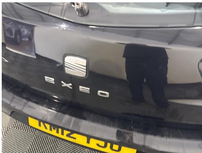
12: Boot Lid Chipped 1 To 5