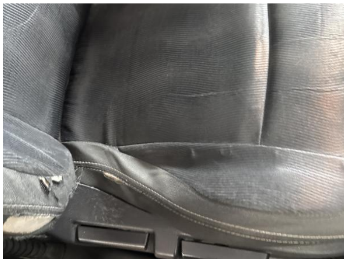
2: Seat Base Cover osf Torn UpTo 3mm