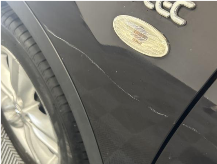
15: Wing nsf Scratched Over 25mm Thru Paint