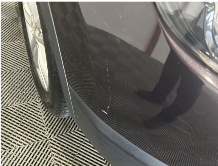
17: Bumper Front Scratched 25 to 100mm Thru Paint