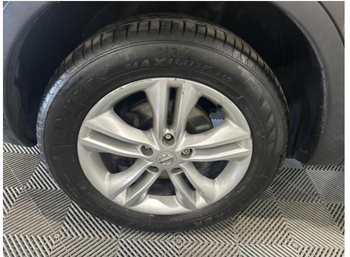
16: Wheel nsf Scratched Over 50mm