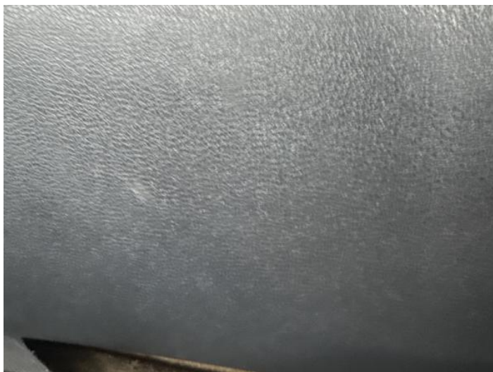
1: Door Pad osf Torn Over 10mm