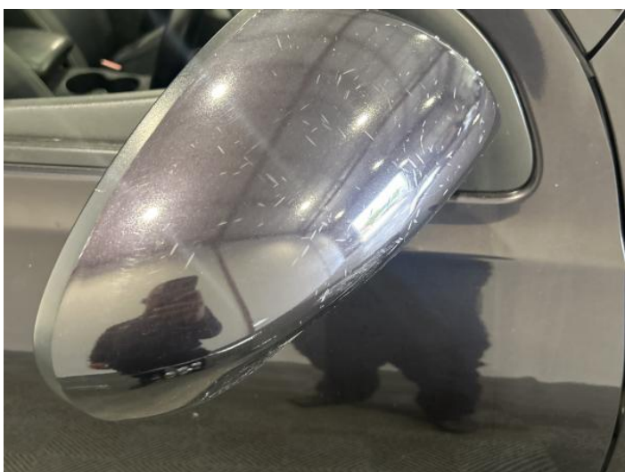
5: Door Mirror Assy osf Scratched (Painted) Over 25mm Thru Paint