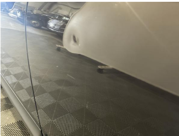
13: Door nsr Dented Over 30mm