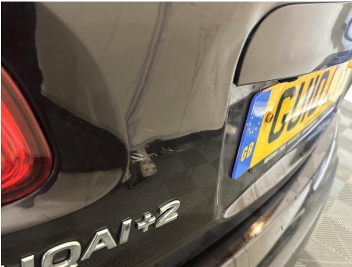
11: Tailgate Dented With Paint Damage