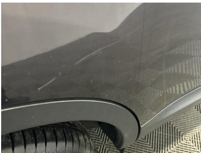
8: Door osr Scratched Over 25mm Not Thru Paint