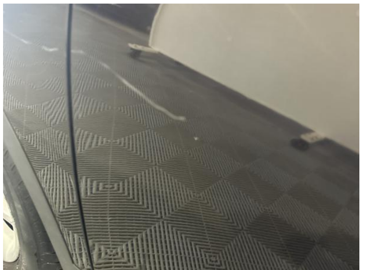
14: Door nsf Scratched Over 25mm Thru Paint