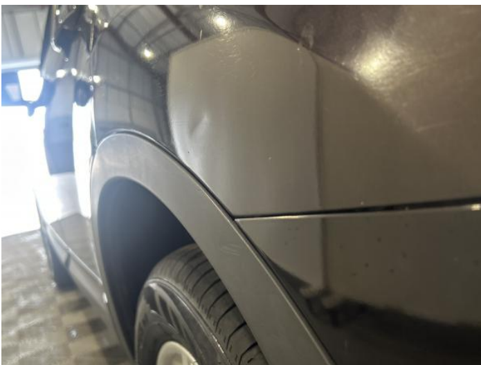
19: Qtr Panel nsr Dented Between 10mm + 30mm