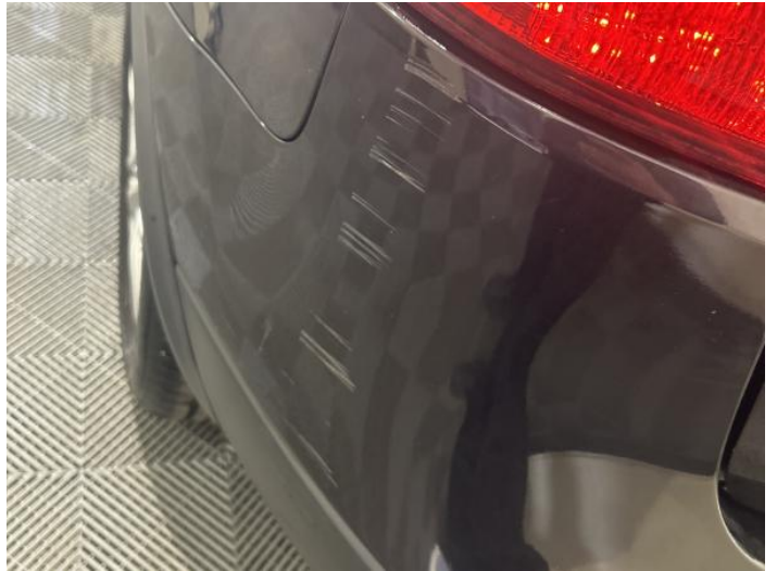
10: Bumper Rear Scratched Over 100mm Thru Paint