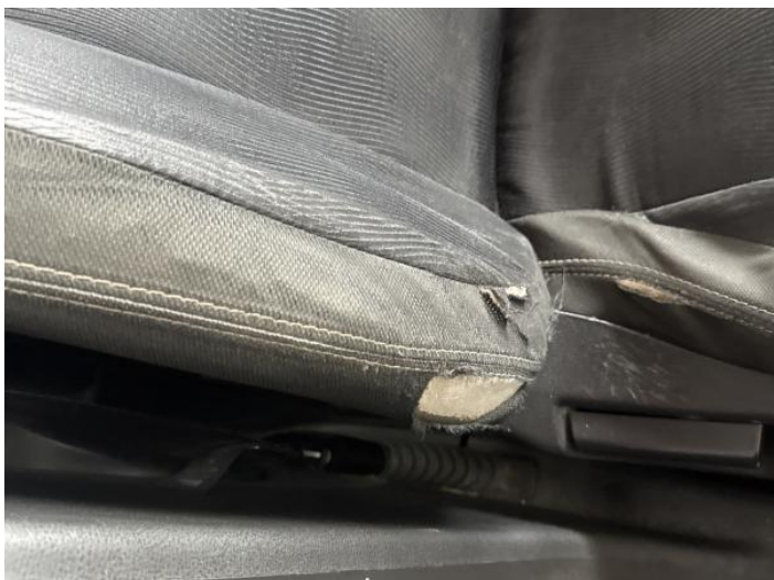
3: Seat Back Cover osf Torn Over 3mm