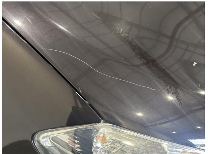
18: Bonnet Scratched Over 25mm Thru Paint