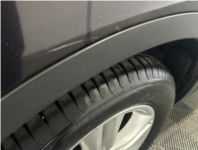
9: Qtr Panel osr Scratched Over 25mm Thru Paint