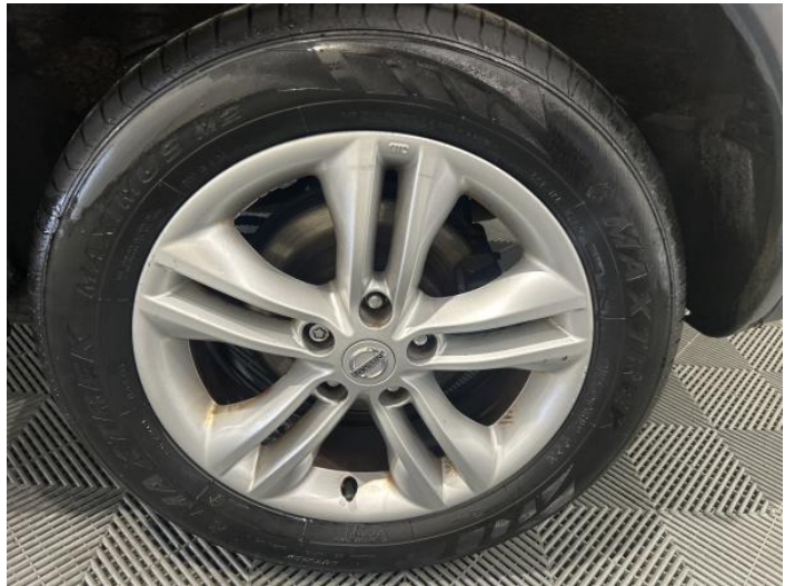
12: Wheel nsr Scratched Up To 50mm