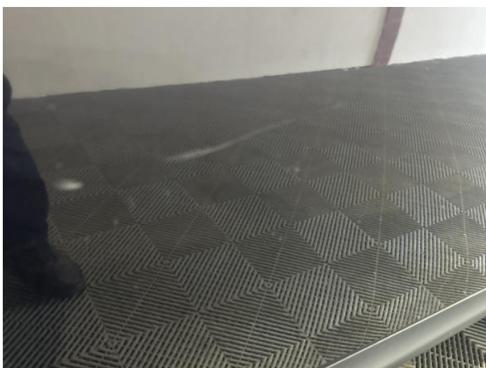
6: Door osf Scratched Over 25mm Thru Paint