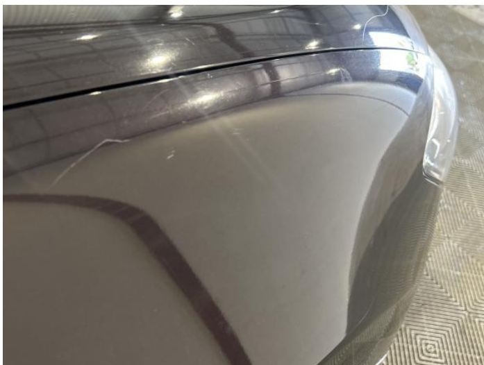
4: Wing osf Scratched Over 25mm Not Thru Paint