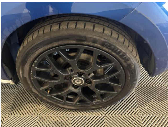
19: Wheel osf Scratched Over 50mm