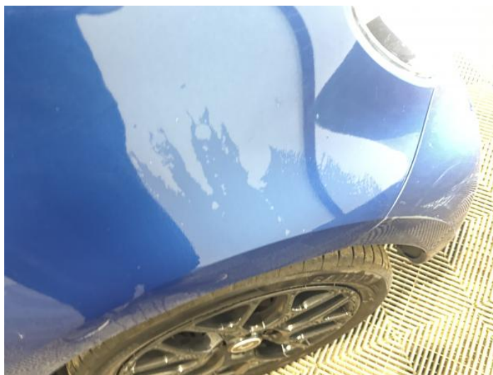
18: Wing nsf Chipped 1 To 5