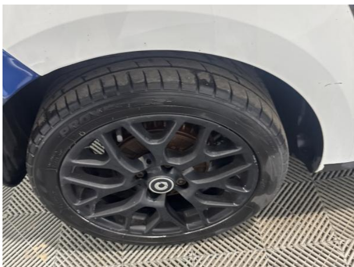
13: Wheel osr Scratched Over 50mm