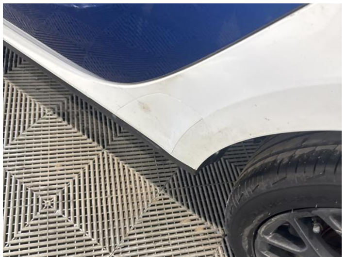
8: Qtr Panel nsr Dented With Paint Damage