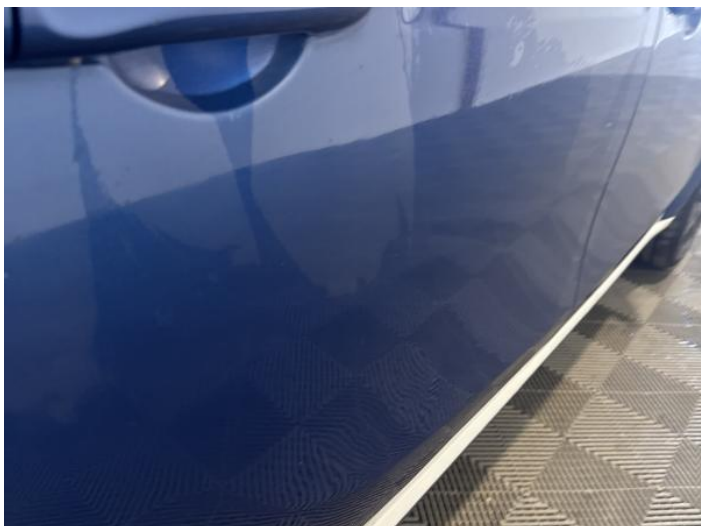
15: Door osr Chipped 1 To 5