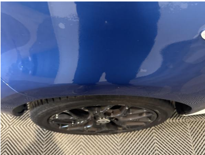
5: Wing nsf Chipped 1 To 5