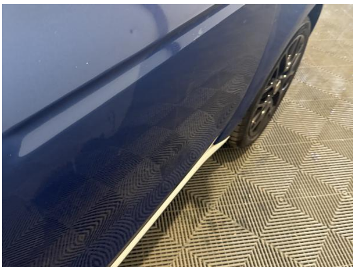
17: Door osf Dented Between 10mm + 30mm