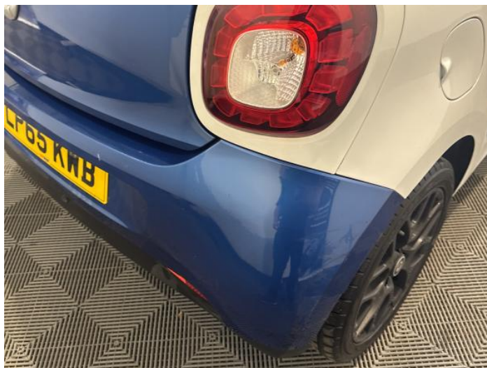
10: Bumper Rear Scratched 25 to 100mm Thru Paint