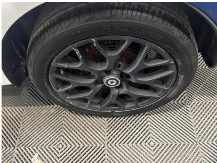
9: Wheel nsr Scratched Over 50mm