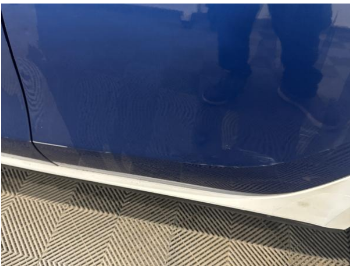
7: Door nsr Dented With Paint Damage