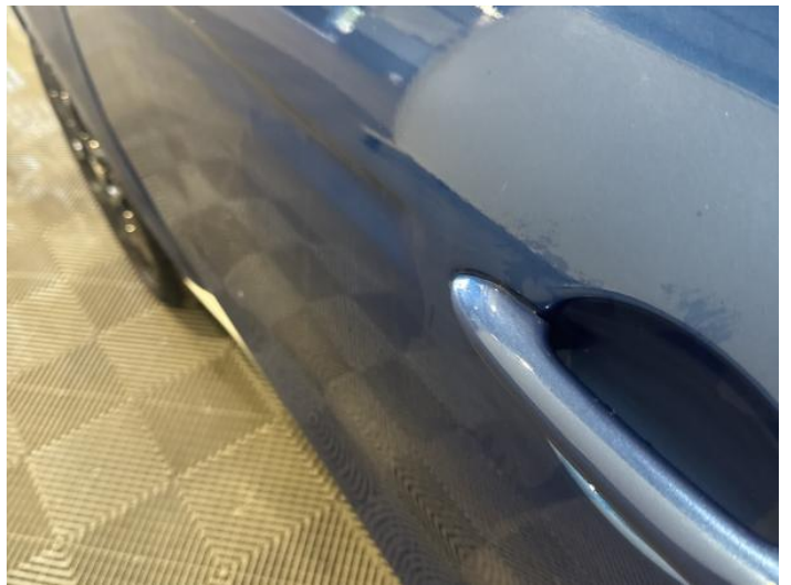
6: Door nsf Dented Over 2 UpTo 10mm