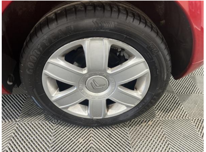
4: Wheel nsr Scratched Over 50mm