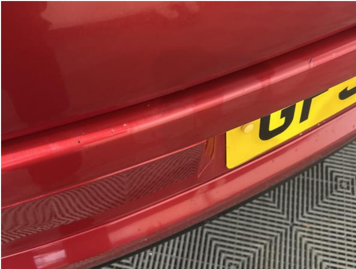
3: Bumper Rear Chipped 1 To 5