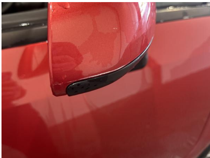
1: Door Mirror Assy osf Scratched (Painted) Over 25mm Thru Paint