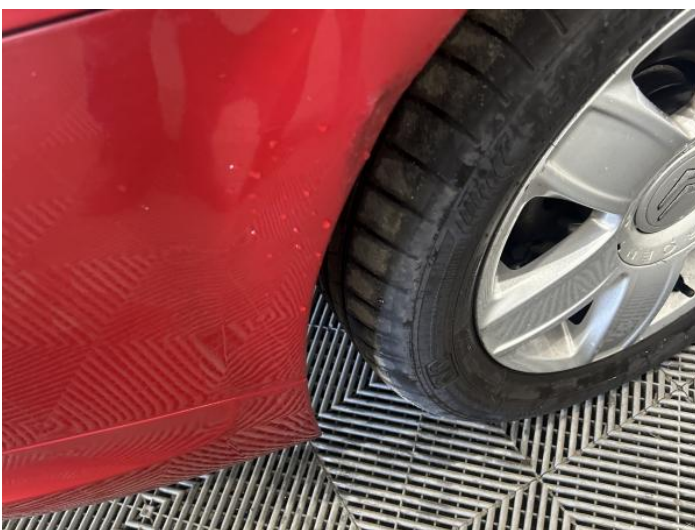
7: Bumper Front Scratched 25 to 100mm Thru Paint