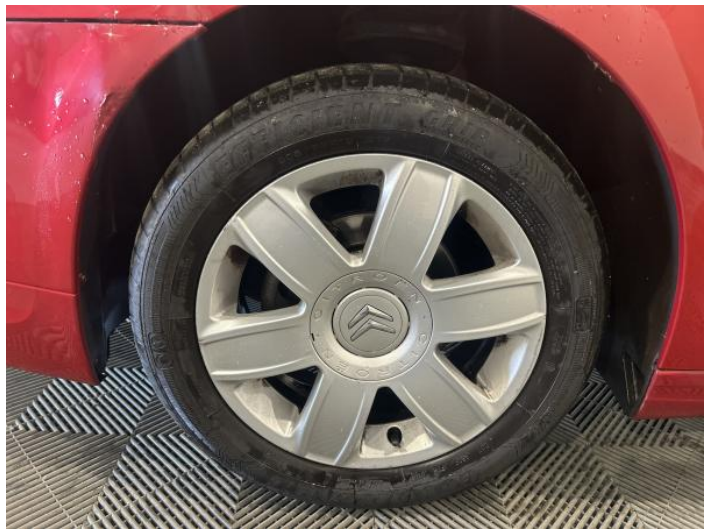
6: Wheel nsf Scratched Up To 50mm