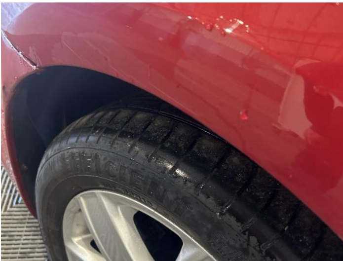
5: Wing nsf Scratched Over 25mm Not Thru Paint