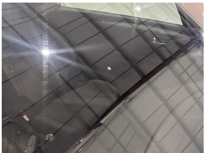
8: Screen Front Chipped Up To 10mm