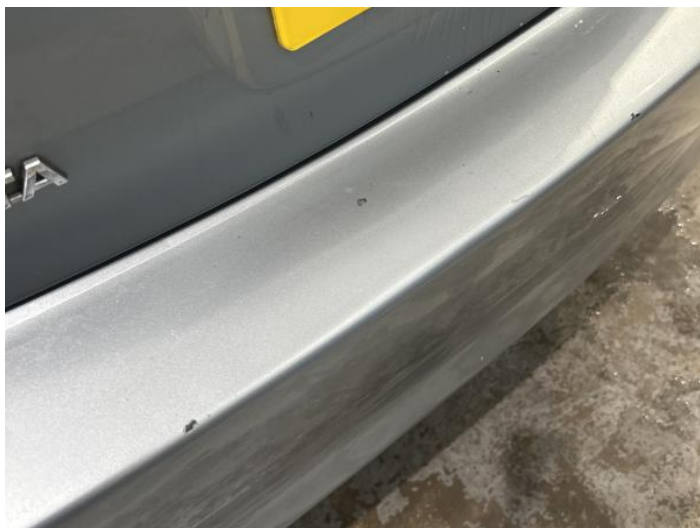
1: Bumper Rear Chipped 1 To 5