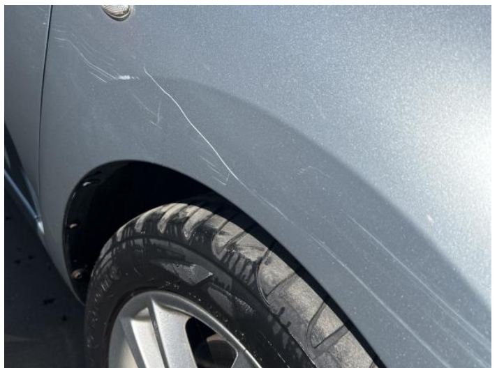
8: Wing osf Scratched Over 25mm Thru Paint