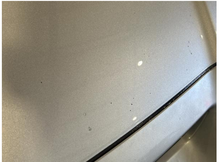
6: Bonnet Chipped Multiple Chips