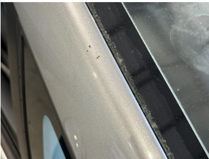
7: A Post os Chipped 1 To 5