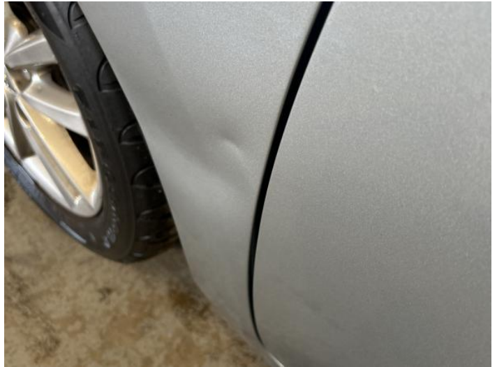
4: Wing nsf Dented Over 30mm