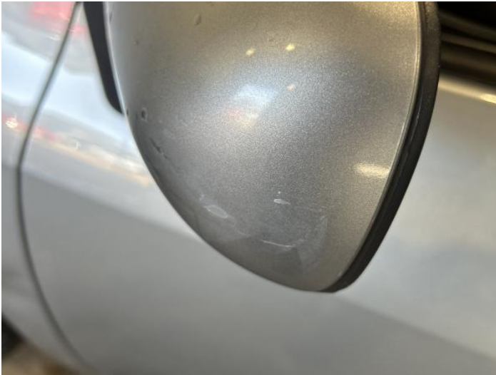
3: Door Mirror Assy nsf Scratched (Painted) Over 25mm Thru Paint