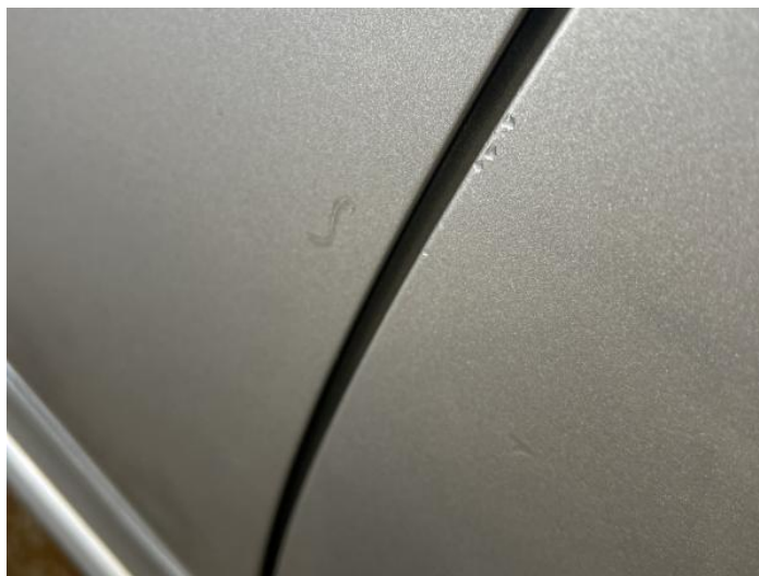
2: Door nsf Scratched UpTo 25mm Thru Paint