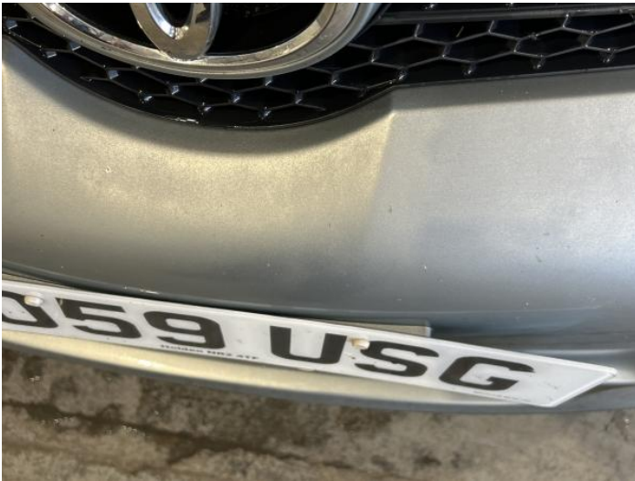
5: Bumper Front Poor Previous Repair Poor Paint