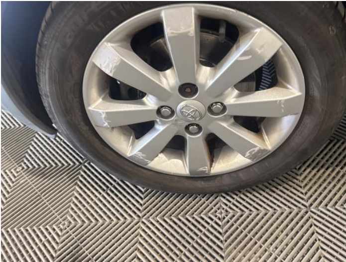
3: Wheel nsf Scratched Over 50mm