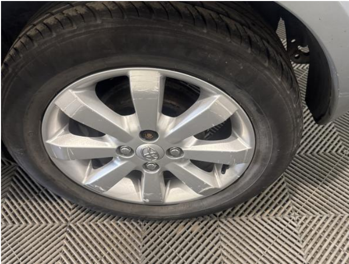
9: Wheel nsr Scratched Over 50mm