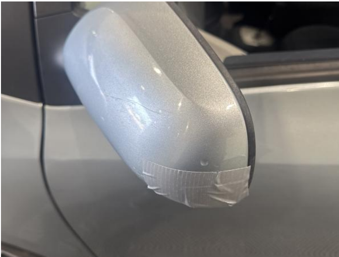
5: Door Mirror Assy nsf Broken Replace