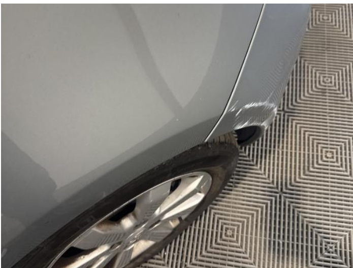
19: Wing osf Chipped 1 To 5