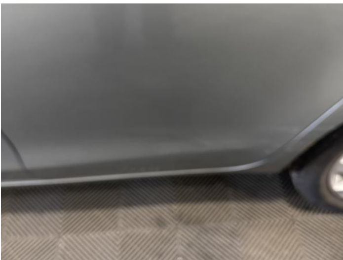
7: Door nsr Scratched Over 25mm Thru Paint