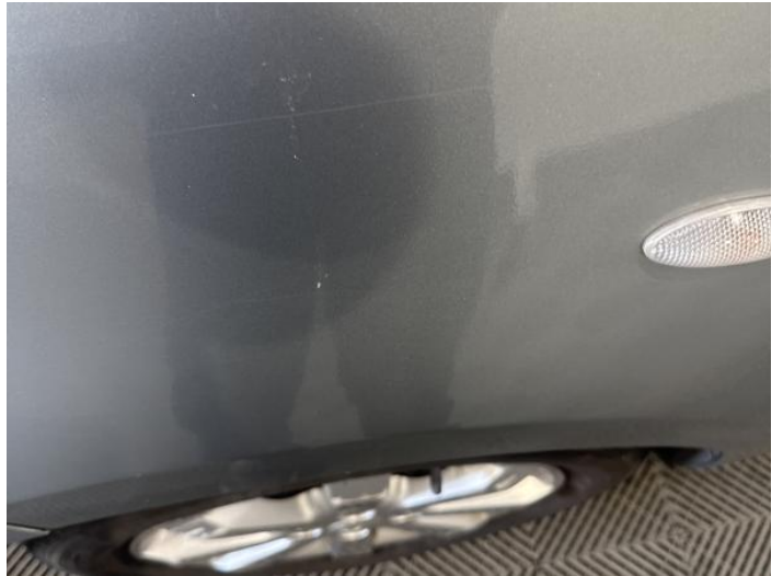
4: Wing nsf Chipped 1 To 5