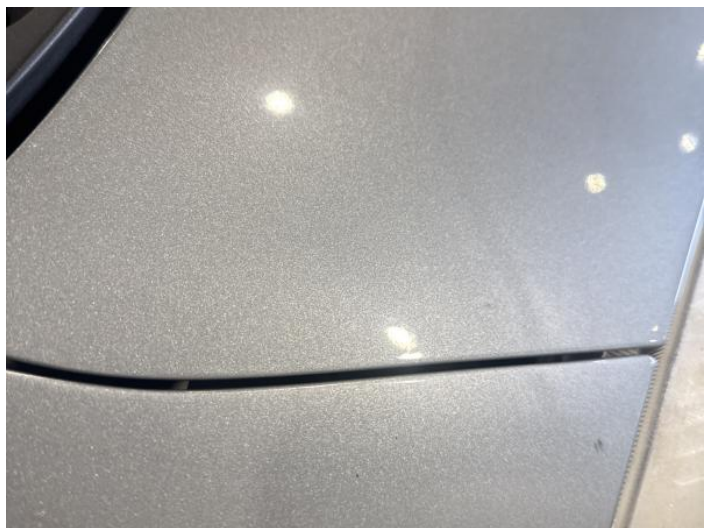
20: Bonnet Dented 2 Or Less UpTo 10mm