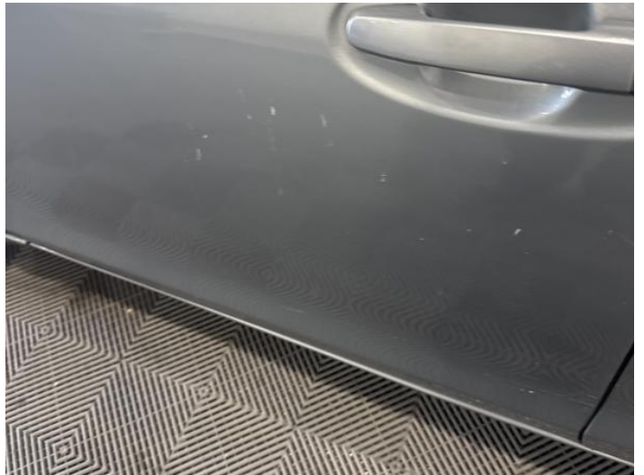
6: Door nsf Chipped Multiple Chips