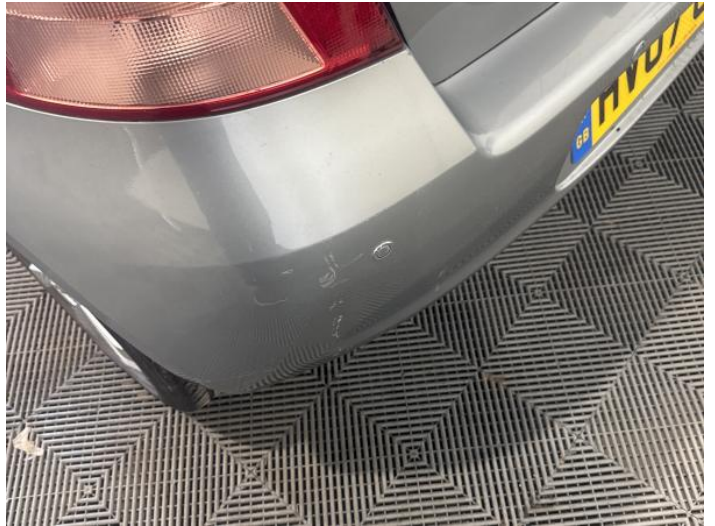
10: Bumper Rear Scratched Over 100mm Thru Paint