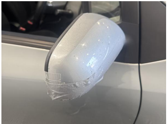
18: Door Mirror Assy osf Broken Replace