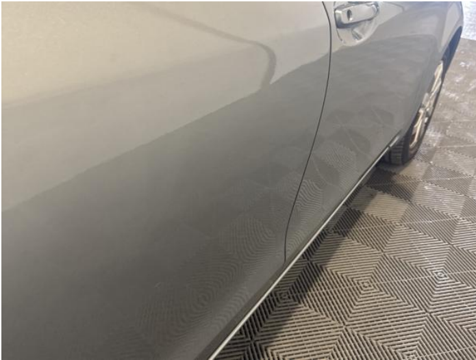
15: Door osr Dented Over 30mm