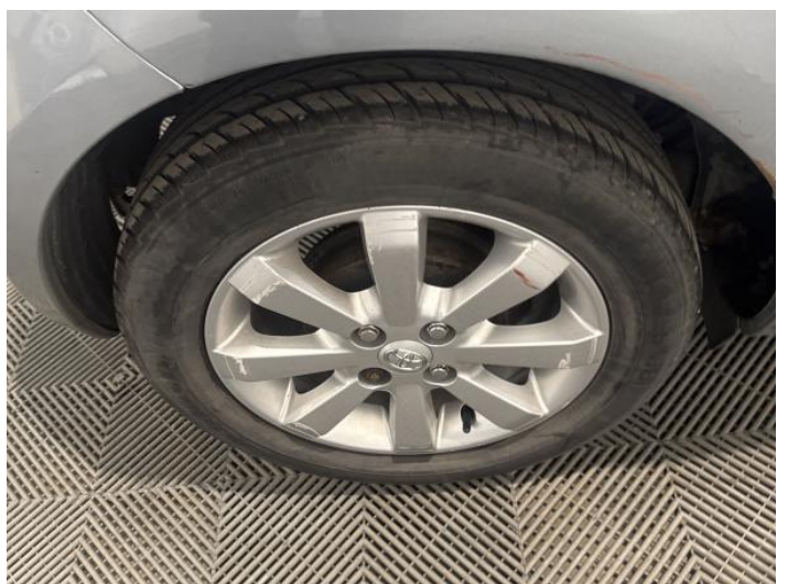
14: Wheel osr Scratched Over 50mm