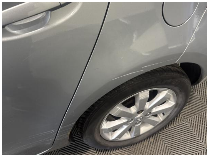
8: Qtr Panel nsr Dented With Paint Damage