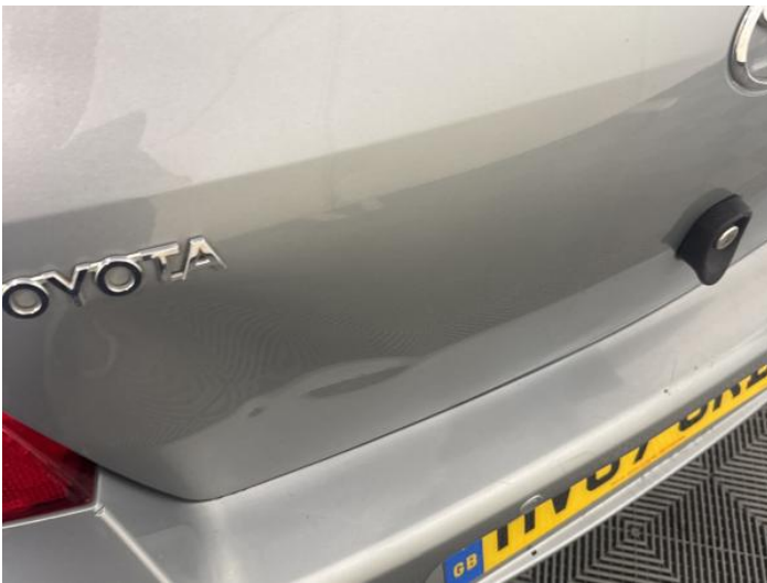
11: Boot Lid Dented Over 30mm