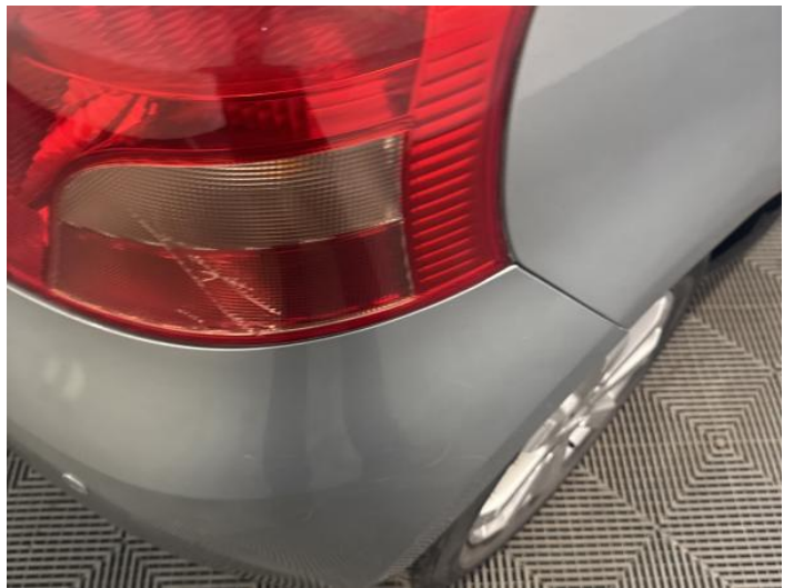
12: Lamp osr Broken Replace