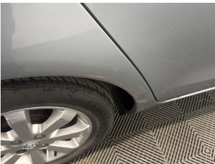
13: Qtr Panel osr Dented With Paint Damage