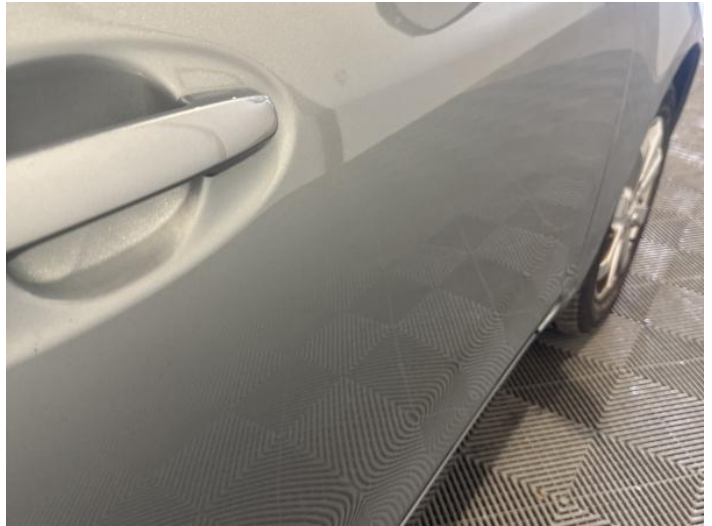
16: Door osf Chipped 1 To 5