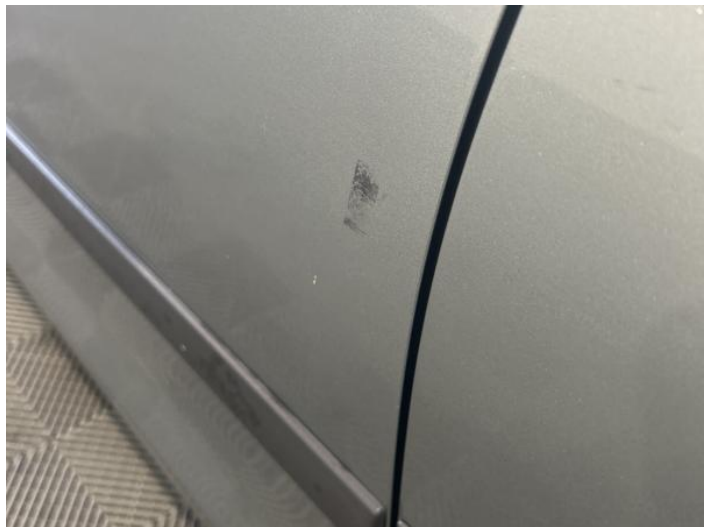
6: Door nsf Scratched Over 25mm Not Thru Paint