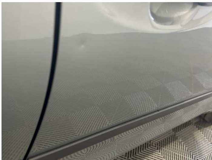
1: Door osf Dented 2 Or Less UpTo 10mm