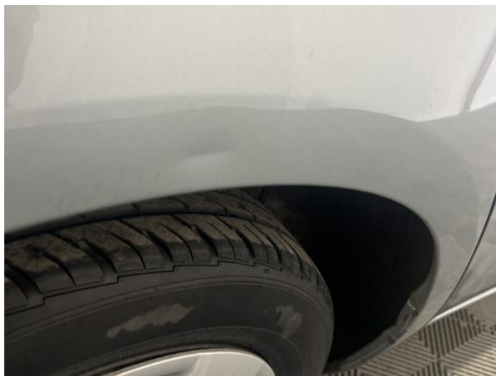
2: Qtr Panel osr Dented Between 10mm + 30mm