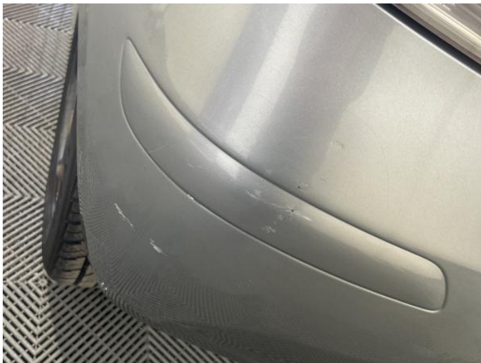
3: Bumper Rear Scratched 25 to 100mm Thru Paint