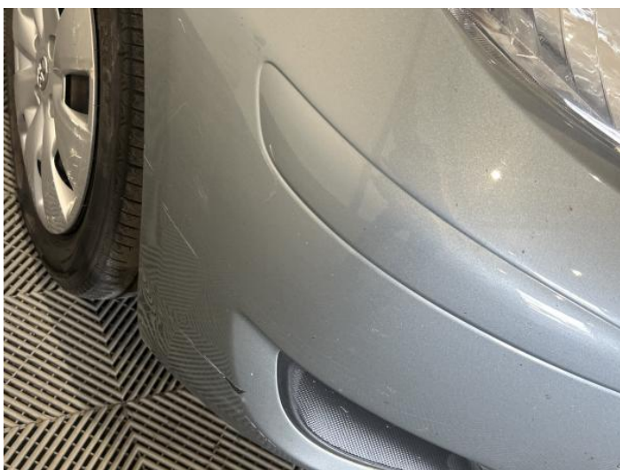
7: Bumper Front Scratched Over 100mm Thru Paint