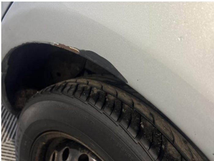
5: Qtr Panel nsr Scratched Over 25mm Thru Paint