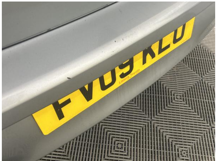
4: Bumper Rear Chipped Multiple Chips