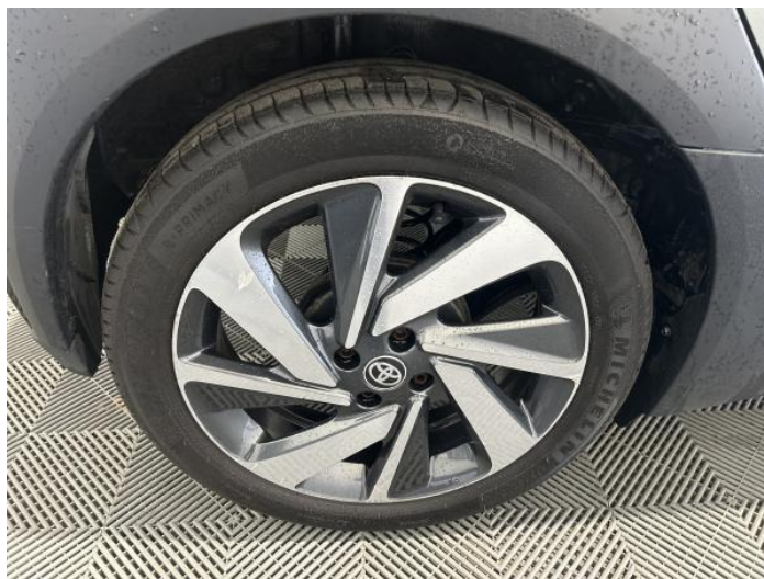
2: Wheel osr Scratched Over 50mm