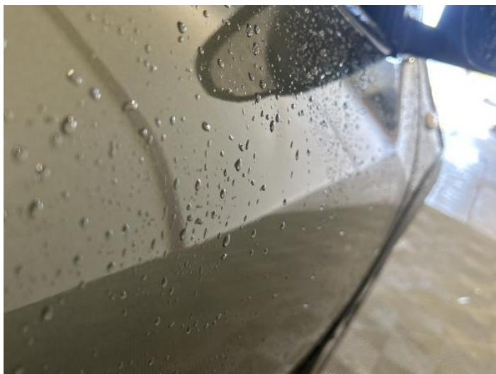
1: Door osf Dented Between 10mm + 30mm