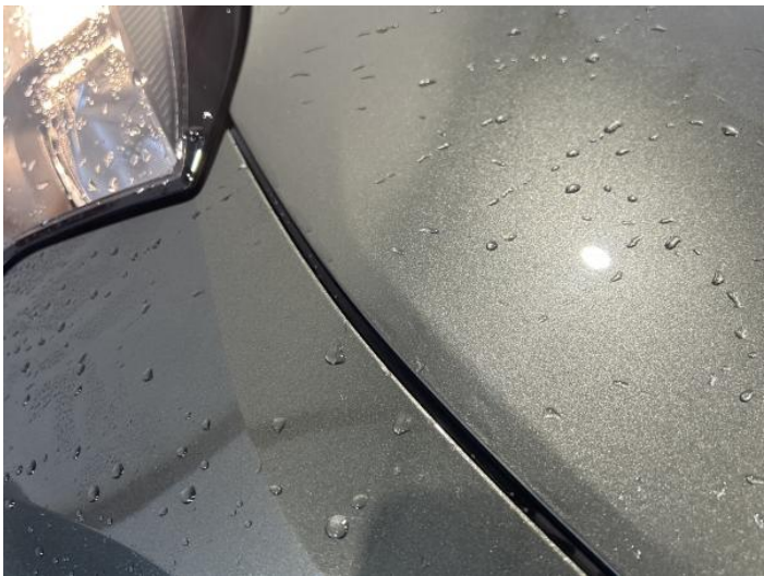
4: Bonnet Dented Over 30mm