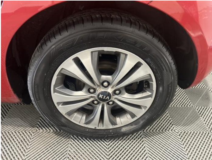
4: Wheel nsr Corroded Light