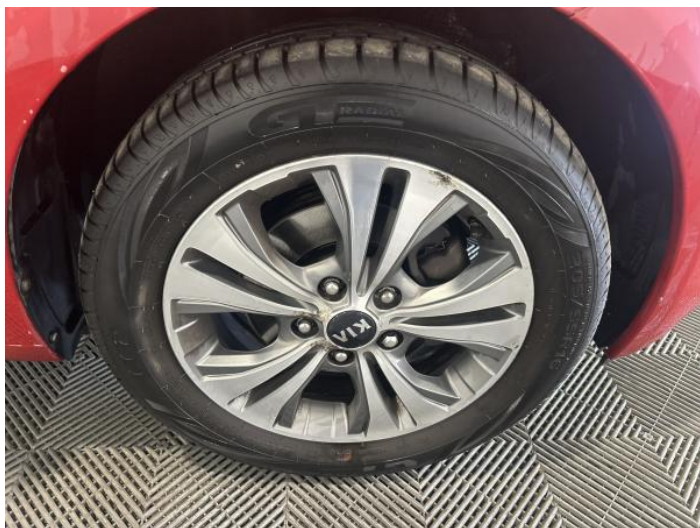
1: Wheel osf Corroded Light