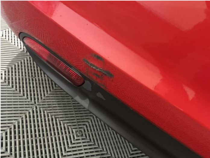
3: Bumper Rear Scratched 25 to 100mm Thru Paint