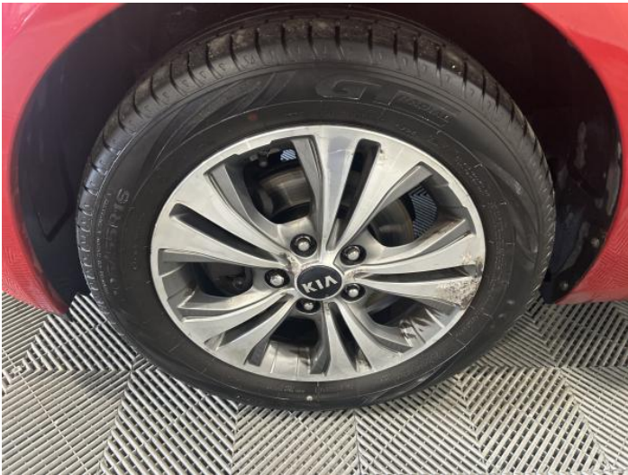
5: Wheel nsf Corroded Light