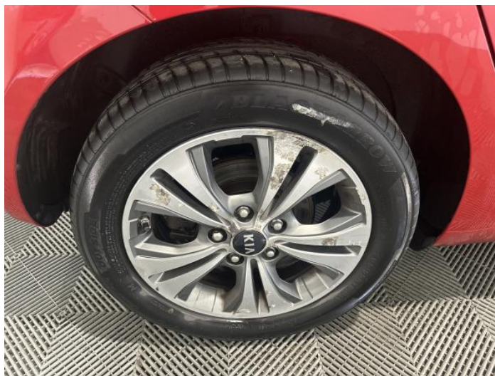
2: Wheel osr Corroded Light