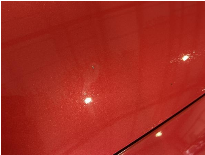
6: Bonnet Chipped 1 To 5