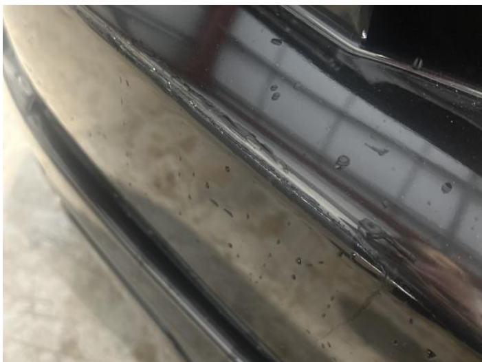
3: Tailgate Scratched Over 25mm Thru Paint