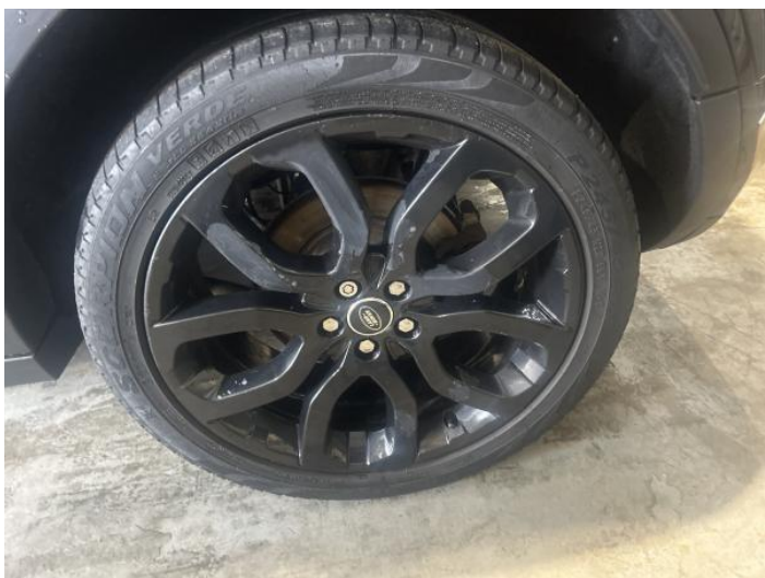
5: Wheel nsr Scratched Over 50mm