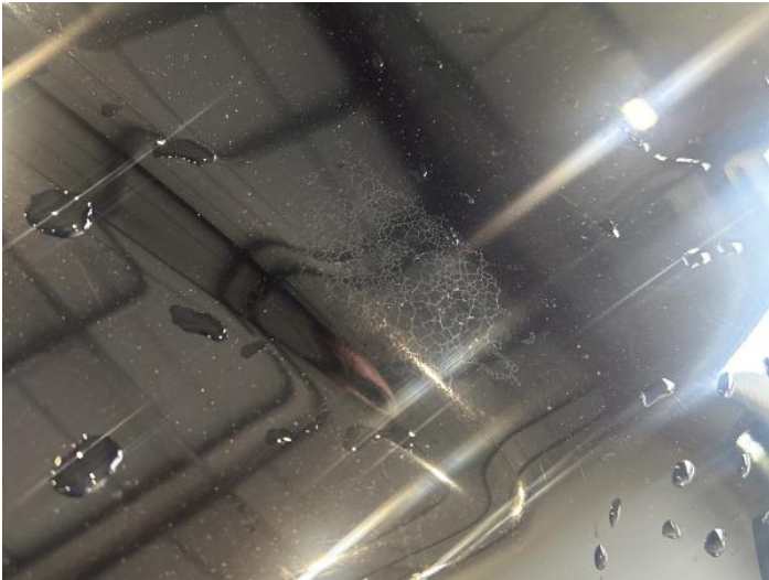
9: Bonnet Poor Previous Repair Poor Paint