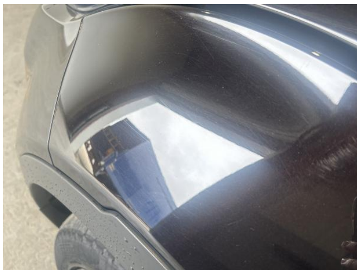
6: Wing nsf Scratched Over 25mm Not Thru Paint