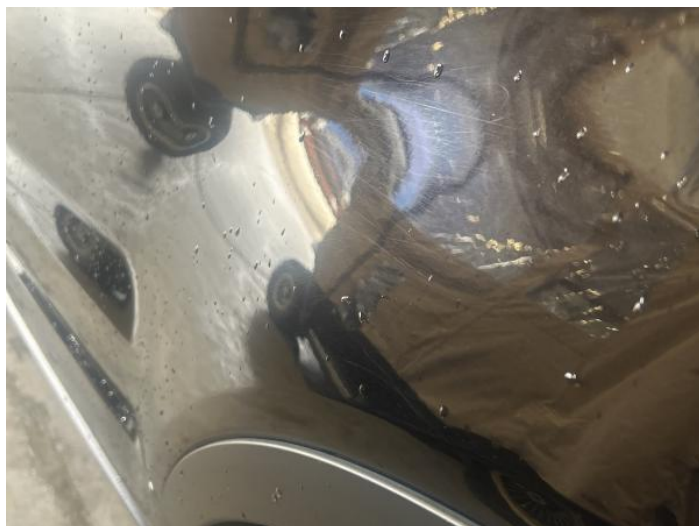
4: Qtr Panel nsr Scratched Over 25mm Not Thru Paint