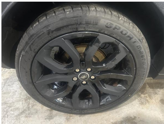
2: Wheel osr Scratched Over 50mm