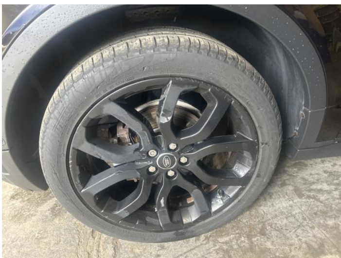
7: Wheel nsf Scratched Over 50mm