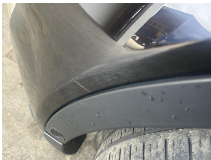
8: Bumper Front Scratched 25 to 100mm Thru Paint