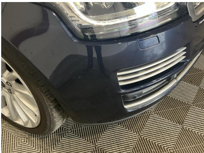
3: Bumper Front Scratched 25 to 100mm Thru Paint