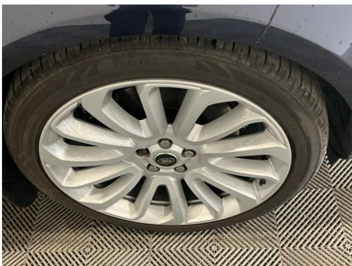
19: Wheel osf Scratched Over 50mm