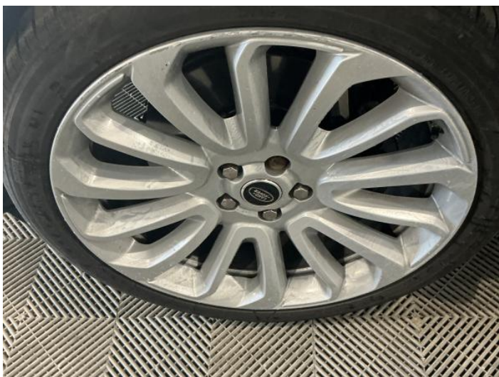
5: Wheel nsf Scratched Over 50mm