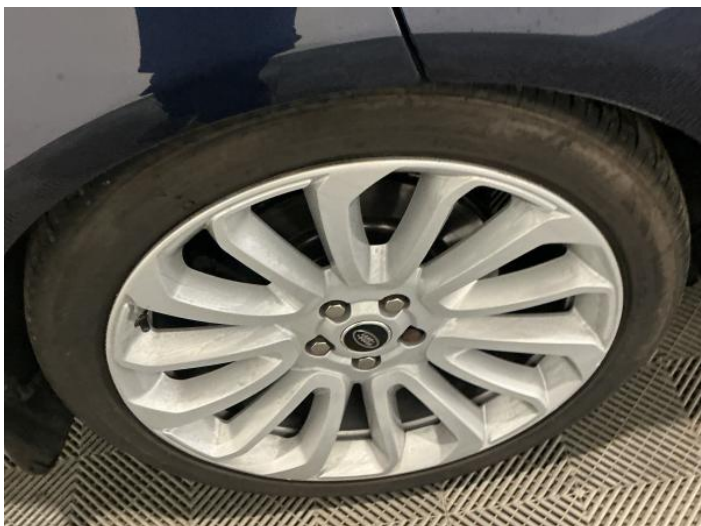
15: Wheel osr Scratched Over 50mm