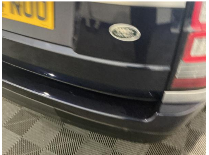
11: Qtr Panel nsr Scratched Over 25mm Not Thru Paint