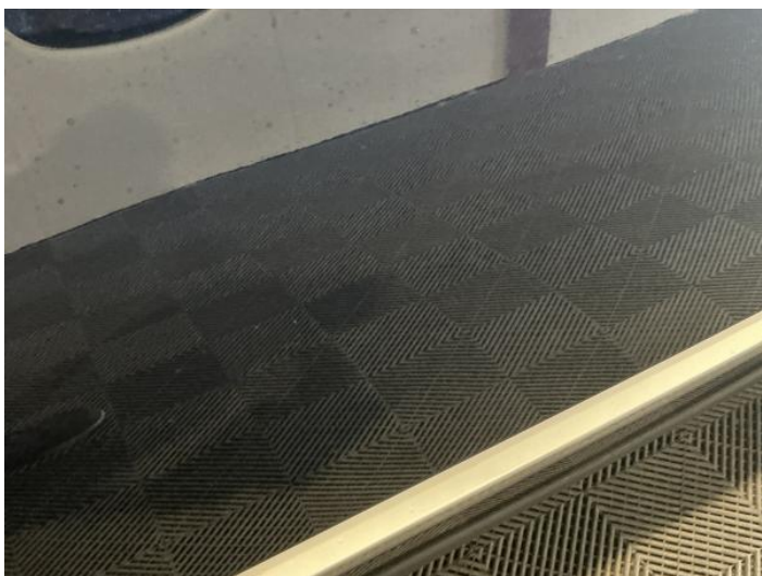
17: Door osf Chipped 1 To 5