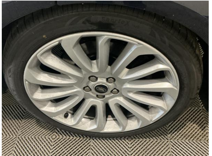
9: Door nsr Scratched Over 25mm Not Thru Paint