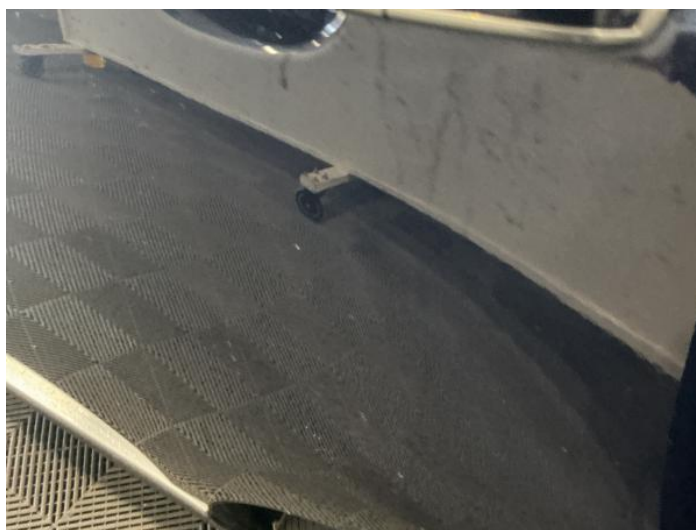
8: Door nsr Chipped 1 To 5