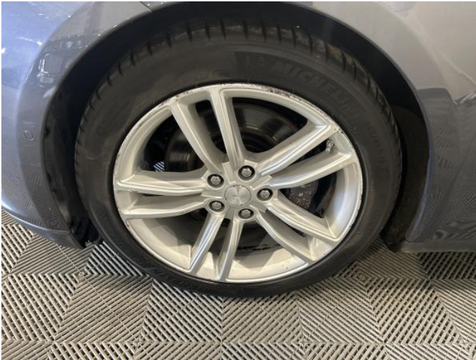
9: Wheel nsf Scratched Over 50mm