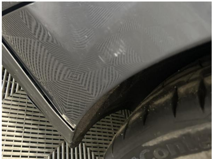
6: Qtr Panel nsr Scratched Over 25mm Thru Paint