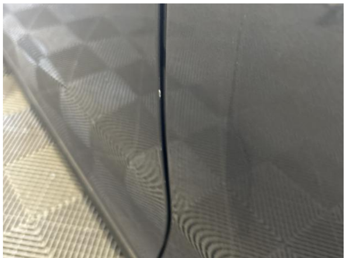
8: Door nsf Chipped Edge Chip