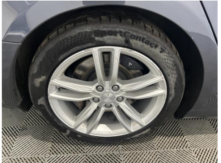
4: Wheel osr Scratched Over 50mm