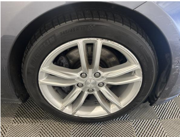
1: Wheel osf Scratched Over 50mm