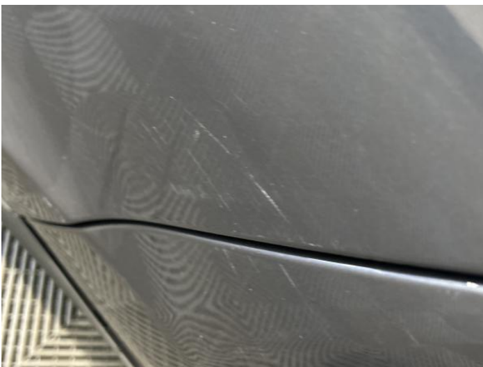
7: Door nsr Scratched Over 25mm Not Thru Paint