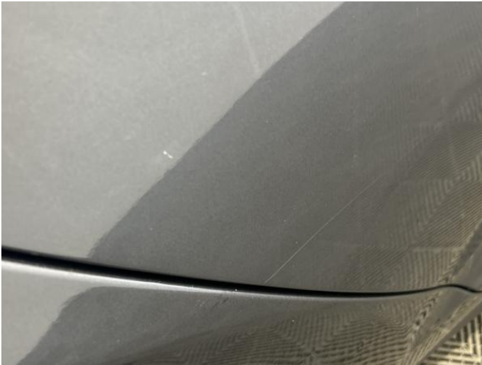
3: Door osr Chipped 1 To 5