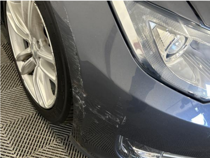
10: Bumper Front Scratched Over 100mm Thru Paint

Carpet Condition Average Seat Condition Average