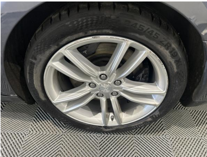
5: Wheel nsr Scratched Over 50mm