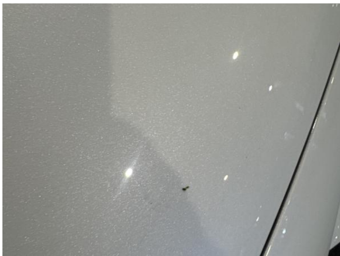
1: Bonnet Chipped 1 To 5