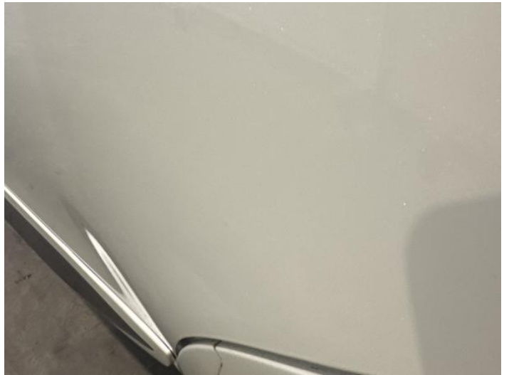
12: Door nsr Dented Over 30mm