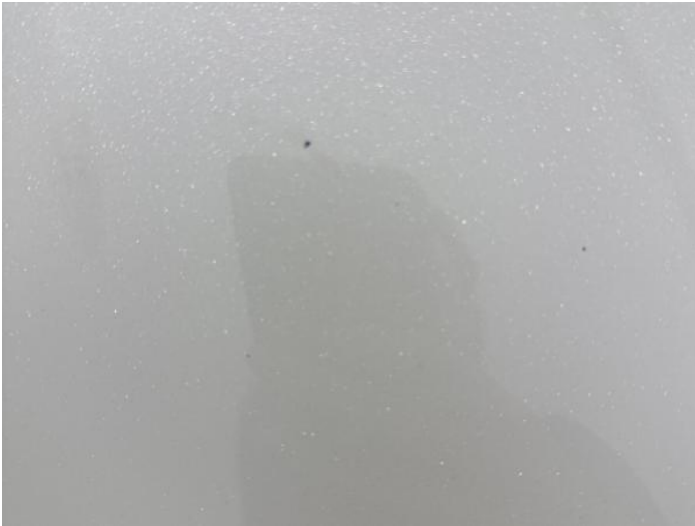
3: Wing osf Chipped 1 To 5