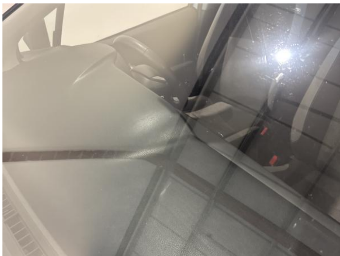
15: Screen Front Chipped UpTo 10mm