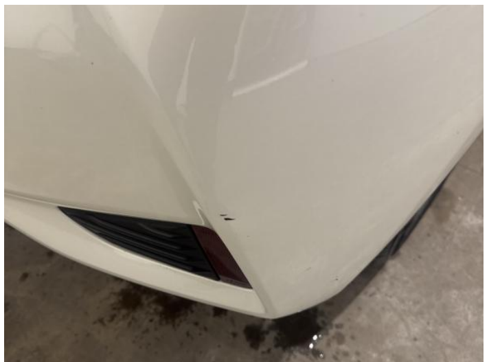
8: Bumper Rear Scratched Over 100mm Thru Paint