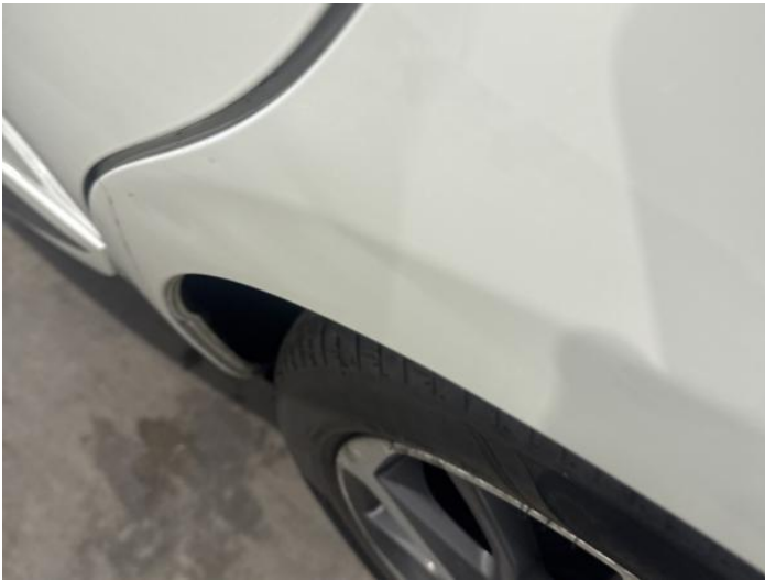
11: Qtr Panel nsr Dented Over 30mm