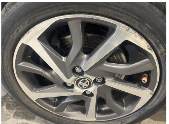
14: Wheel nsf Scratched Over 50mm