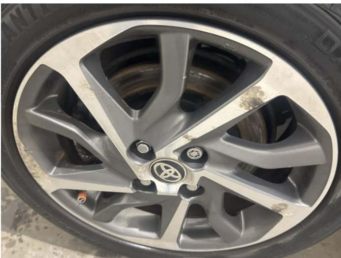
7: Wheel osr Scratched Over 50mm