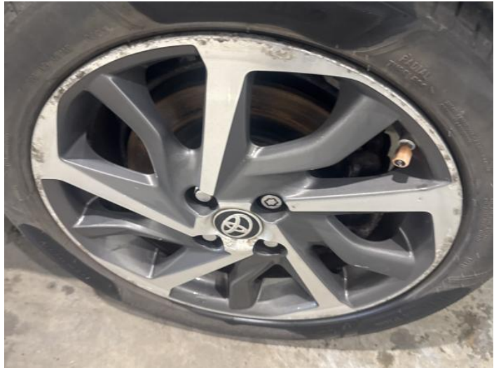
10: Wheel nsr Scratched Over 50mm