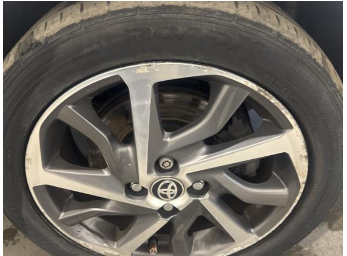
4: Wheel osf Scratched Over 50mm