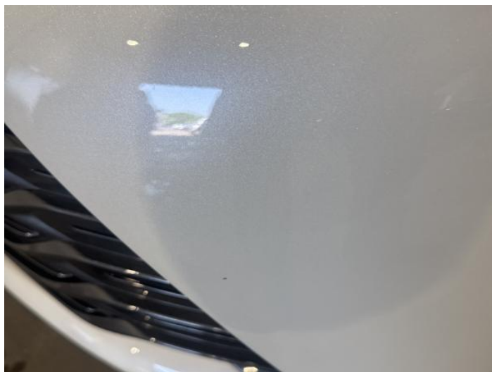
2: Bumper Front Chipped Multiple Chips