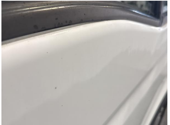
12: Door osf Poor Previous Repair Poor Paint