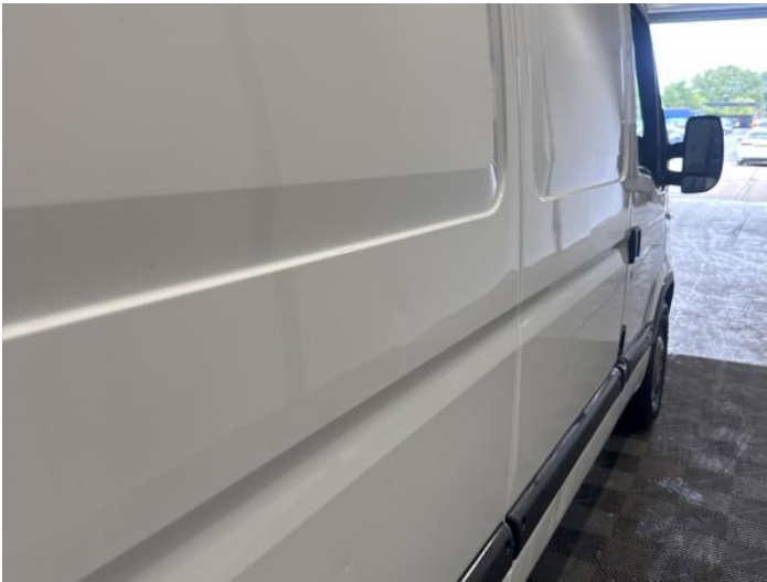
11: Qtr Panel osr Dented Over 30mm