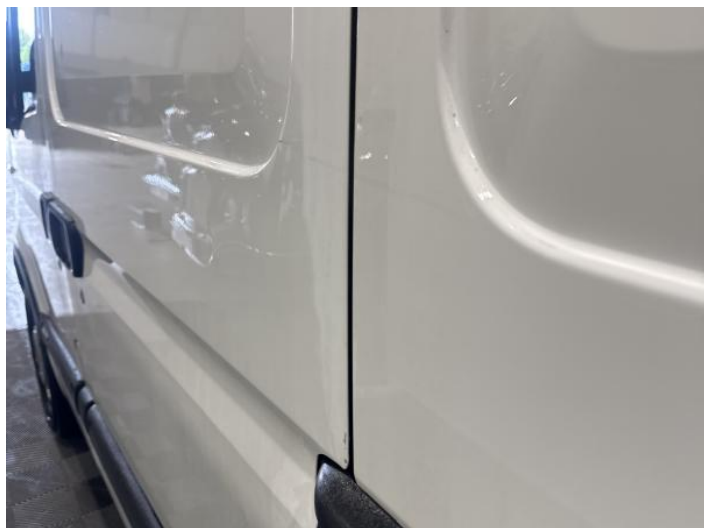
8: Door nsr Dented Over 30mm