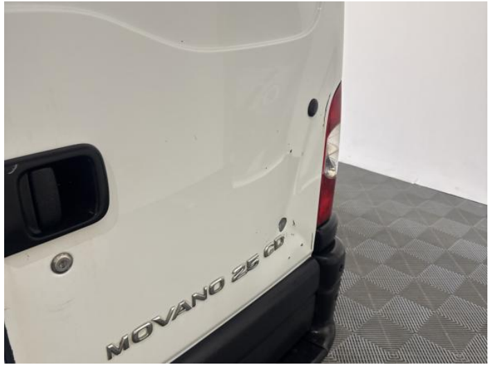
10: Boot Lid Dented With Paint Damage