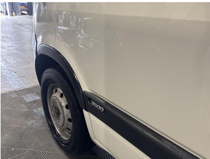
7: Door nsf Dented With Paint Damage