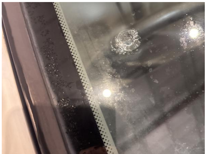
14: Screen Front Chipped Over 10mm