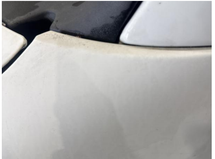
6: Wing nsf Poor Previous Repair Poor Paint