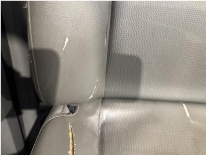
3: Seat Back Cover osf Torn Over 3mm