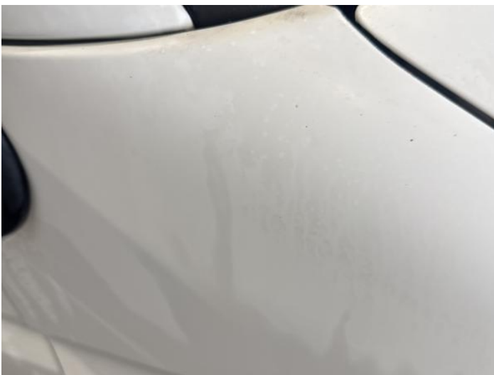
13: Wing osf Poor Previous Repair Poor Paint