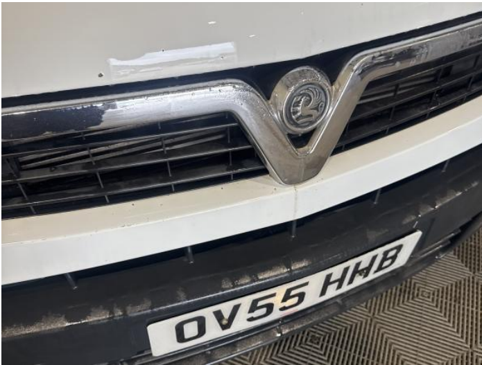
5: Bumper Front Chipped Multiple Chips