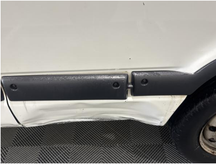
9: Qtr Panel nsr Dented With Paint Damage