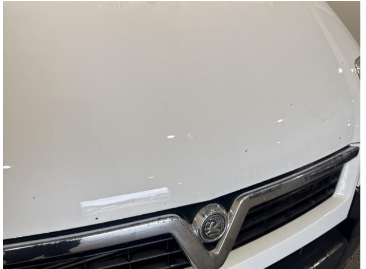
4: Bonnet Chipped Multiple Chips