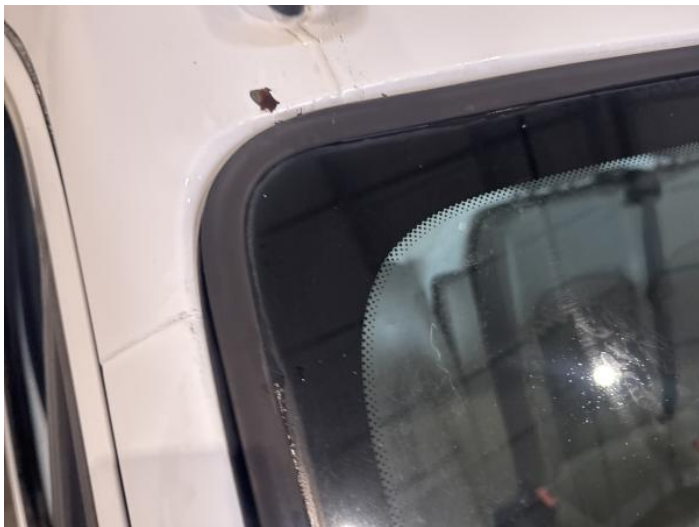
15: Roof Chipped Over 5mm