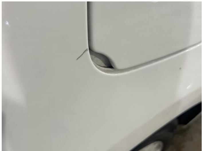
2: Qtr Panel osr Scratched UpTo 25mm Not Thru Paint