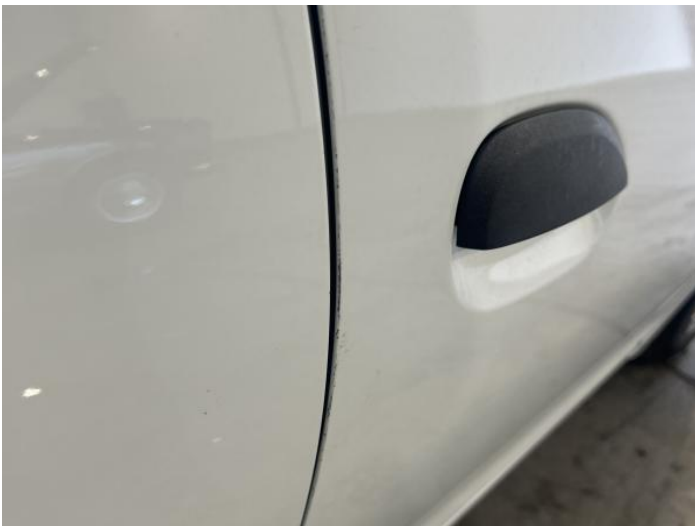
1: Door osf Chipped Edge Chip