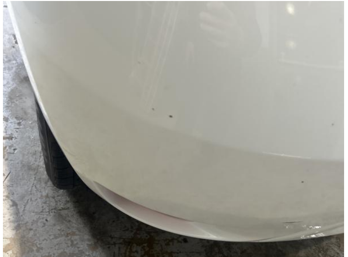
4: Bumper Rear Chipped Multiple Chips