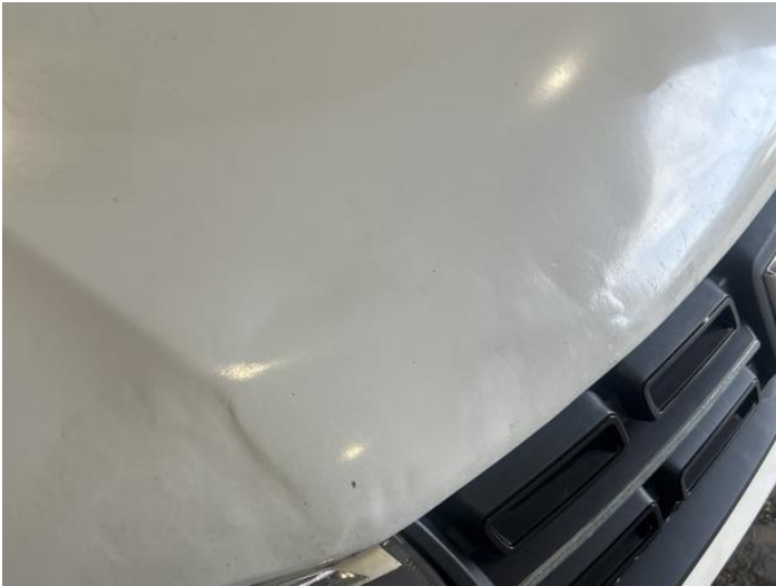
9: Bonnet Poor Previous Repair Poor Paint