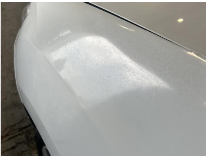
7: Wing nsf Poor Previous Repair Poor Paint