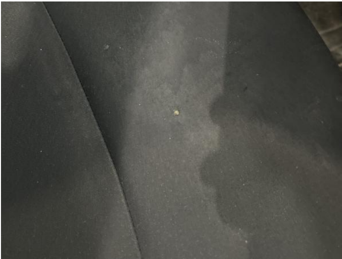
11: Seat Base Cover osf Holed UpTo 3mm