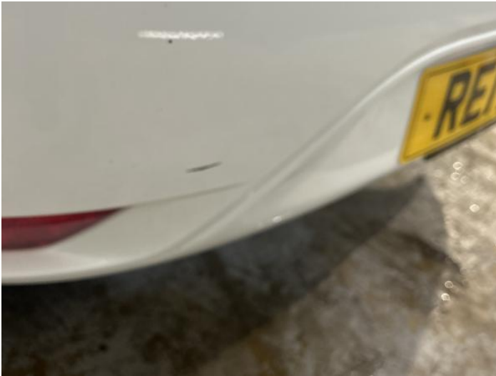
3: Bumper Rear Scratched Up To 25mm Thru Paint