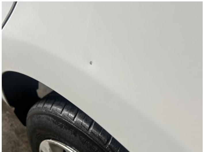
6: Qtr Panel nsr Chipped 1 To 5