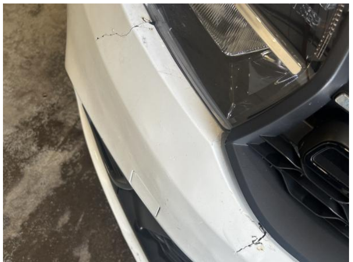
8: Bumper Front Cracked Over 25mm