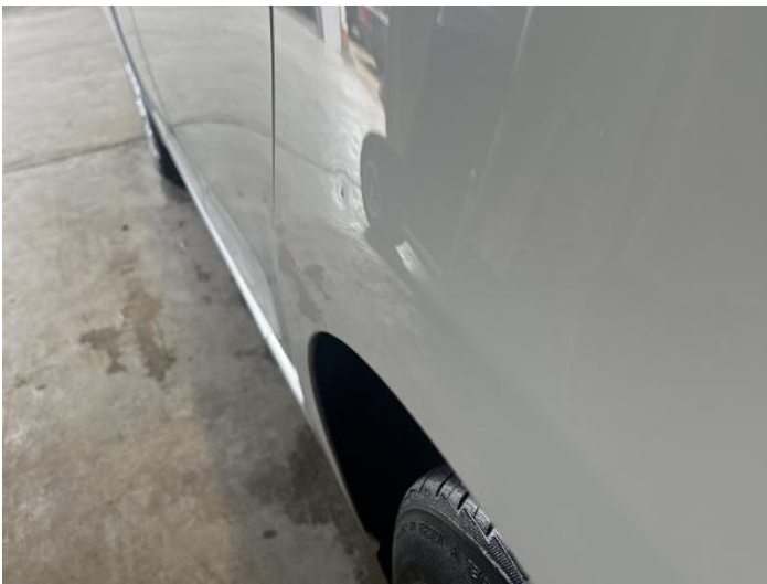
5: Qtr Panel nsr Dented 2 Or Less UpTo 10mm