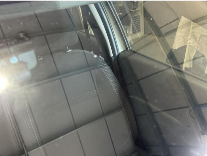
10: Screen Front Chipped UpTo 10mm