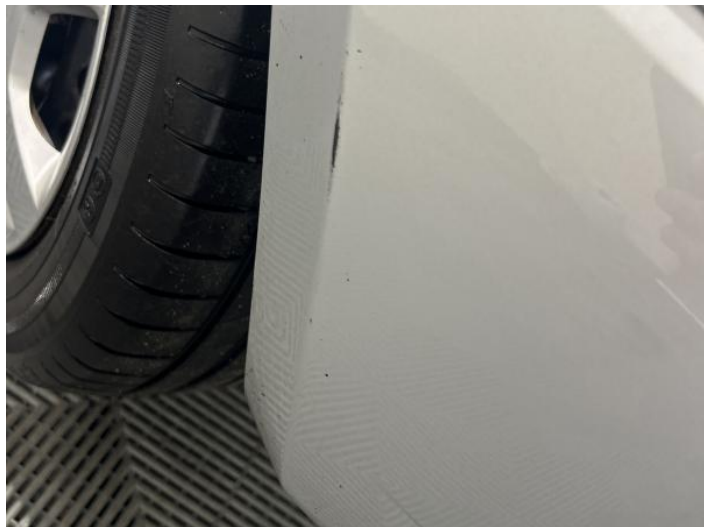
3: Bonnet Chipped 1 To 5