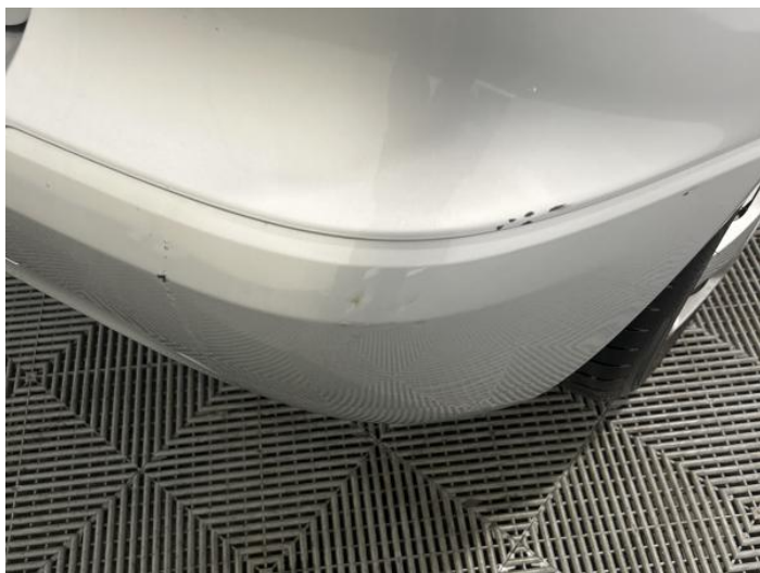
1: Bumper Rear Chipped Multiple Chips