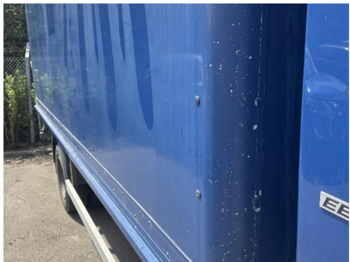
4: Qtr Panel osr Dented With Paint Damage