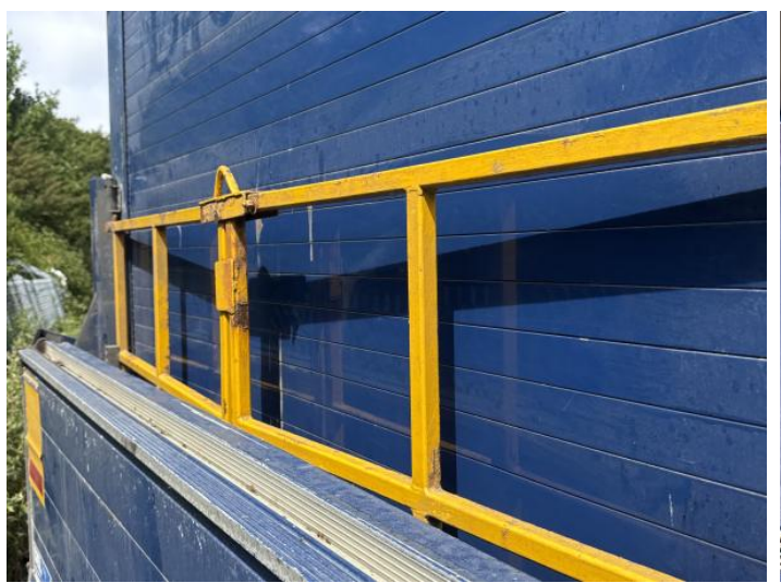
5: Boot Lid Scratched Over 25mm Thru Paint