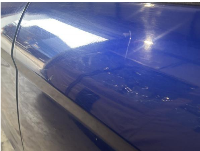
7: Qtr Panel nsr Scratched Over 25mm Not Thru Paint