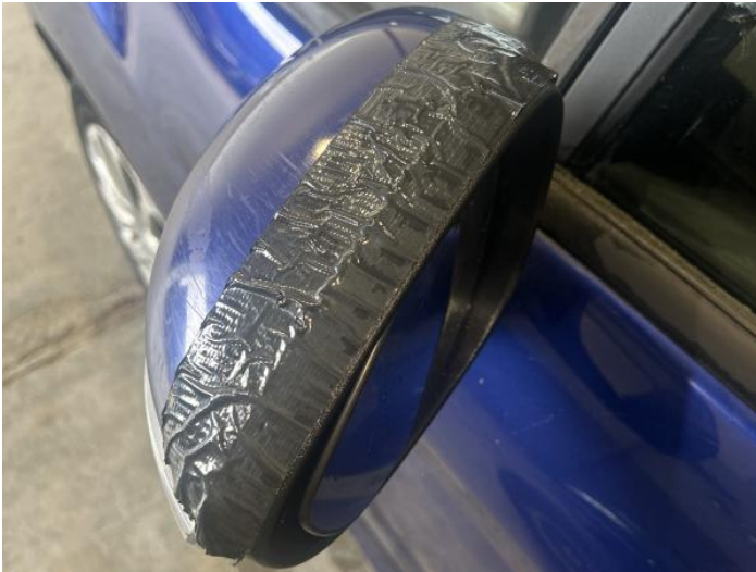
9: Door Mirror Assy nsf Broken Replace