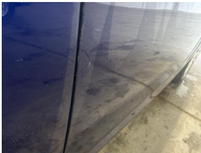
2: Door osf Dented Between 10mm + 30mm