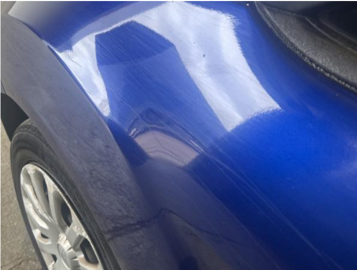
10: Wing nsf Scratched Over 25mm Not Thru Paint