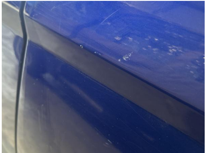
6: Qtr Panel nsr Chipped 1 To 5