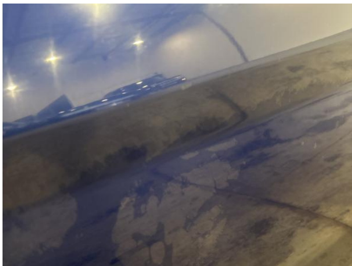
1: Door osf Chipped 1 To 5