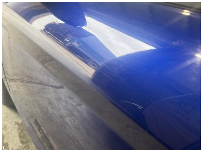
8: Door nsf Scratched Over 25mm Not Thru Paint