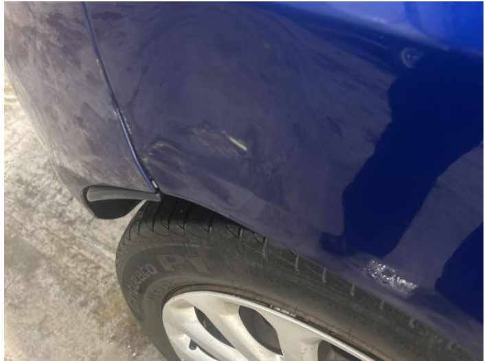
4: Qtr Panel osr Dented With Paint Damage