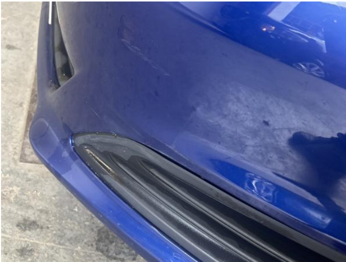
11: Bumper Front Scratched 25 to 100mm Thru Paint

Carpet Condition Average Seat Condition Average