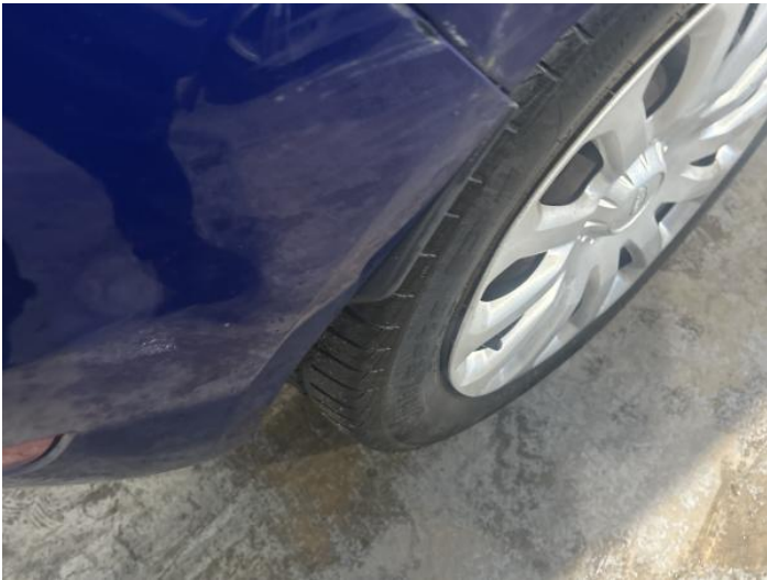
5: Bumper Rear Scratched Over 100mm Thru Paint