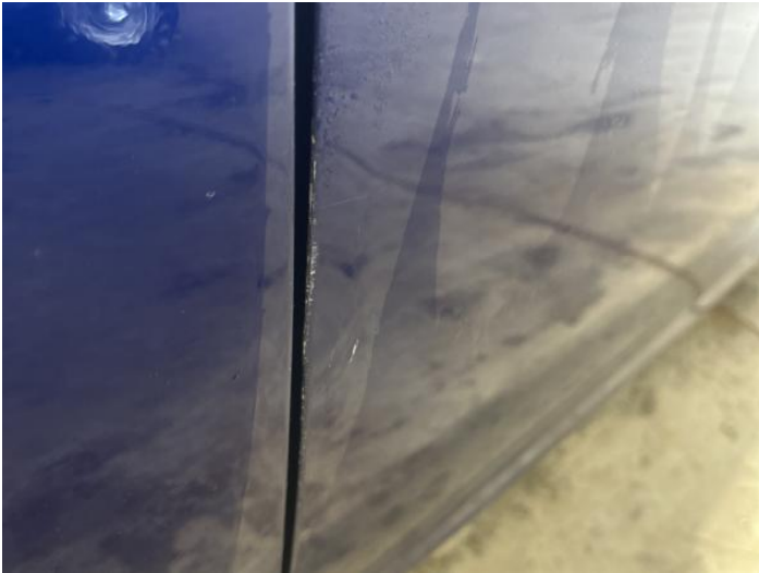
3: Door osf Chipped Edge Chip