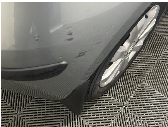
1: Bumper Rear Scratched 25 to 100mm Thru Paint