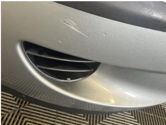
3: Bumper Front Scratched UpTo 25mm Thru Paint