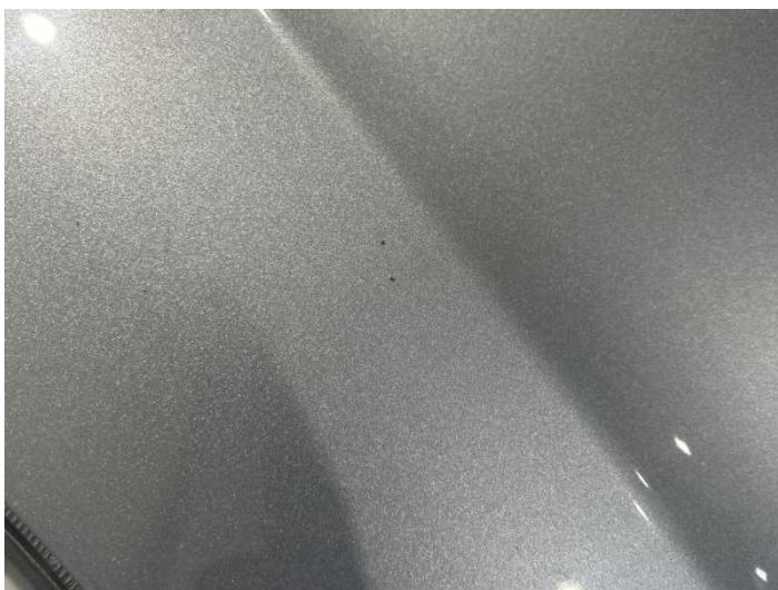
5: Bonnet Chipped 1 To 5