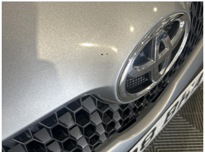
4: Bumper Front Chipped 1 To 5