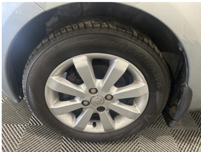
2: Wheel nsf Scratched Over 50mm