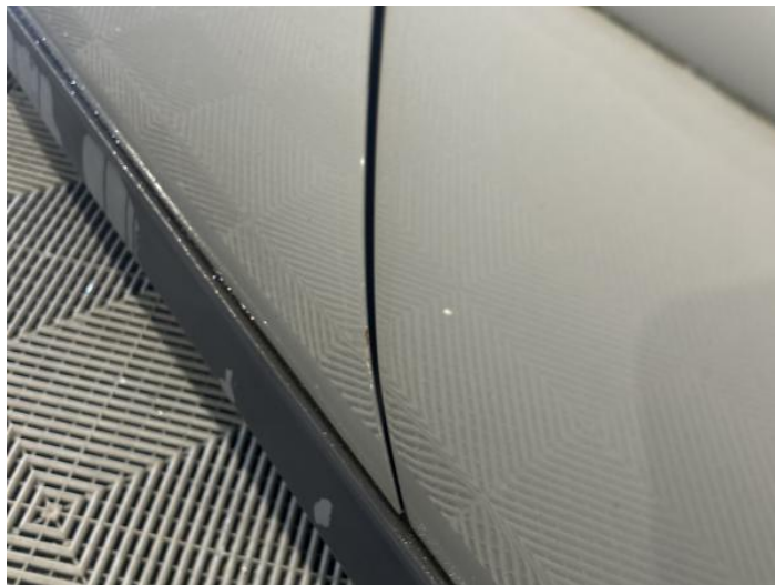
12: Door nsf Chipped Edge Chip