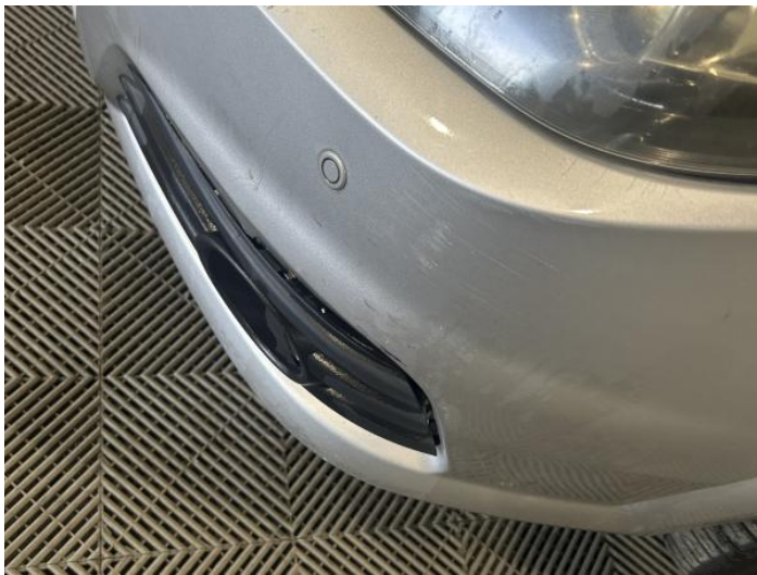
15: Bumper Front Scratched Over 100mm Thru Paint