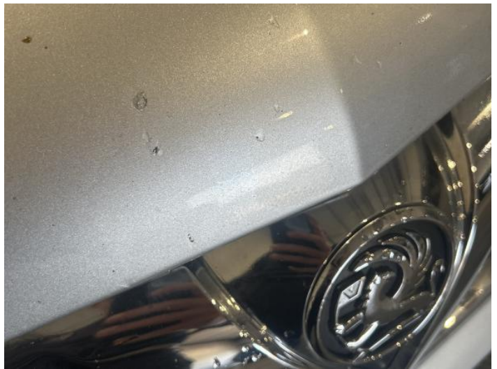
16: Bonnet Chipped 1 To 5