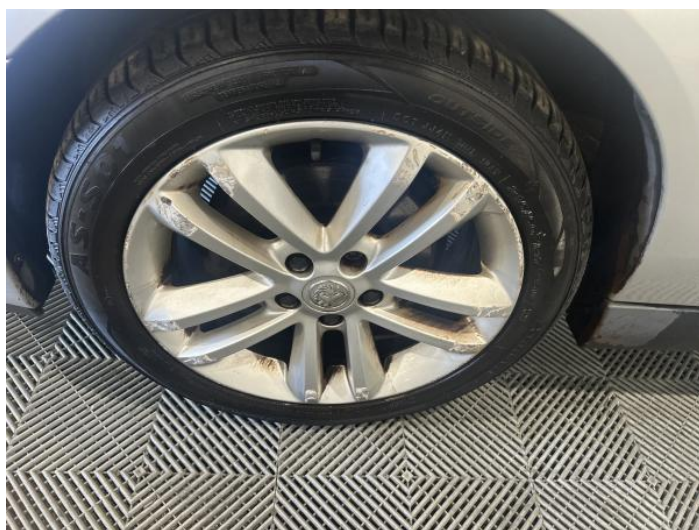
14: Wheel nsf Scratched Over 50mm