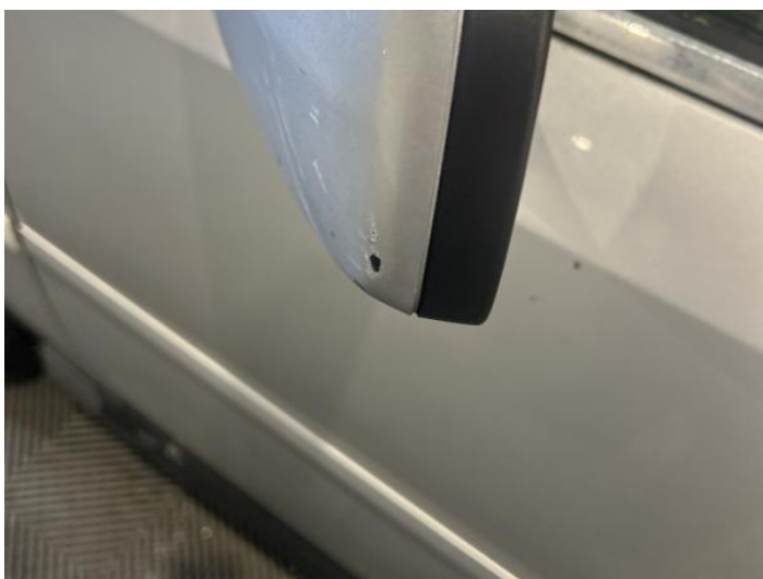
13: Door Mirror Assy nsf Scratched (Painted) UpTo 25mm Thru Paint