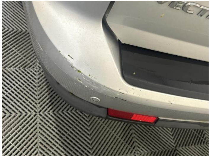
6: Bumper Rear Scratched Over 100mm Thru Paint