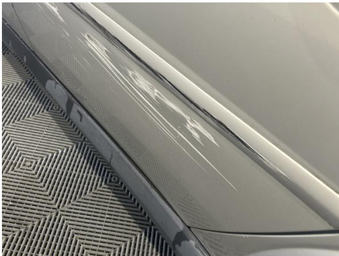
11: Door nsr Scratched Over 25mm Thru Paint