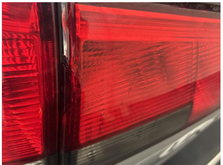
8: Lamp nsr Broken Replace