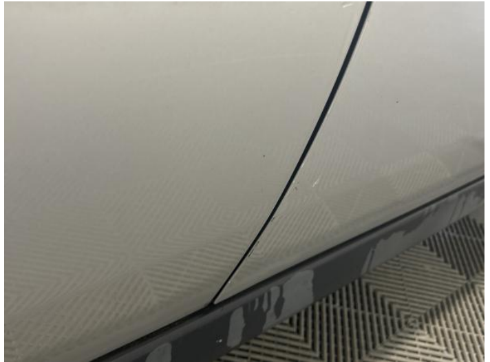
4: Door osr Scratched Over 25mm Not Thru Paint