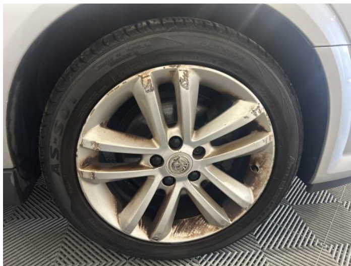
2: Wheel osf Scratched Over 50mm