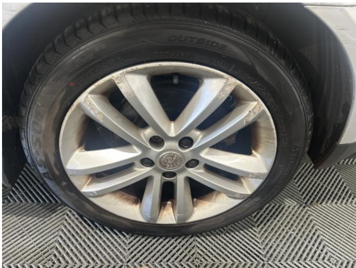
9: Wheel nsr Scratched Over 50mm