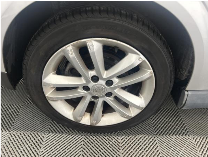
5: Wheel osr Scratched Over 50mm