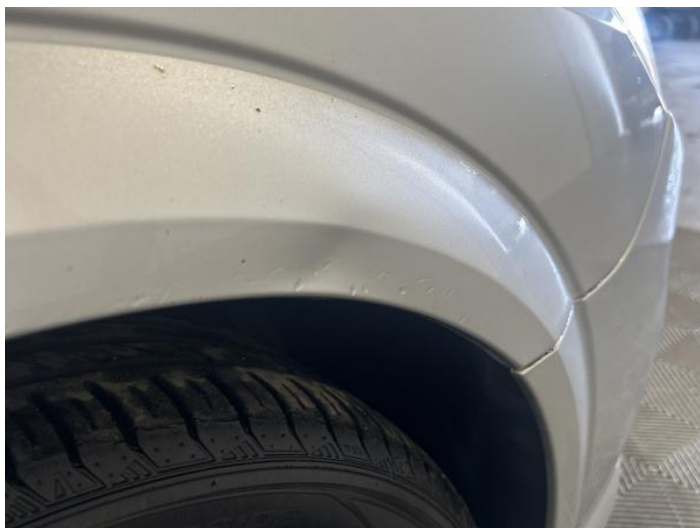
1: Wing osf Dented Between 10mm + 30mm