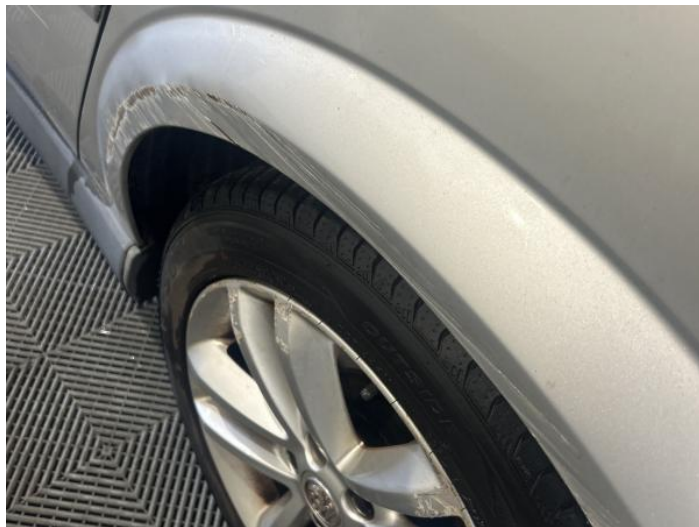
10: Qtr Panel nsr Dented With Paint Damage