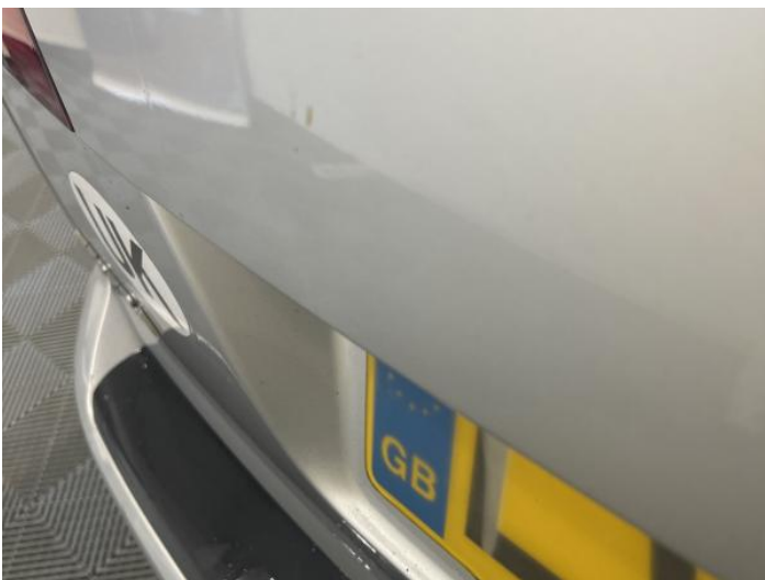
7: Tailgate Dented 2 Or Less UpTo 10mm